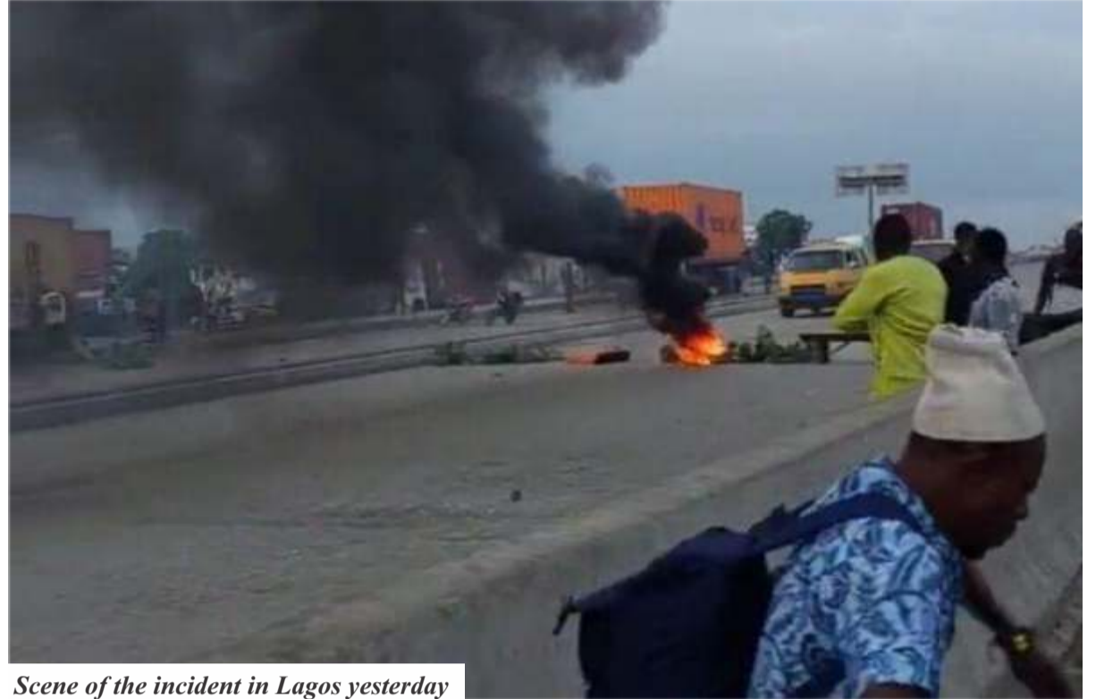
Scene of the incident in Lagos yesterday