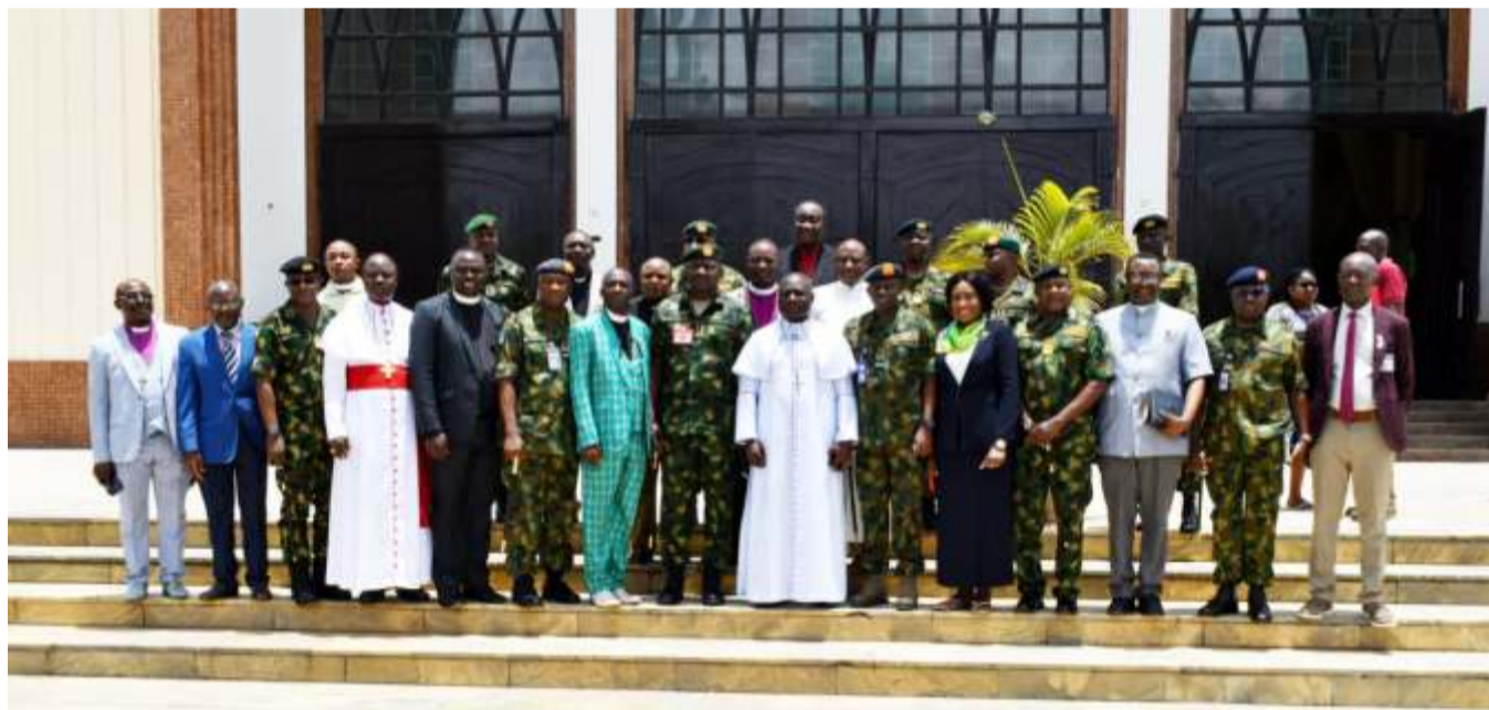
The CDS with CAN officials when he paid them a courtesy visit in Abuja.