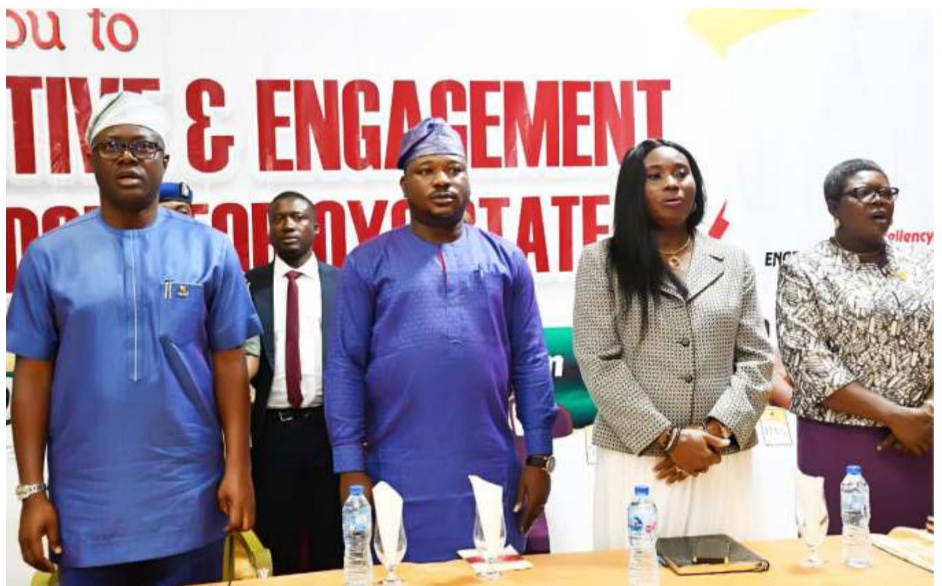
Gov Seyi Makinde at the Budget stakeholders meeting