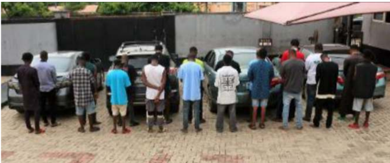
The arrested suspects

EFCC maintained that the arrested suspects will be charged to court as soon as the investigation is concluded.