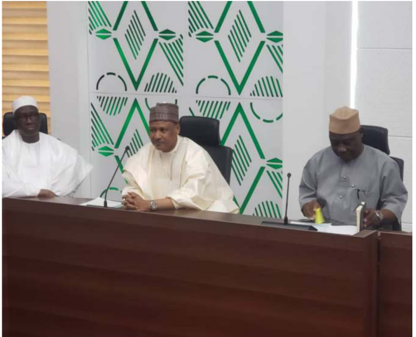
Minister of Information and National Orientation (middle) during the visit to Ibadan.

*Visits Ibadan, commiserates family of late Pa Akinkunmi, Oyo State Government