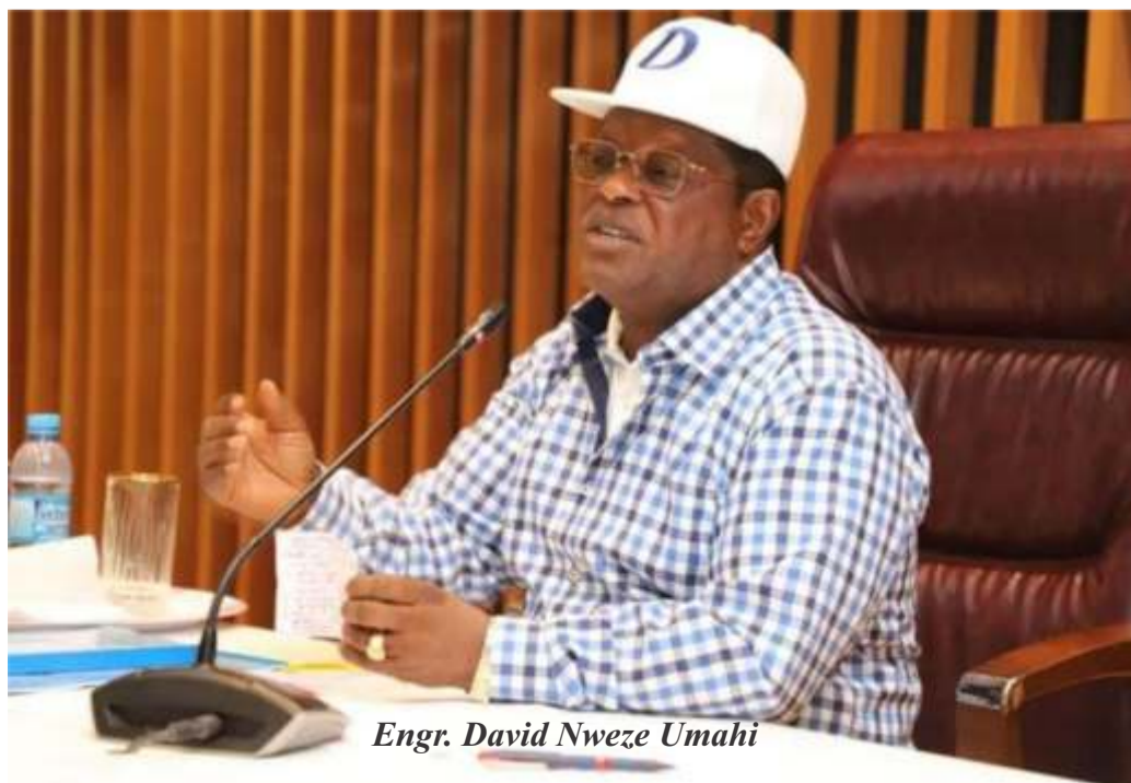
Engr. David Nweze Umahi