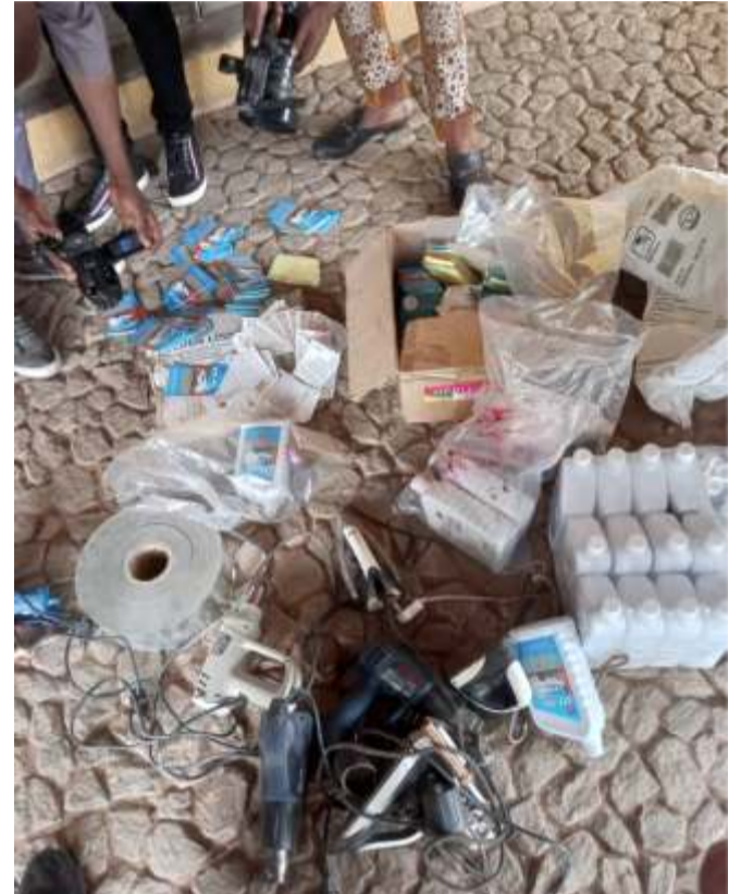
Exhibits recovered from the site suspected to be harbouring adulterated lubricants.

The state commandant then enjoined the people of Oyo State and Nigeria to