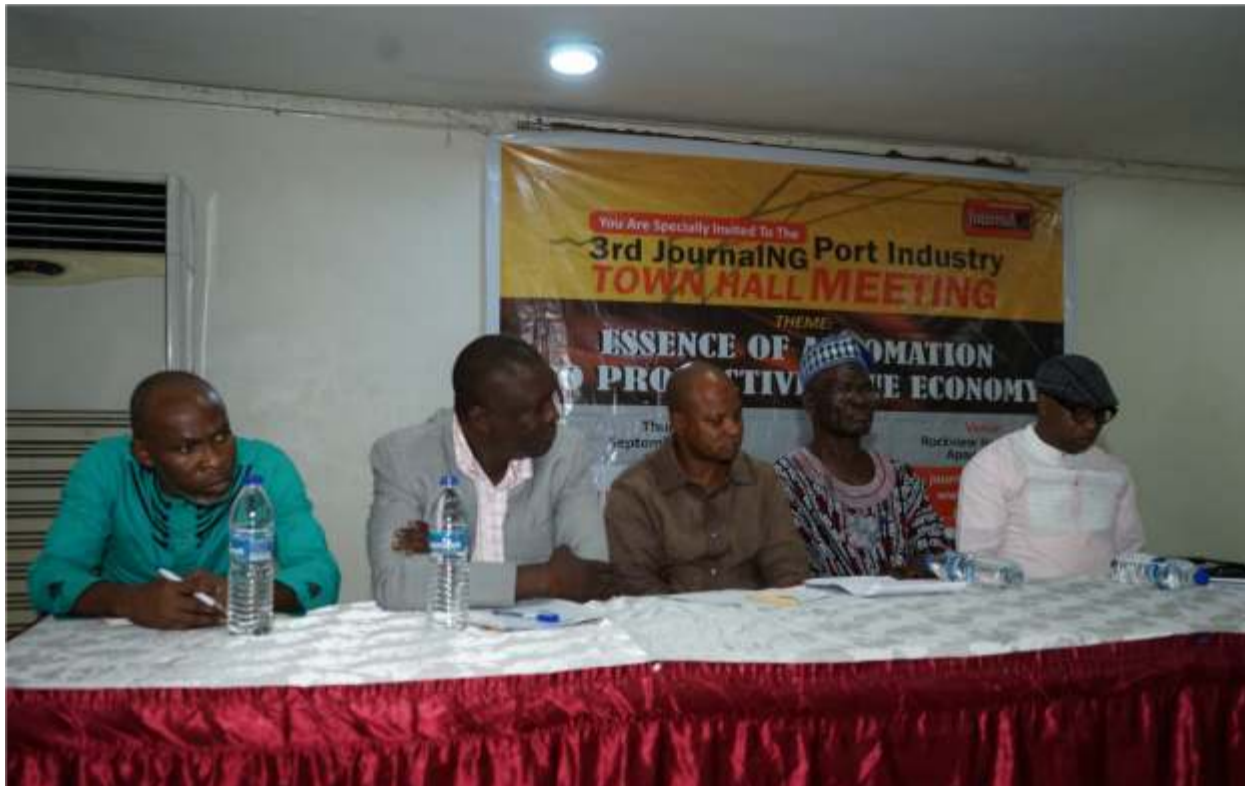
Speakers at the JournalNG stakeholders meeting on Port Automation system.

He added that the PCS is active at Cotonou Port, Cotonou Airport and six land borders of