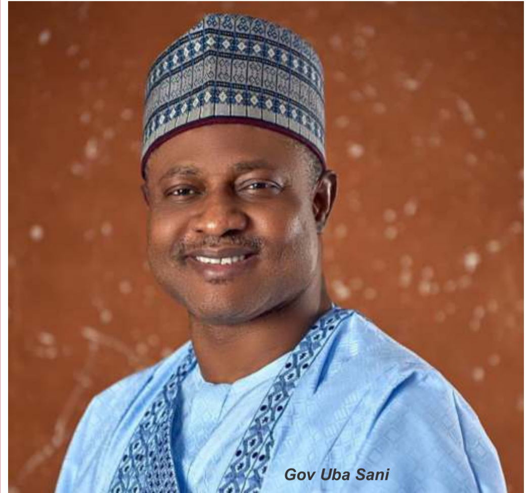
Gov Uba Sani