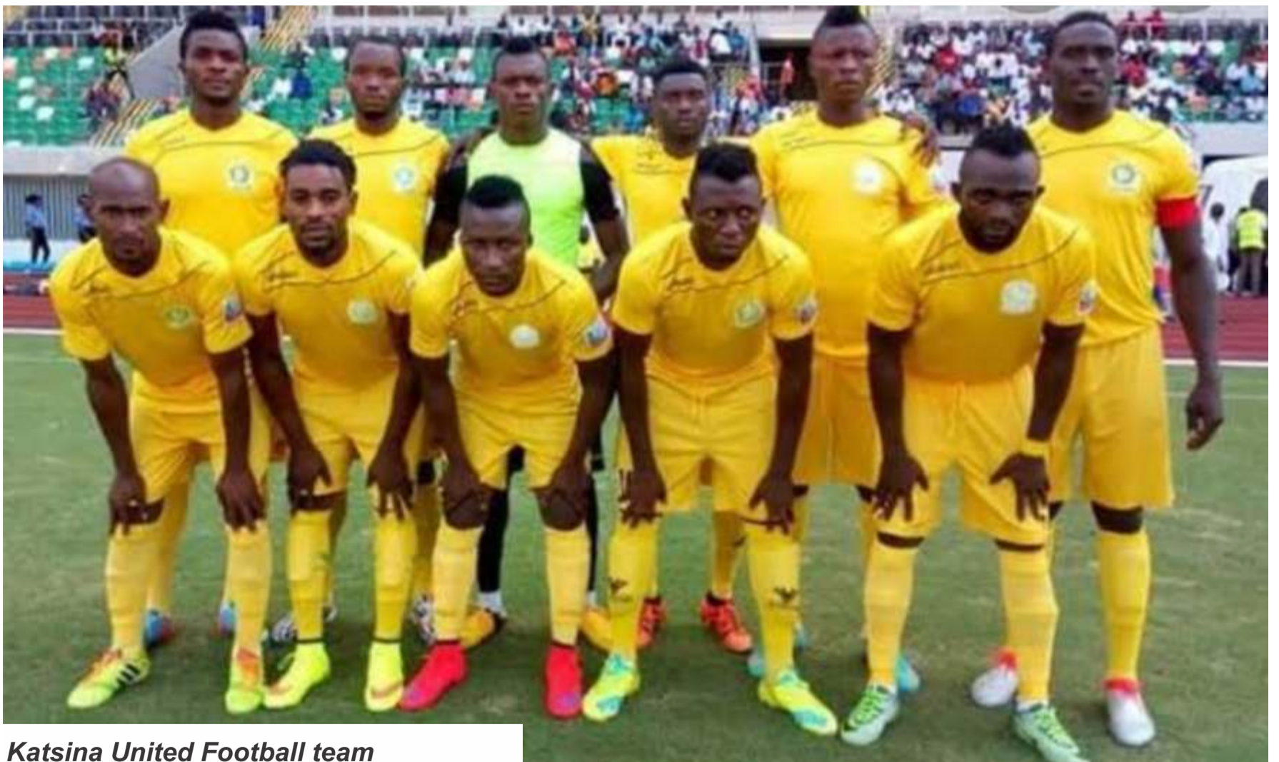
Katsina United Football team

Dikko Radda promised that his administration is more determined to ensure young footballers from Katsina state advanced further to join the most popular football teams in Nigeria and beyond. He said government is up and doing to ensure that