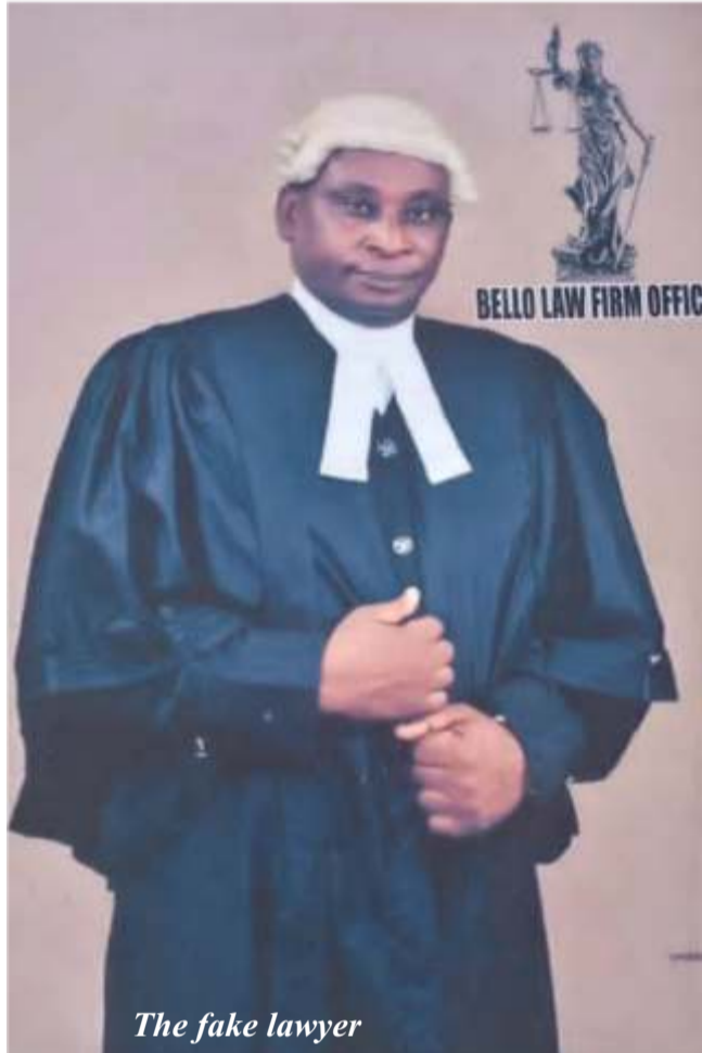
The fake lawyer

"He was brought in for questioning, where he was