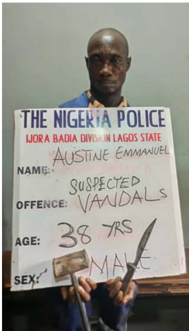
Suspect and recovered operational tools.

As learnt, he confessed to the crime, even as he