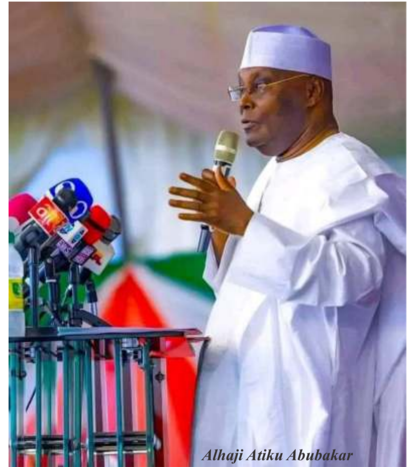
Alhaji Atiku Abubakar

"On this note, I urge all my supporters to remain steadfast. I urge them to take solace in an immortal lesson I learned from