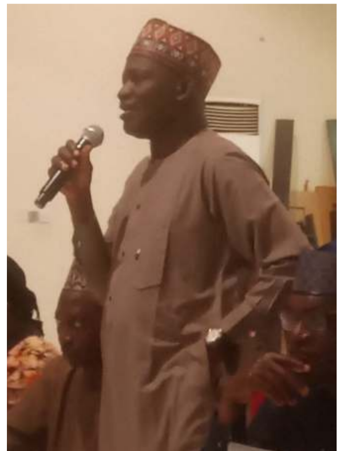
Honourable Yusuf Mugu

Conducting the Governor round, the General Manager, Mohammed Grema noted that all the construction projects were funded with internal revenue generated by Borno Express company.