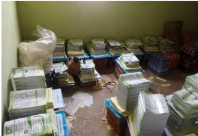
Items distributed by DEFUND

Other speakers include a representative from the state's ministry of education, SUBEB, civil societies, education stakeholders and the representative of the Dawakin Tofa District Head, who called on well meaning citizens to participate fully for the development of education no matter how little it