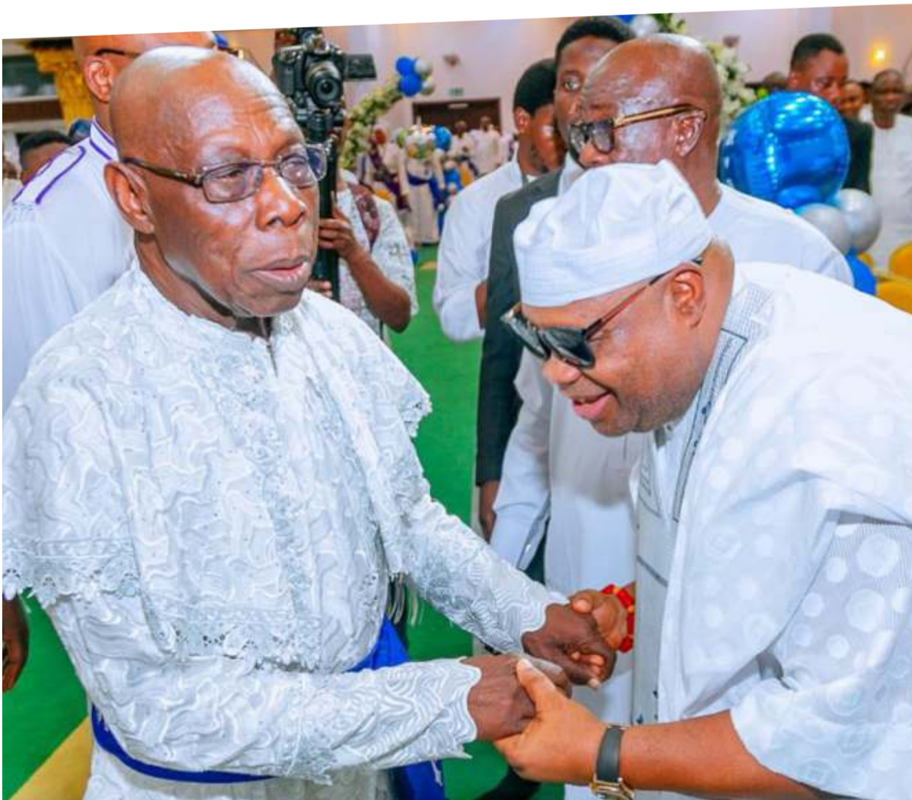
Former President Olusegun Obasanjo and Osun State Governor Senator Ademola Adeleke at the 16th Harvest Anniversary and Thanksgiving Service of Love Christ Generation Church at Victoria Island, Lagos on Sunday.

He assured that such engagements with those in authority would go a long towards providing a good platform for people to air their views with what they are passing through and the best way to amicably resolve areas of concern.