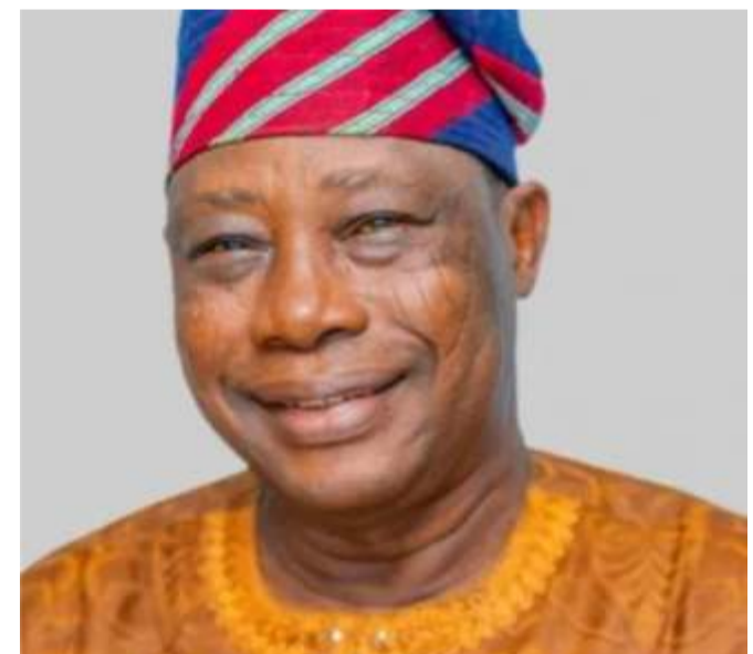
Oyo State Deputy Governor Barrister Bayo Lawal

Projects such as the Saki-Ogboro-Igboho Road