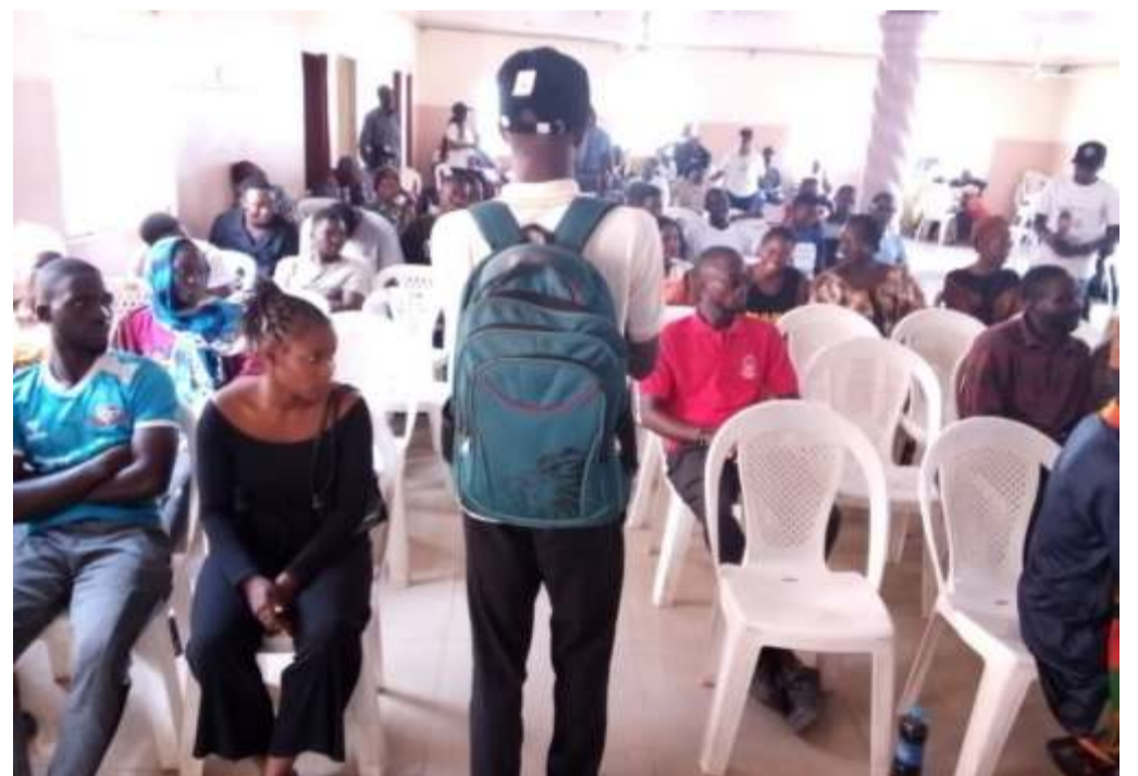
Kantin Agah, Black Street youths with Think Tank group in an interactive session in Kaduna.