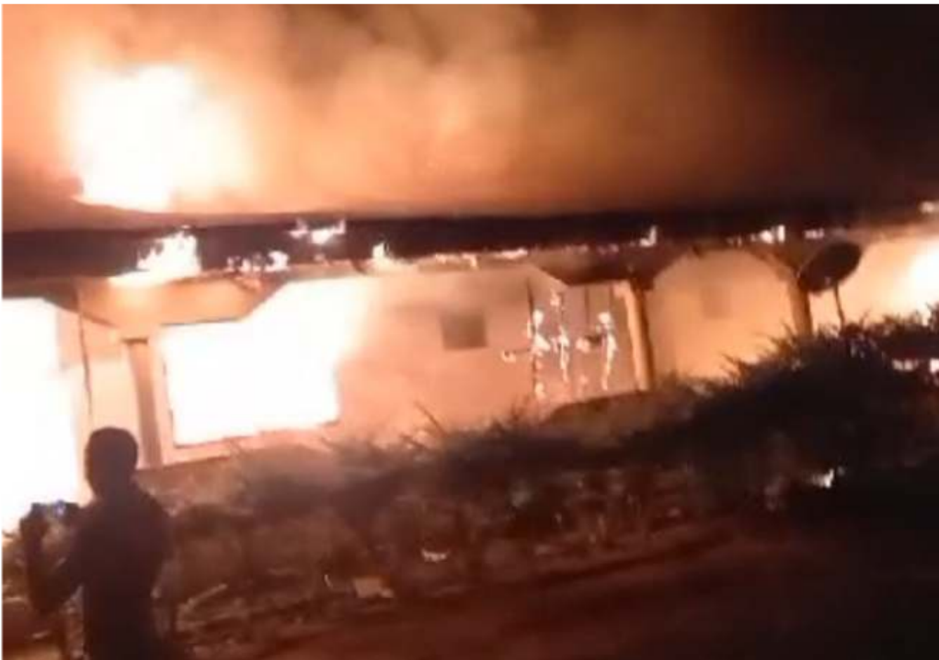
The Church as it was burning