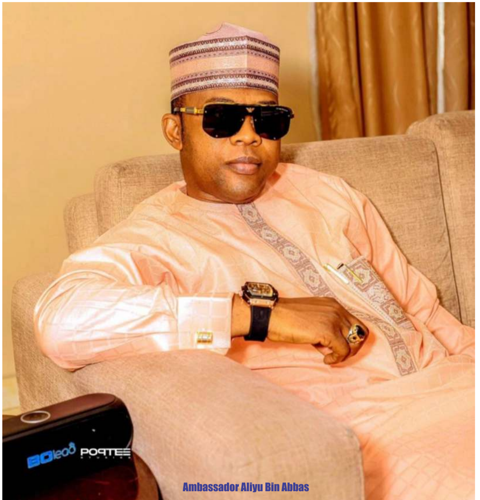
Ambassador Aliyu Bin Abbas

The institutions that should serve as the pillars of a functioning democracy have crumbled under the weight of corruption and incompetence. The Independent National Electoral Commission (INEC) and the Electoral Tribunal, once symbols of hope, have revealed their absolute partiality to the status quo. The facade of free and fair elections has been torn asunder, exposing the deep rot within the Nigerian political system.