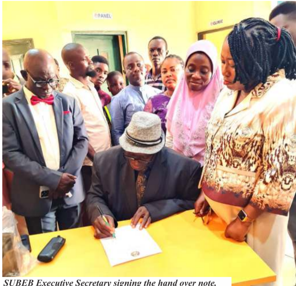
SUBEB Executive Secretary signing the hand over note.

"Equally, we appreciate Governor Seyi Makinde in the implementation of qualitative basic education in the State. The visit was meant to assess the level of the project in readiness for the next session"