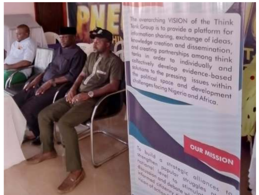
Kantin Agah, Black Street youths with Think Tank group in an interactive session in Kaduna.