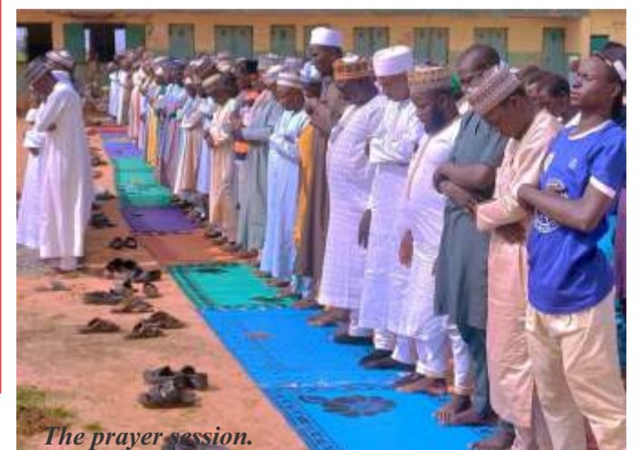
The prayer session.