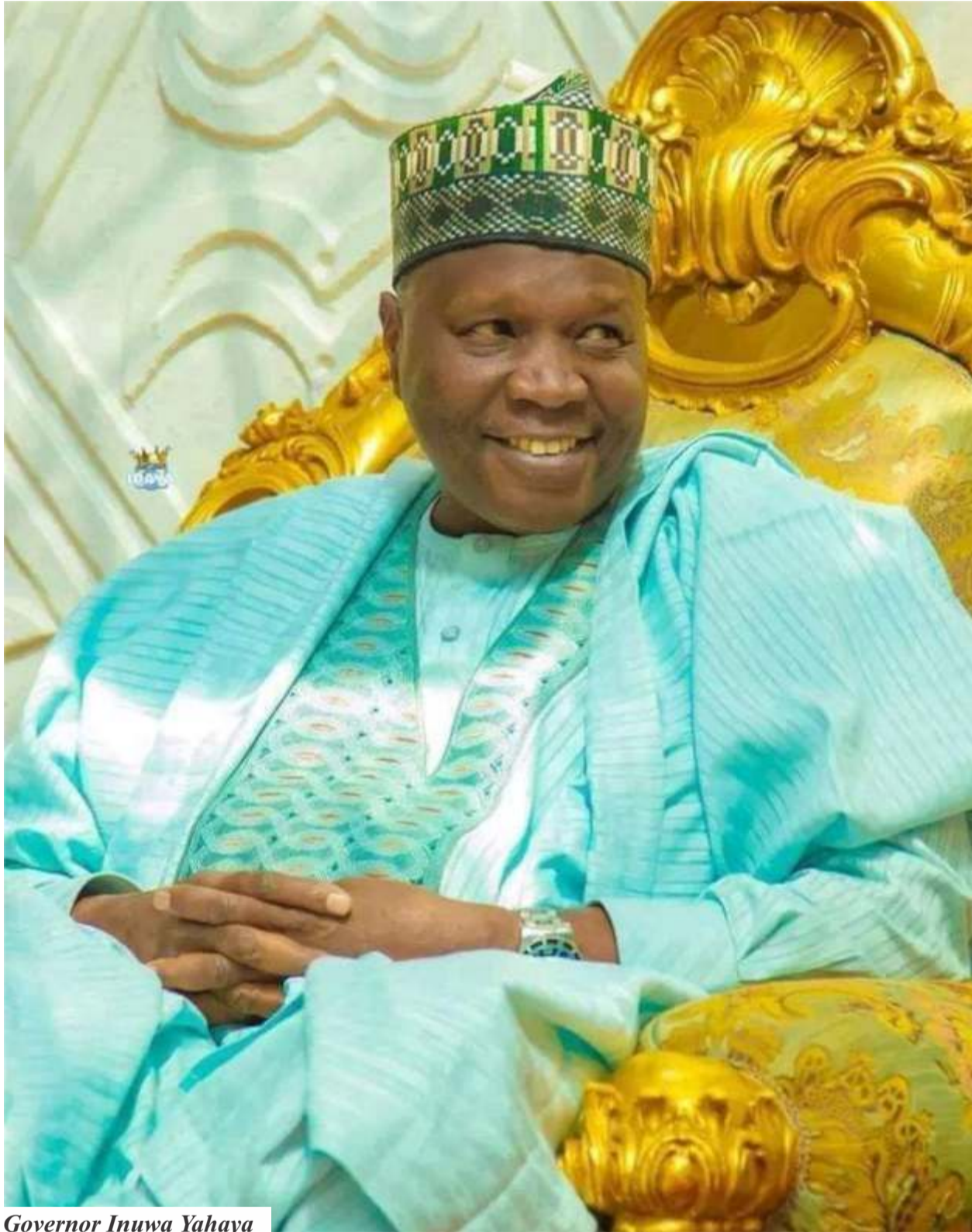
Governor Inuwa Yahaya

Another notable initiative that was reeled out by the progressive governor in the 100 days under review, was the establishment of a Special Honorary Advisory Committee (SHAC), with appointment of some seasoned technocrats and well-accomplished experts and professionals in various fields to guide the implementation of his government's developmental policies and programs in his avowed commitment to turn challenges into opportunities and provide effective solutions to the problems facing the state. According to the governor, the plan was for the team to hit the