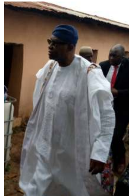
Prince Afolabi Ghandi Olaoye arriving venue of installation.

Others restrained by the court with Governor Makinde are the Attorney General and the Commissioner of Local