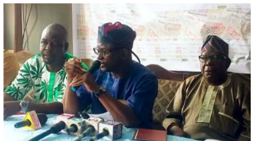
OYSIEC Chairman (middle) speaking at the programme.

that the commission will next week commence screening of candidates to be presented for the election by the political participating in the election and that politicians in the state should be ready to cooperate with the commission in the conduct of the election.