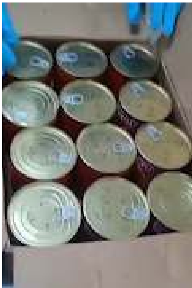
Pack of the tomato paste, intercepted by NDLEA where substance was hidden.