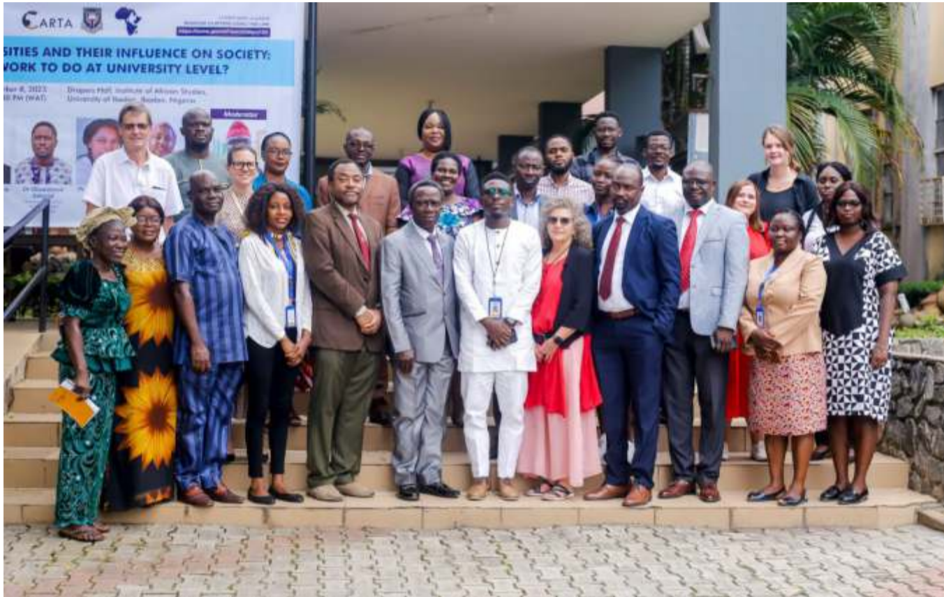
CARTA Dons in a group photograph

*Call for policy to formalise informal caregivers, spends $3.6m to train 36 UI staff