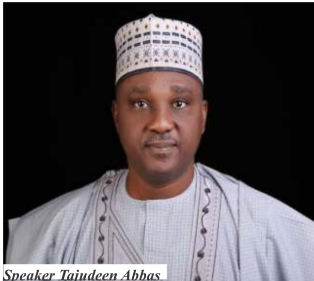
Speaker Tajudeen Abbas

urged the relevant authorities to consider a review of the operational standards, while seeking strict adherence to all safety measures by both the boat operators and the passengers.