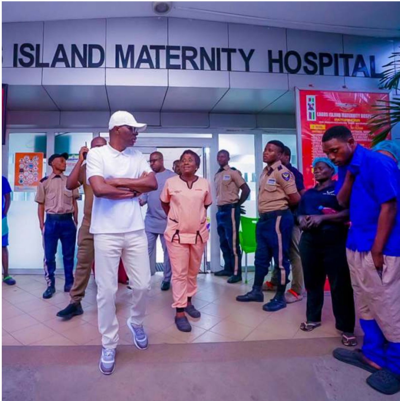
Governor Babajide Sanwo-Olu during the visit to Island Maternity