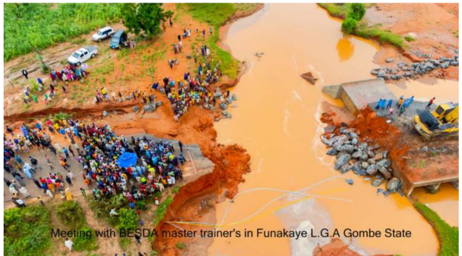
Meeting with BESDA master trainer's in Funakaye L.G.A Gombe State