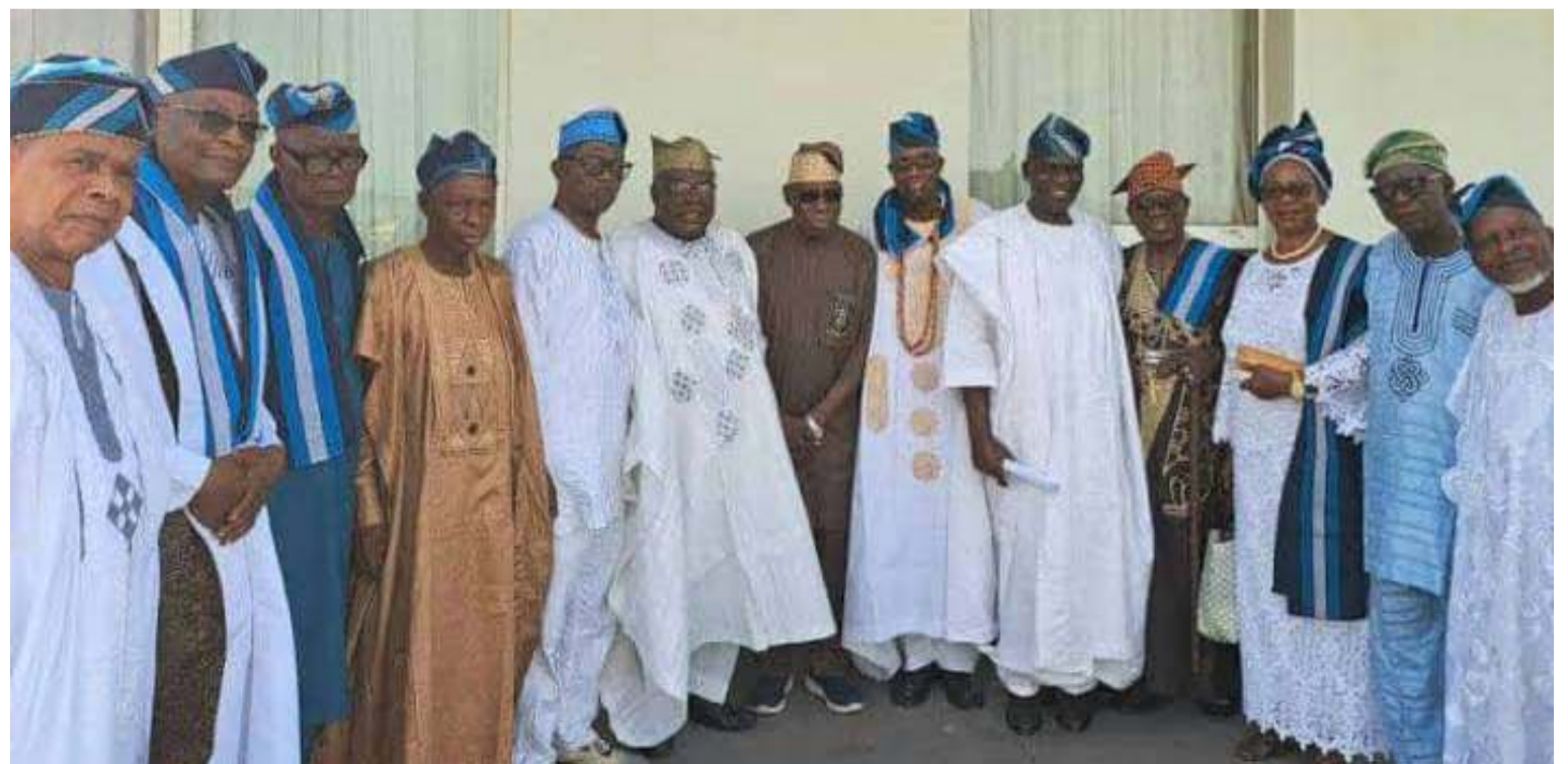
Yoruba Council of Elders in a group photograph after their meeting in Ibadan.

addressed with high level diplomatic measures to forestall any action which may escalate into a situation of a war that may consume the West Coast of Africa," the group said.