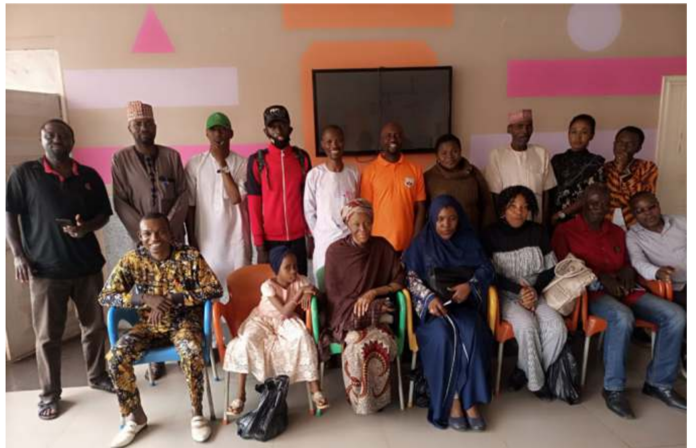
Members of NPJ

Similarly, the Network of Peace Journalists calls for a peaceful protest to be held across all 36 states of Nigeria, while simultaneously urging the government to open channels for constructive dialogue to find a viable resolution to the prevailing situation.