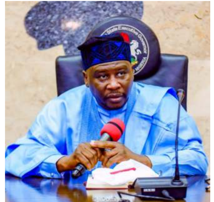
Gov Umaru Fintiri