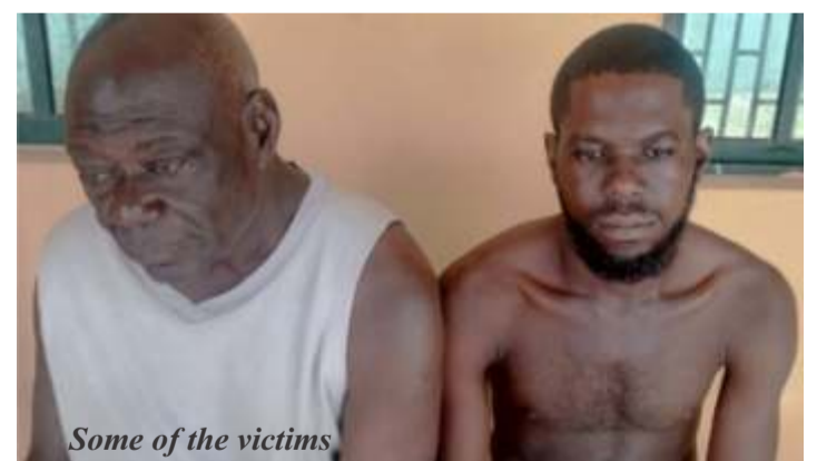
Some of the victims

every night before we sleep. Initially they demanded for N50 million but we paid N2.2 million as ransom before they could released us.