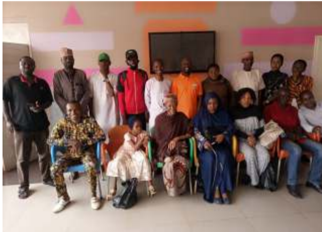
Members of NPJ

Katsina Gov Orders Each LGA To Distribute 36,100 Bags Of Maize To Cushion Hardship