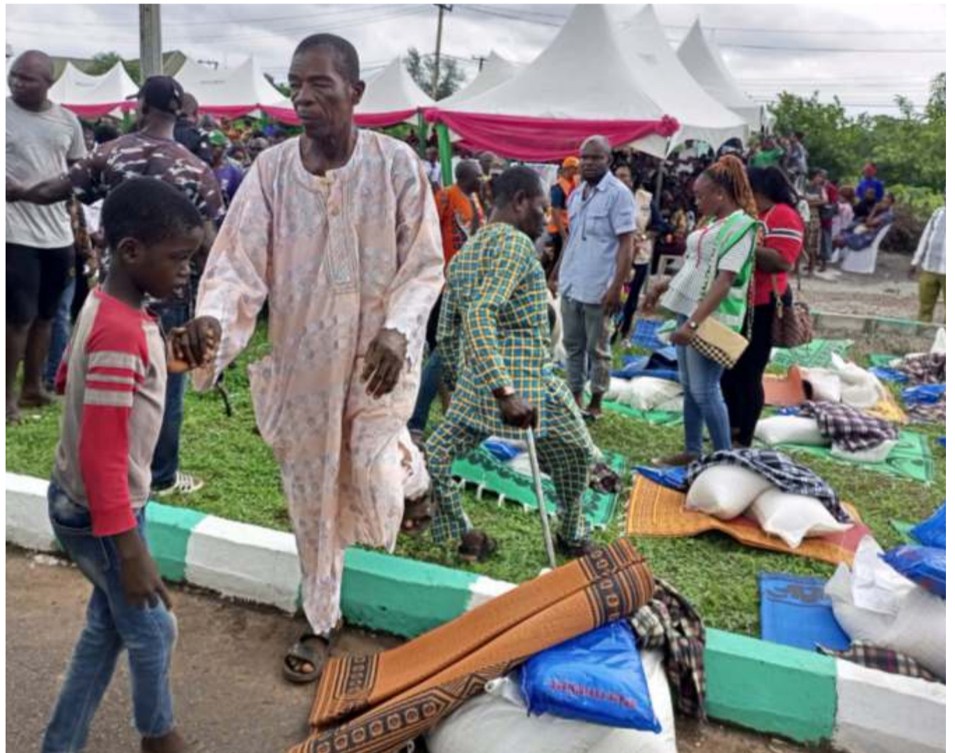
In Ebonyi Over 1,200 Victims Of Flood Disaster Receive NEMA Relief Materials, Story on Page 4

IHR however advised that the challenges of poor services experienced in 2023 Hajj must be reviewed and addressed with a view to avoiding similar unfair experiences. "The only way to avoid the challenges encountered, particularly in Mashaer, is to quickly and logically begin preparations for 2024 Hajj in line with the newly released Calendar of events by the Kingdom of Saudi Arabia. "Sentiments and self-interest should take a back seat in the planning of 2024 Hajj," the statement said.