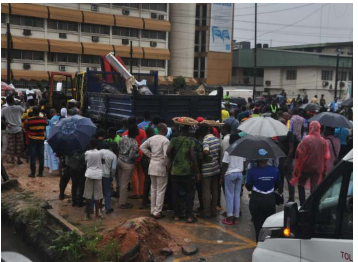
Scene of a helicopter crash at Oba Akran in Lagos yesterday, August 1, 2023.

Kadpoly Mass Comm Alumni Congratulates New Nigerian Editor, Others Over Recent Appointments