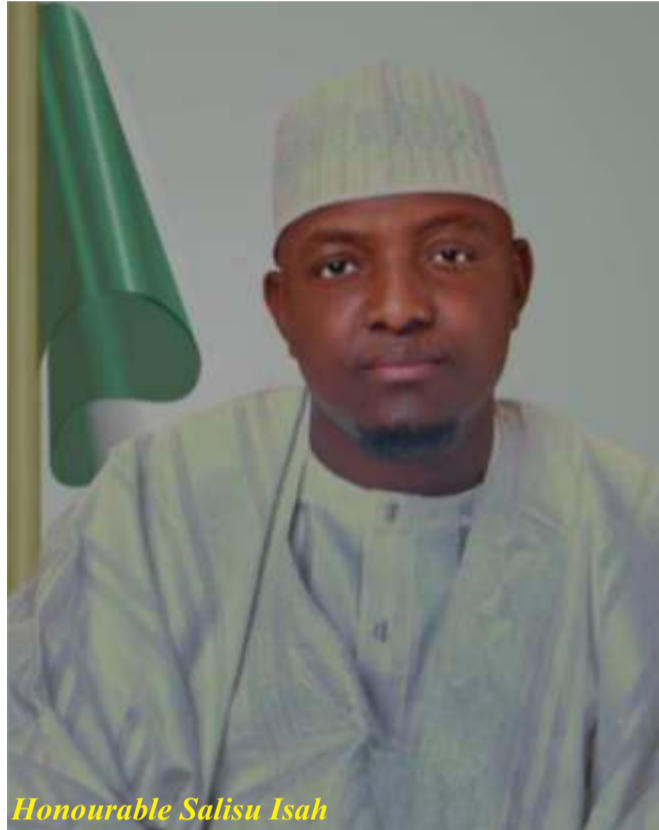
Honourable Salisu Isah

"His appointment to Birnin - Gwari would not only create a viable platform for social engagement, security networking and economic progress, but will generate effective opportunities for the people to access the benefits of Malam Uba Sani's policies to Birnin