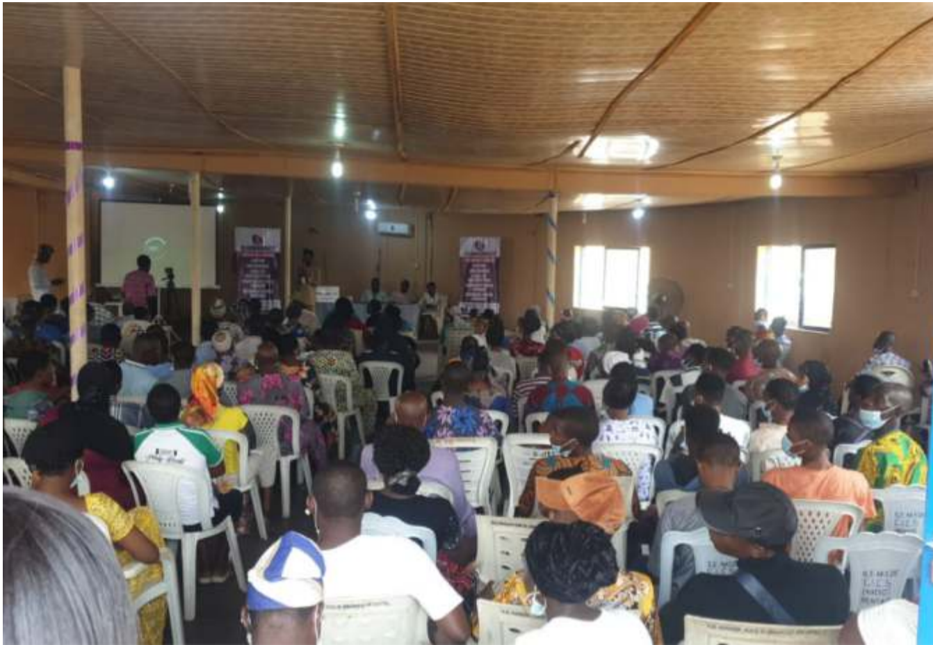
Some participants at the seminar