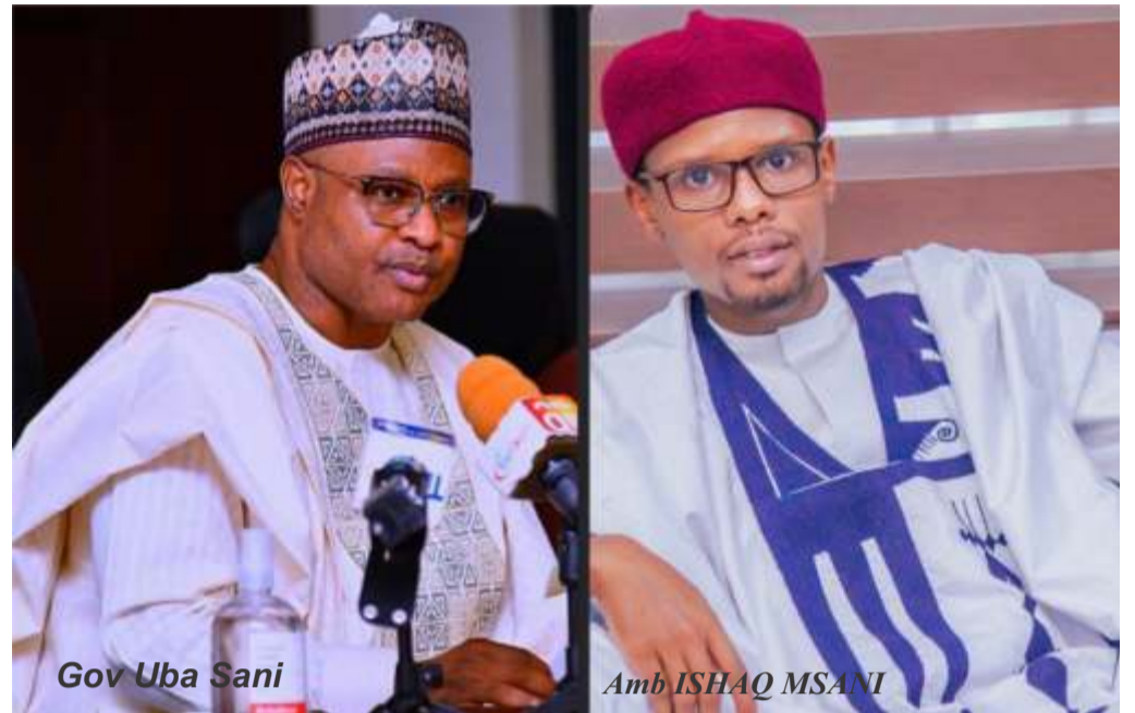
Gov Uba Sani

This implies the government patronizing local suppliers and contractors. State fund thus ought to revolves within the local economy, deepening state growth and ensuring local economy expansion. Infrastructure gaps can be addressed