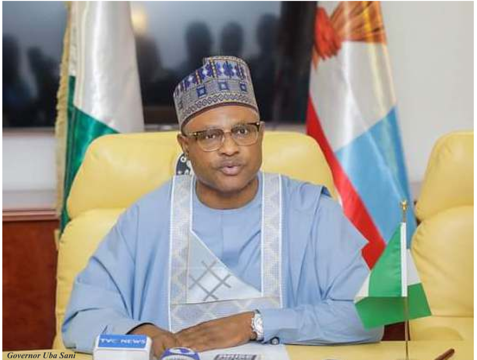
Governor Uba Sani

"We have agreed and decided collectively with a support of all the trade union to buy 43 thousand bags of 50kg rice, which translates to one billion, nine hundred and thirty five million Naira, that is from the two billion given to us by the federal government, Kaduna