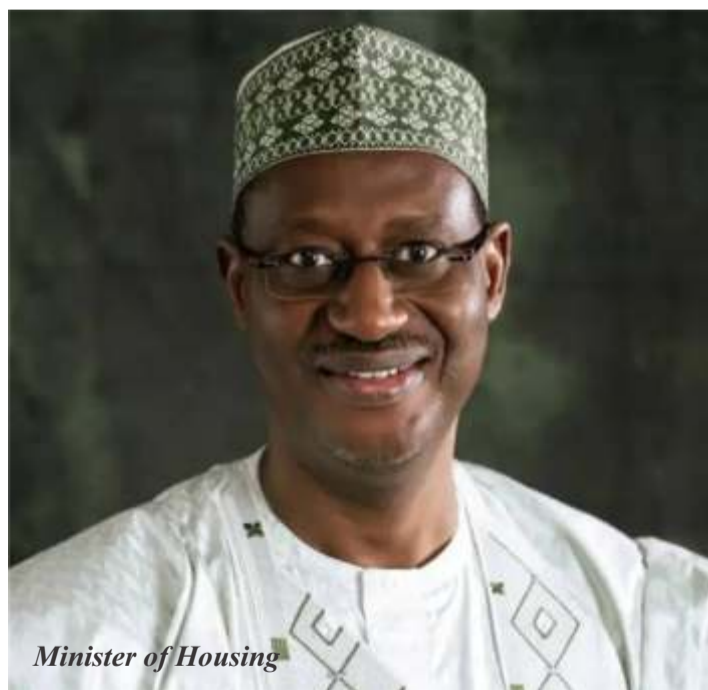
Minister of Housing

According to him, ANTs emphasizes the pivotal role that affordable housing plays in fostering economic stability, social inclusion, and overall national development, saying; that in light of this, they look forward to the Minister's strategic vision and innovative policies