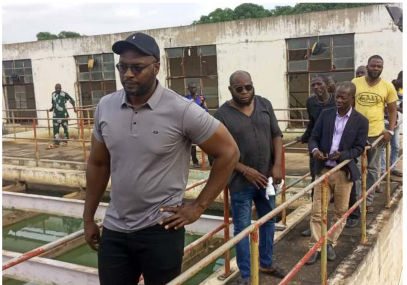
Hon Adejo during the tour

Recall that Governor Godwin Obaseki had, in 2018, sought and obtained, a posthumous Presidential Pardon for late Governor Ambrose Alli; a request that was ratified by the Council of State in 2020.