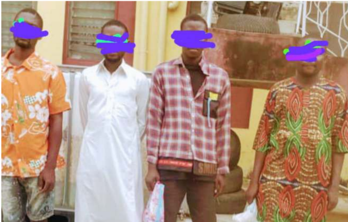
The freed inmates