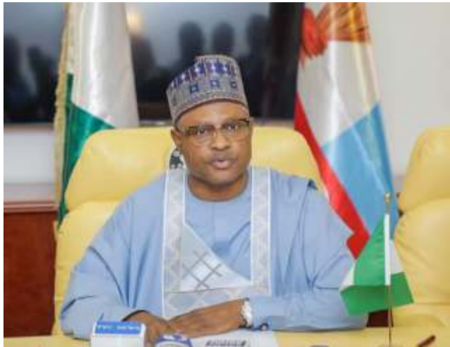
Gov Uba Sani

Over 1m Individuals From 210,000 Households Will Benefit Kaduna Palliatives - Uba Sani