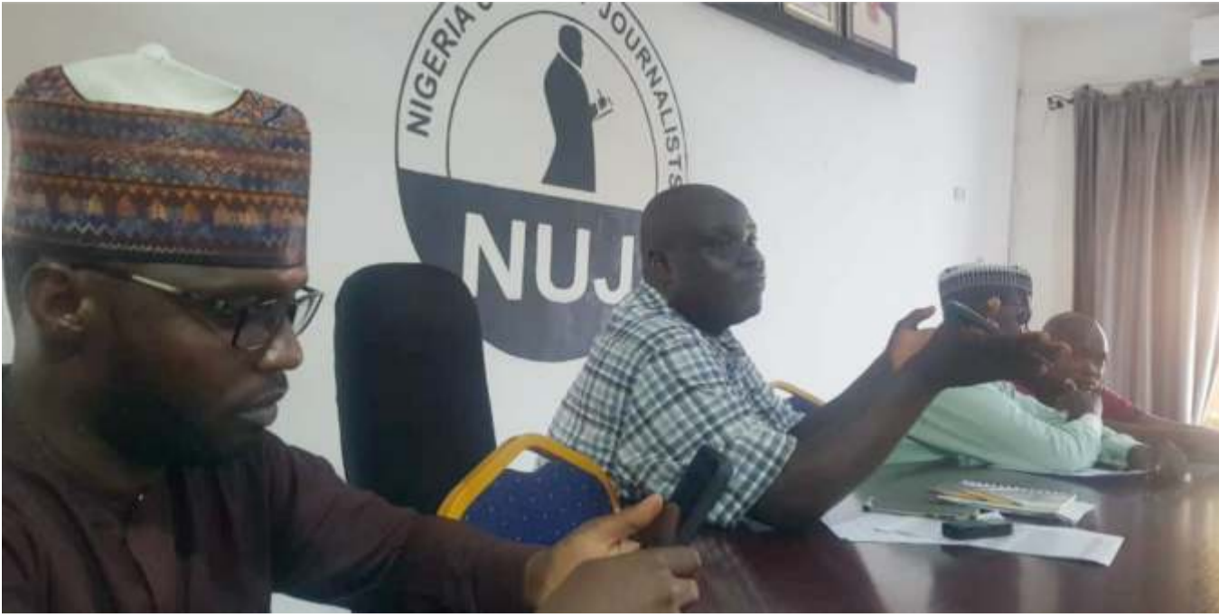
The youth coalition during the press briefing yesterday.