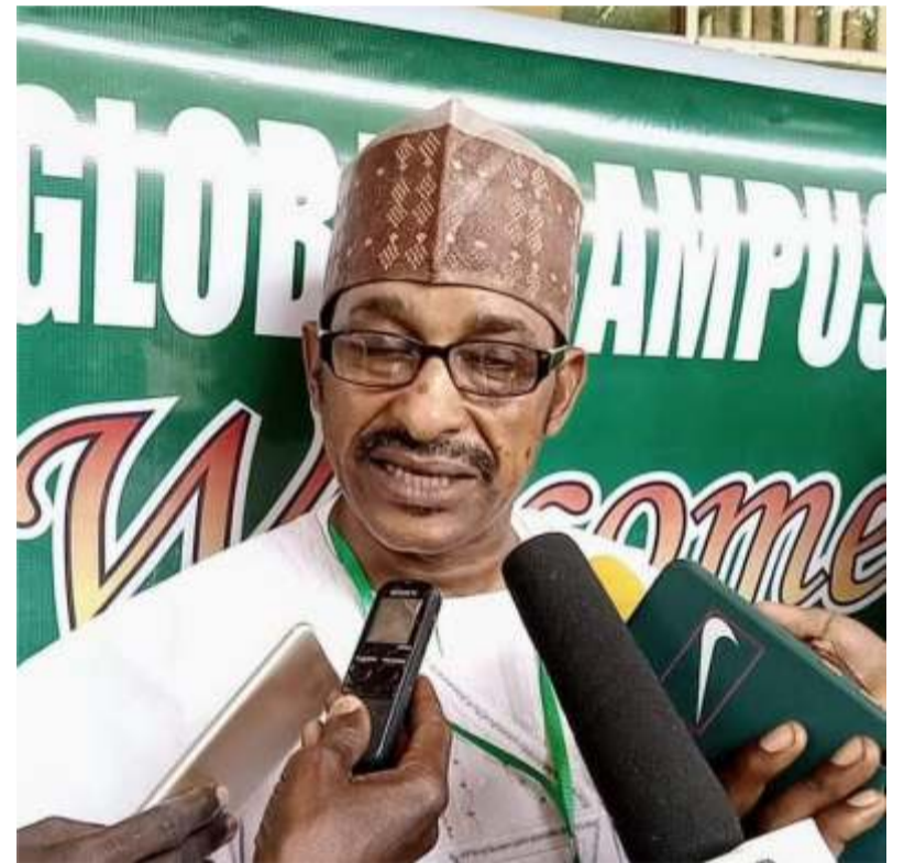
Kaduna ADC Chairman