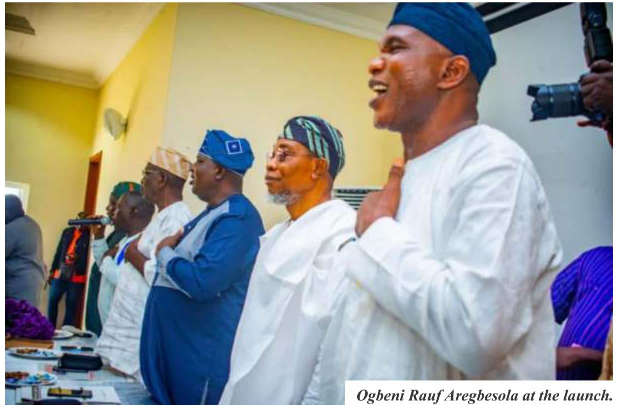
Ogbeni Rauf Aregbesola at the launch.

According to him, members of the Omoluabi caucus were drawn from each of the 332 wards in the state and were represented by five members from each of the local governments in the state.