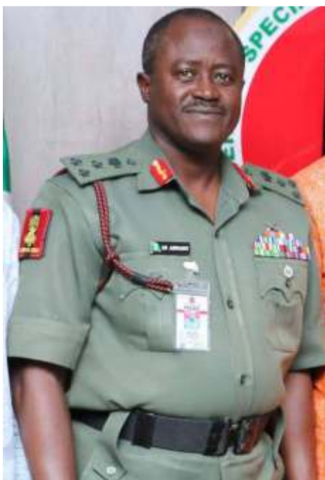
Brig. Gen. Ibrahim Ahmadu

announced reduction in the state owned tertiary institutions fees ranging from 30 to 50 per cent downward review in various state institutions.