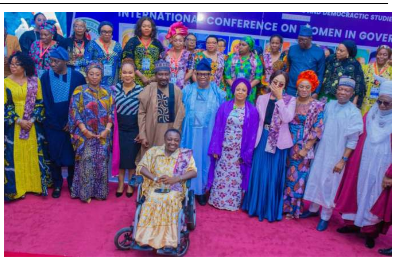
Senator Akpabio with Women leaders at the Conference

"The bitumen and other materials were of low quality and not suitable for roads in this part of the World with consistent climate of wet and dry seasons," he explained.