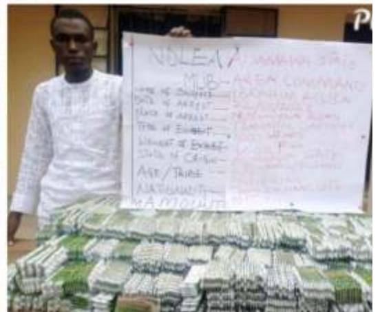
Exhibits recovered by NDLEA from the suspects

"According to Dr Akibu, prevention is better than cure, hence the need for cattle breeders to always engage the service of veterinary doctors to keep their animals healthy and safe for consumption."