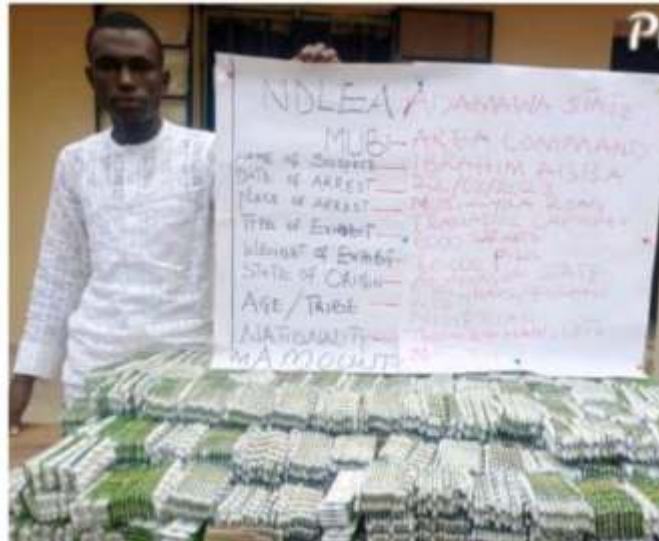
Exhibits recovered by NDLEA from the suspects