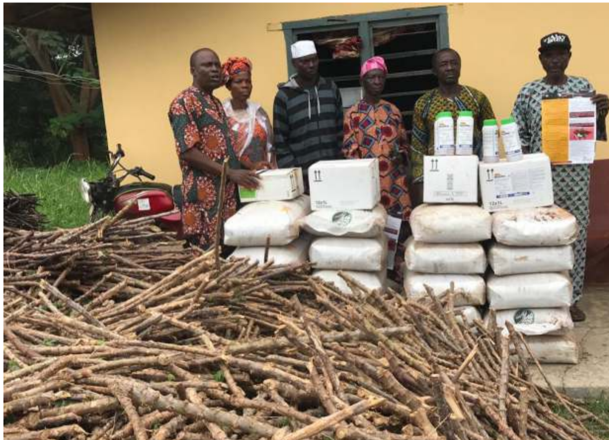
Some beneficiaries with items received.

Mr Bamigbola maintained that "all these beneficiaries comprises of casava farmers, maize farmers, rice and tomatoes farmers", and that the state sponsored Youth