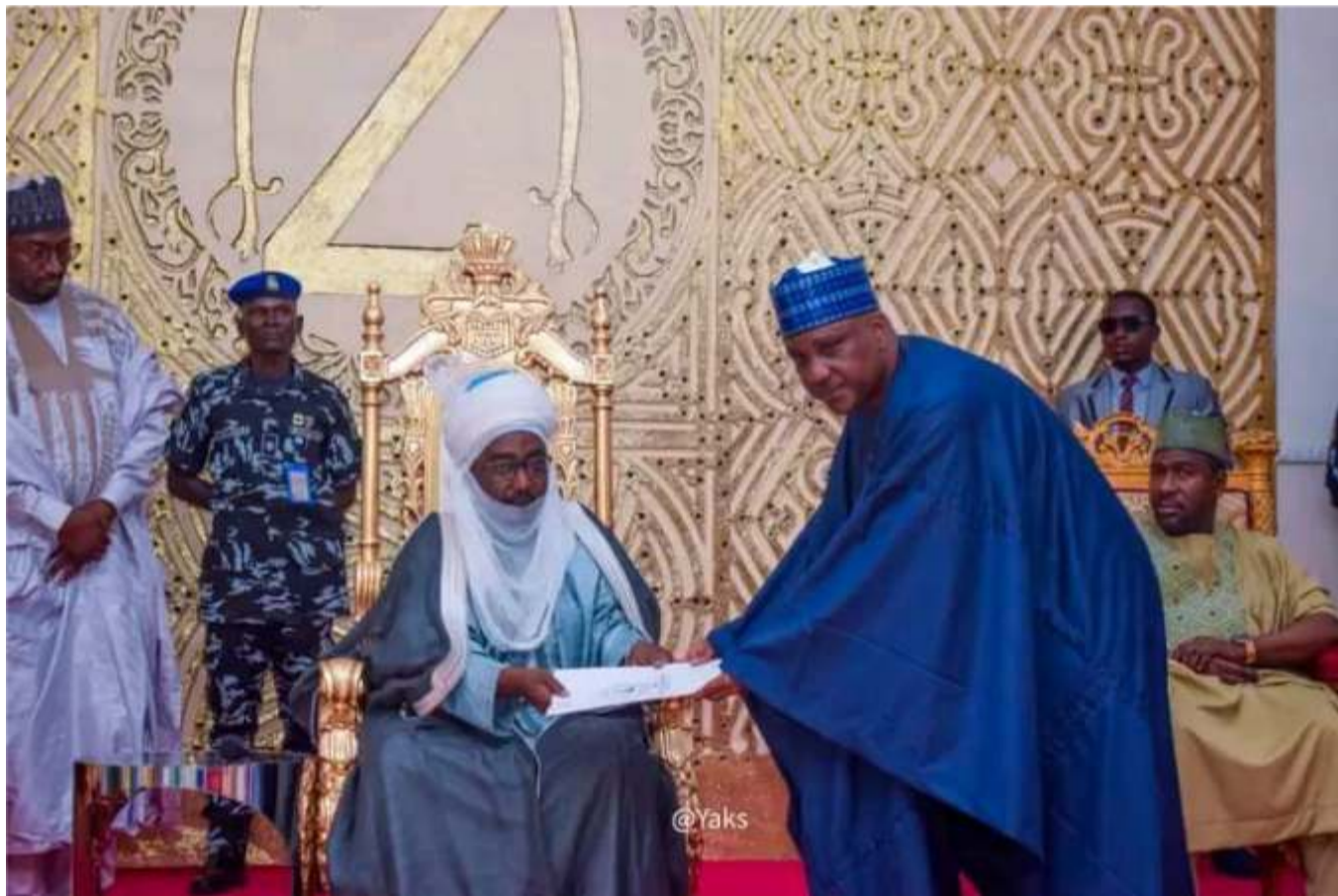
Speaker, House of Representatives, Abbas Tajudeen, during a condolence visit to the Emir of Zazzau, Malam Ahmed Nuhu Bamalli at his palace in Zaria recently.

Highlights of the visit were donations for the renovation of the mosque from some of the principal officers and members of the National Assembly, who accompanied the Speaker.