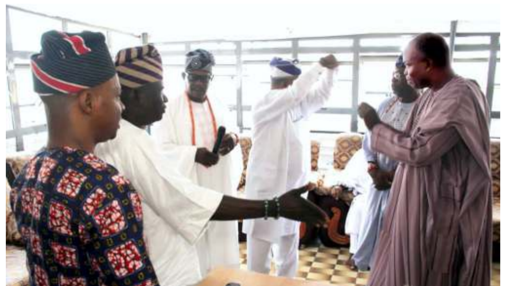
The suspended Mogaji with others at the Olubadan in Council meeting on Friday.