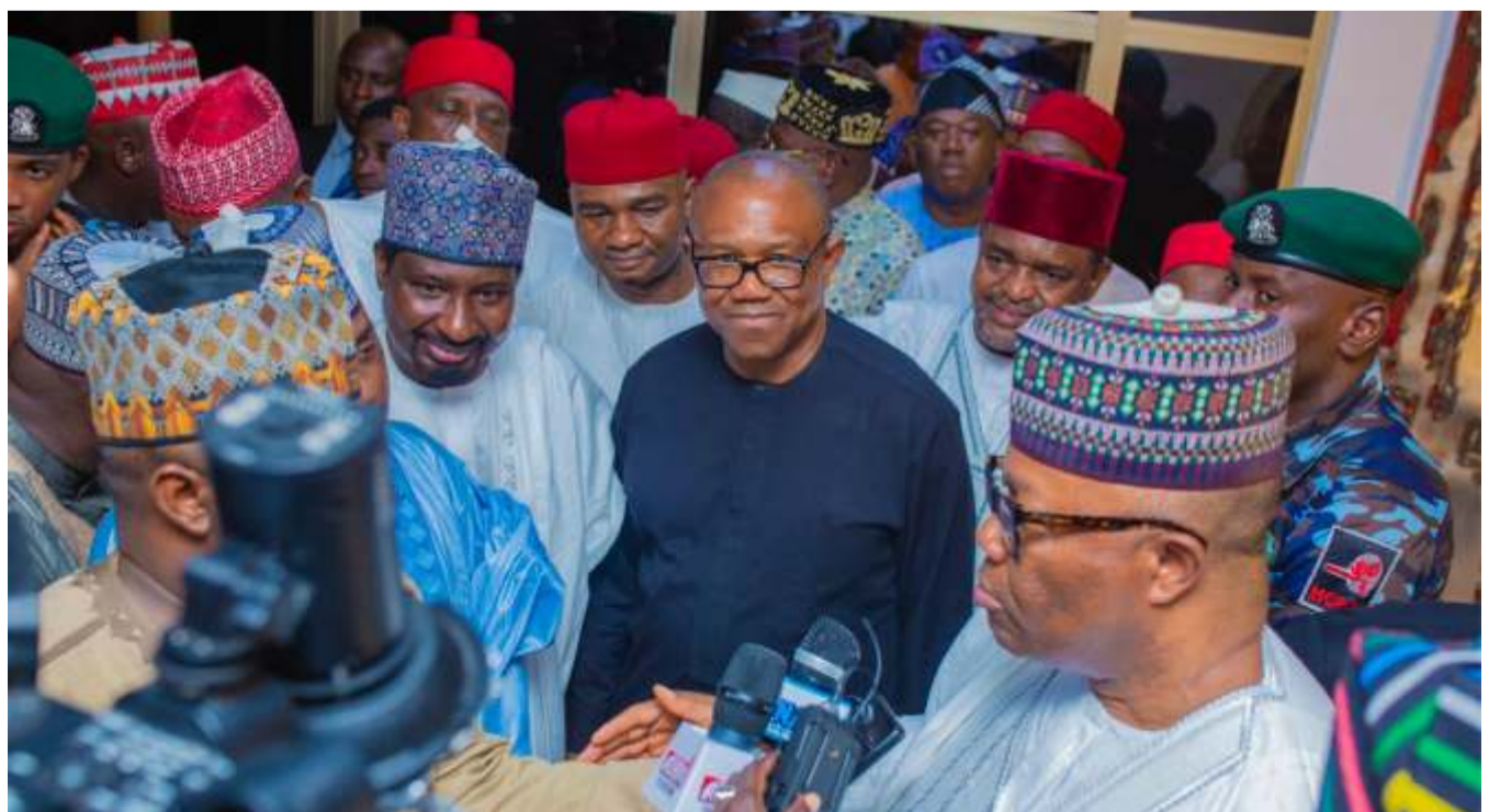
Senator Akpabio at the wedding ceremony on Friday

Commander for the visit and commended her for the critical roles the EFCC is playing to combat illegal mining activities and cybercrime in the state.