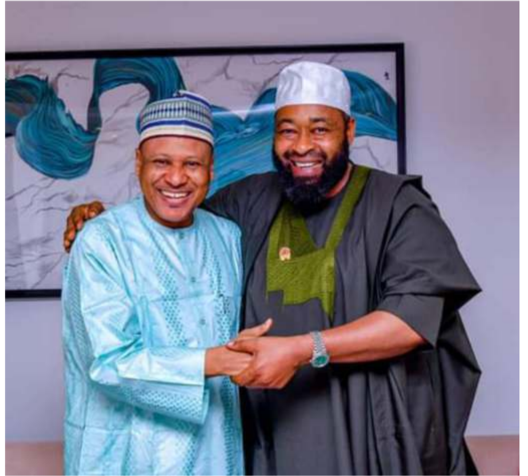
L-R: Minister of Information and National Orientation, Alhaji Mohammed Idris Malagi, Fnipr, during a visit to Niger State Governor, His Excellency, Umar Bago.