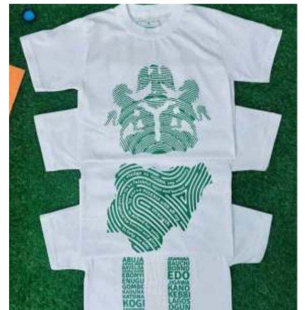
T-shirts being given out by Arewatees

"Some persons have given up on Nigeria already but we are trying to use this medium to let them know that they have a beautiful country. No matter the challenges we have, if we can come together, unite and understand ourselves we can be able to reverse the situation for the common good of all.