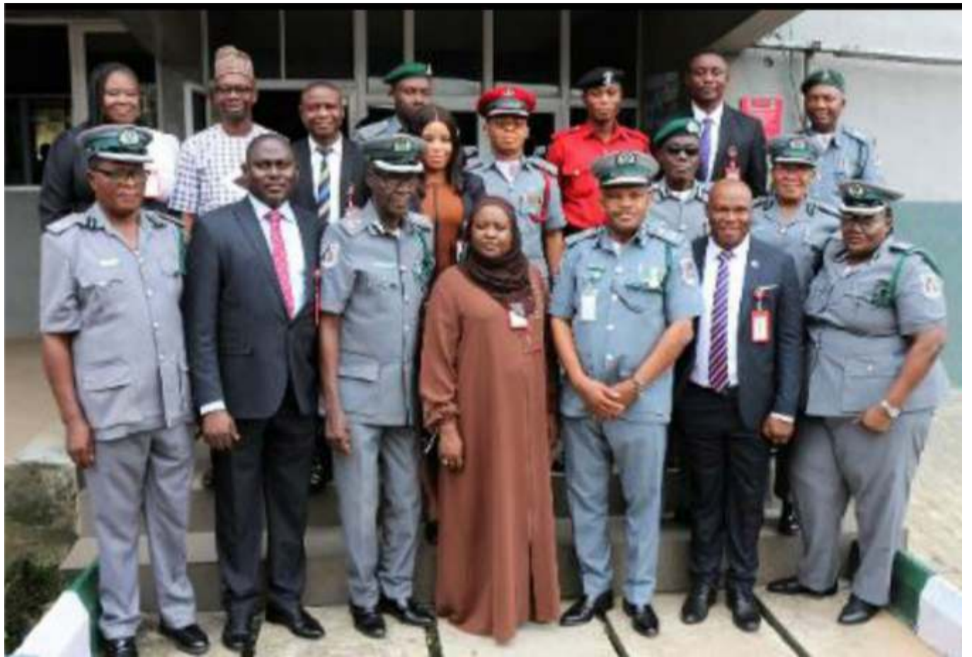
Acting Zonal Commander EFCC, Ibadan, ACE I Halima Mustafa Rufa'u during the visit.