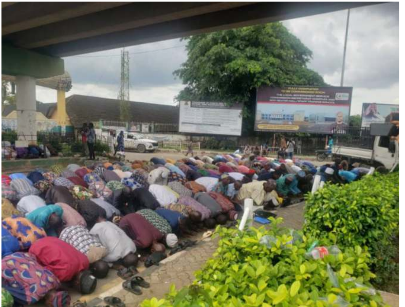
Protesting Oyo workers observing Jum'at prayer at the frontage of Government Secretariat in Ibadan