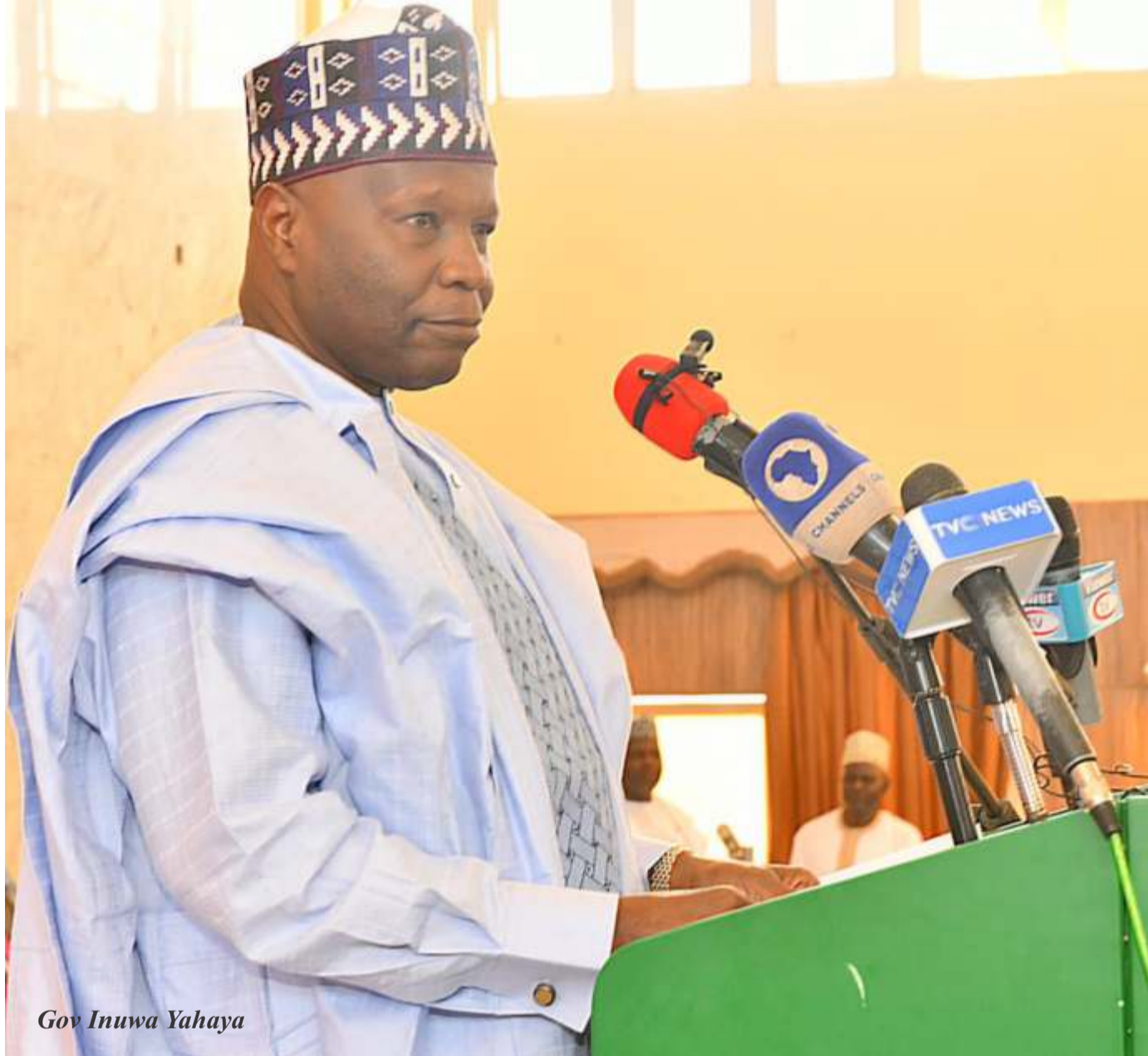
Gov Inuwa Yahaya

Late President Yar'Adua was also of the same brand and pedigree. He came up with the agenda of addressing the problems triggered by the agitations of the