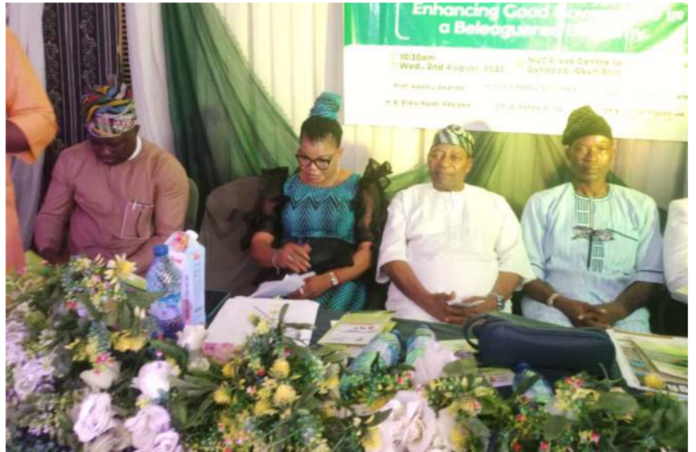
Dignitaries at the NUJ Zone B lecture