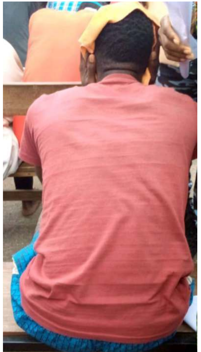
Back view of the car hirer driver