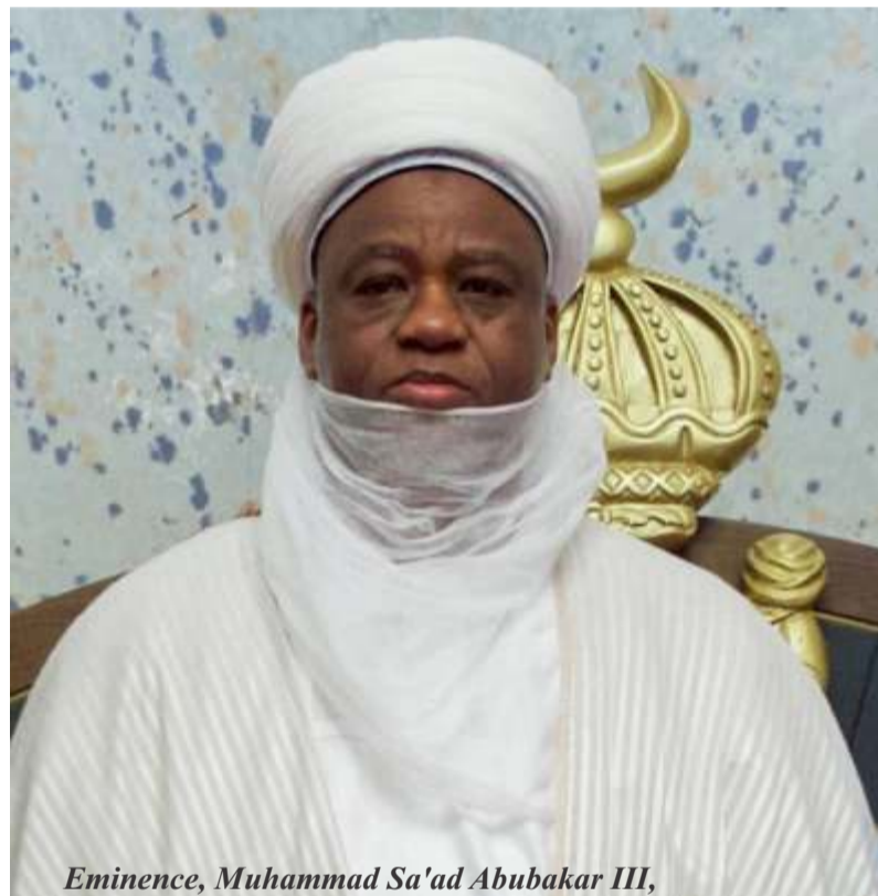
Eminence, Muhammad Sa'ad Abubakar III,

The Northern Governors' Forum Chairman urged