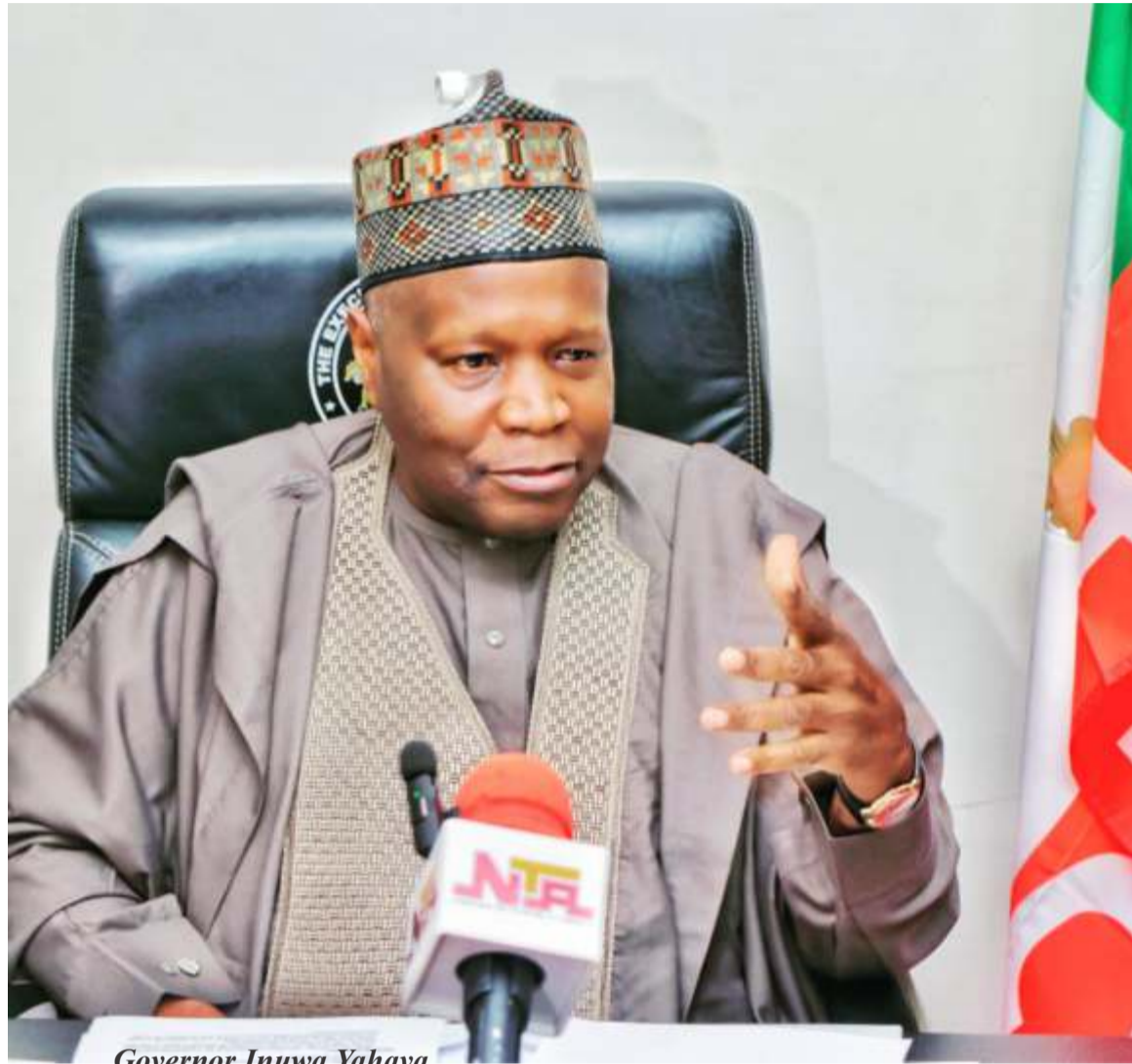
Governor Inuwa Yahaya

In agriculture, the mainstay of Northern Nigeria, the farmer- herder clashes is another area the region stands to benefit a