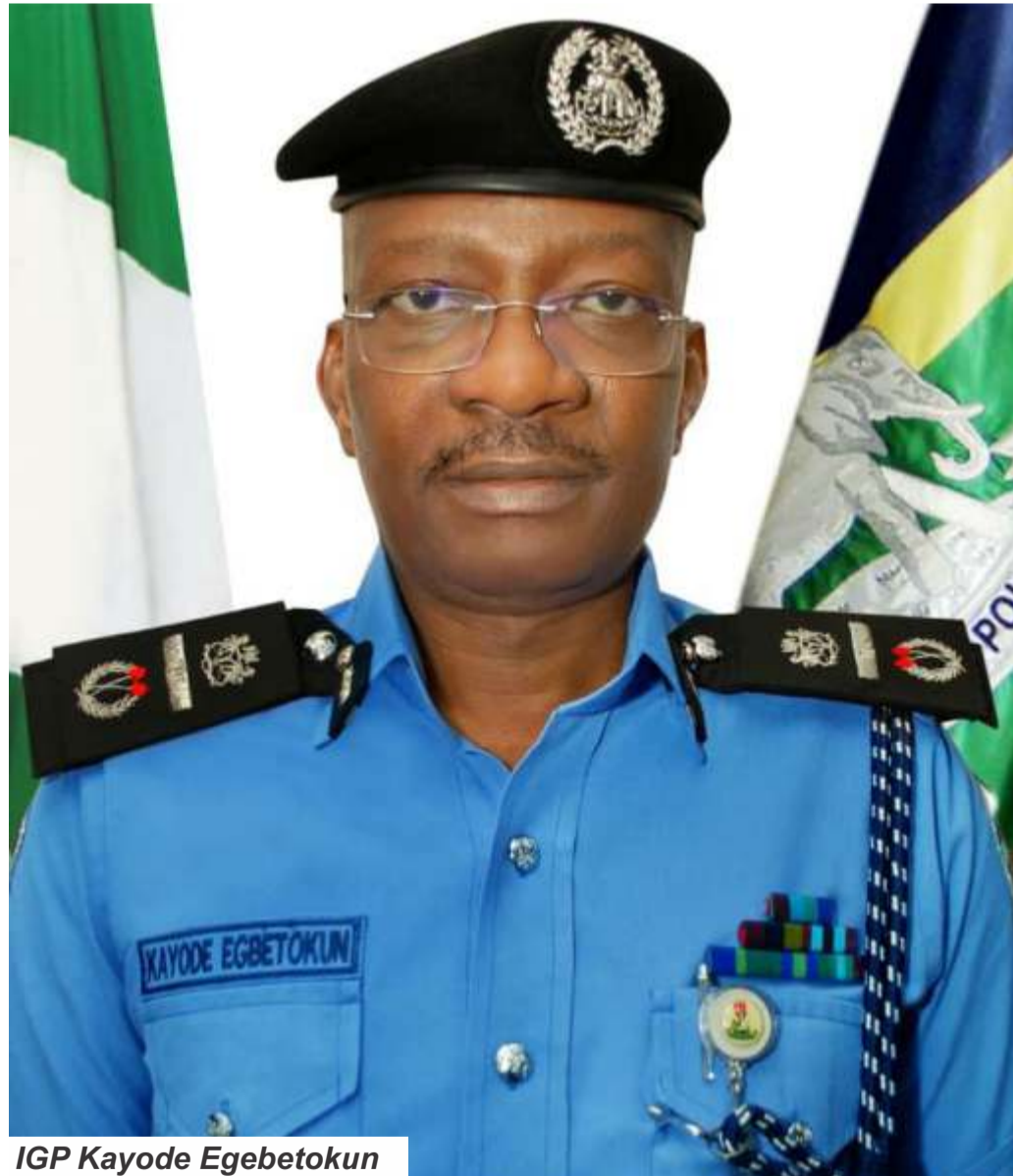
IGP Kayode Egbetokun

His words "The unit would promote accountability and