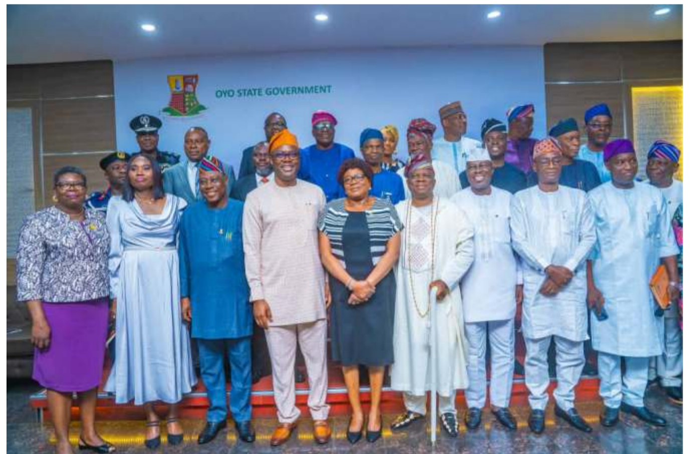
Gov Makinde with the 12-man Amotekun Board.