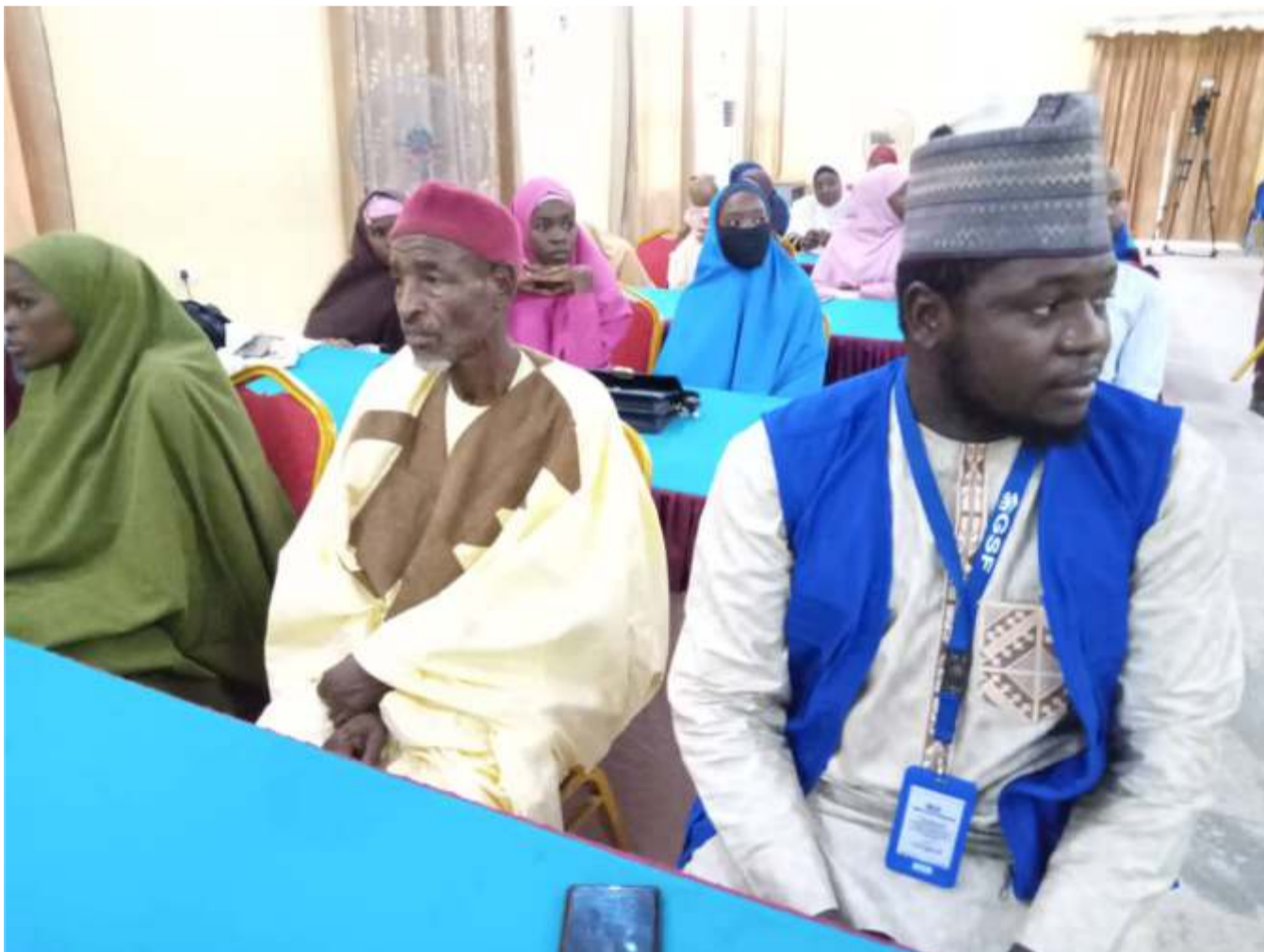
Programme Officer, Grow Strong Foundation and participants at a training Damaturu

their capacity as well as identifying the vulnerable children that might have left school following the Boko Haram insurgency. Grow Strong Foundation (GSF) which was established in 2017 has the aim to protect, promote, and advocate for the participation and inclusion of young people and people living with disabilities in matters of social-protection, peace building and community development in the Northeast faced with insurgency.