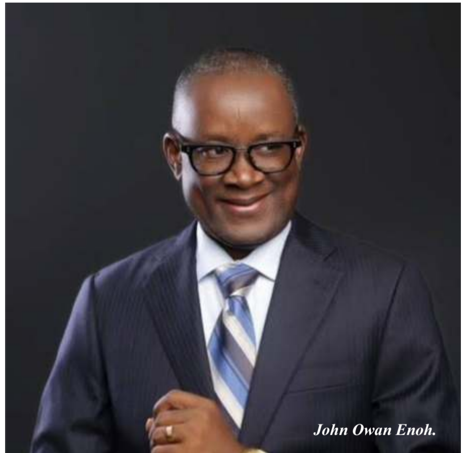
John Owan Enoch.

He served as a Senator representing the Central Senatorial District of Cross River State in the 8th Assembly of the Senate, after he represented his constituency in the Federal House of Representatives.