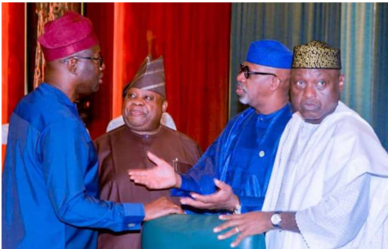
From left, Oyo State Governor, Mr. Seyi Makinde, Osun State Governor, Senator Ademola Adeleke, Ogun State Governor, Prince Dapo Abiodun and Ekiti State Governor, Biodun Oyebanji at the National Executive Council Meeting (NEC) held at the State House, Abuja.