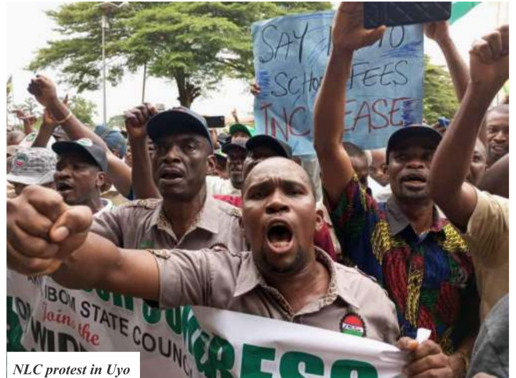
NLC protest in Uyo

identified with the plight of workers, commended the peaceful disposition of workers' protest in the state and made more announcements to the delight of workers.