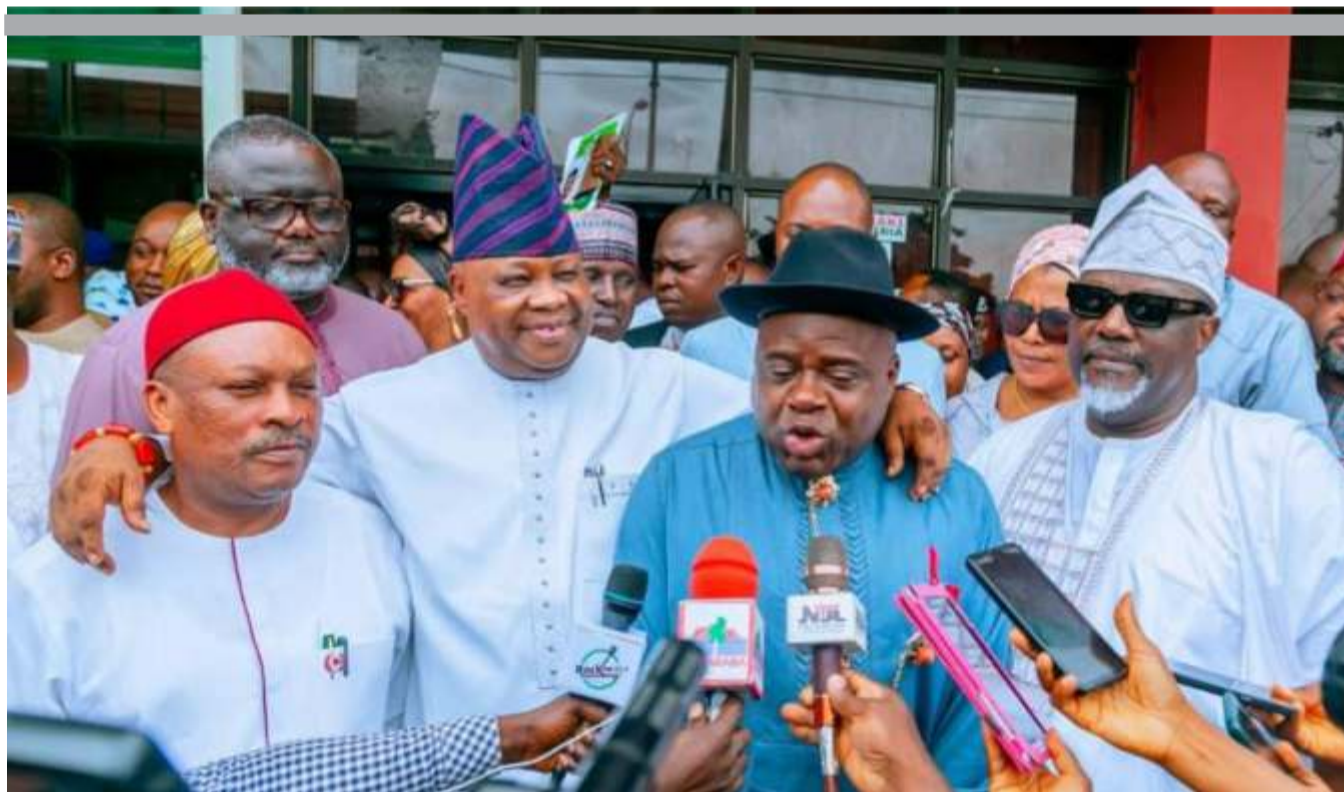
From left PDP National Secretary, Senator Samuel Anyanwu; Osun State Governor, Senator Ademola Adeleke; Bayelsa State Governor, Duoye Diri and Dino Melaye at the Kogi, Imo and Bayelsa Campaign Council inauguration in Abuja.

Says political office holders gulping less than N100million monthly, warns against violent protests by workers