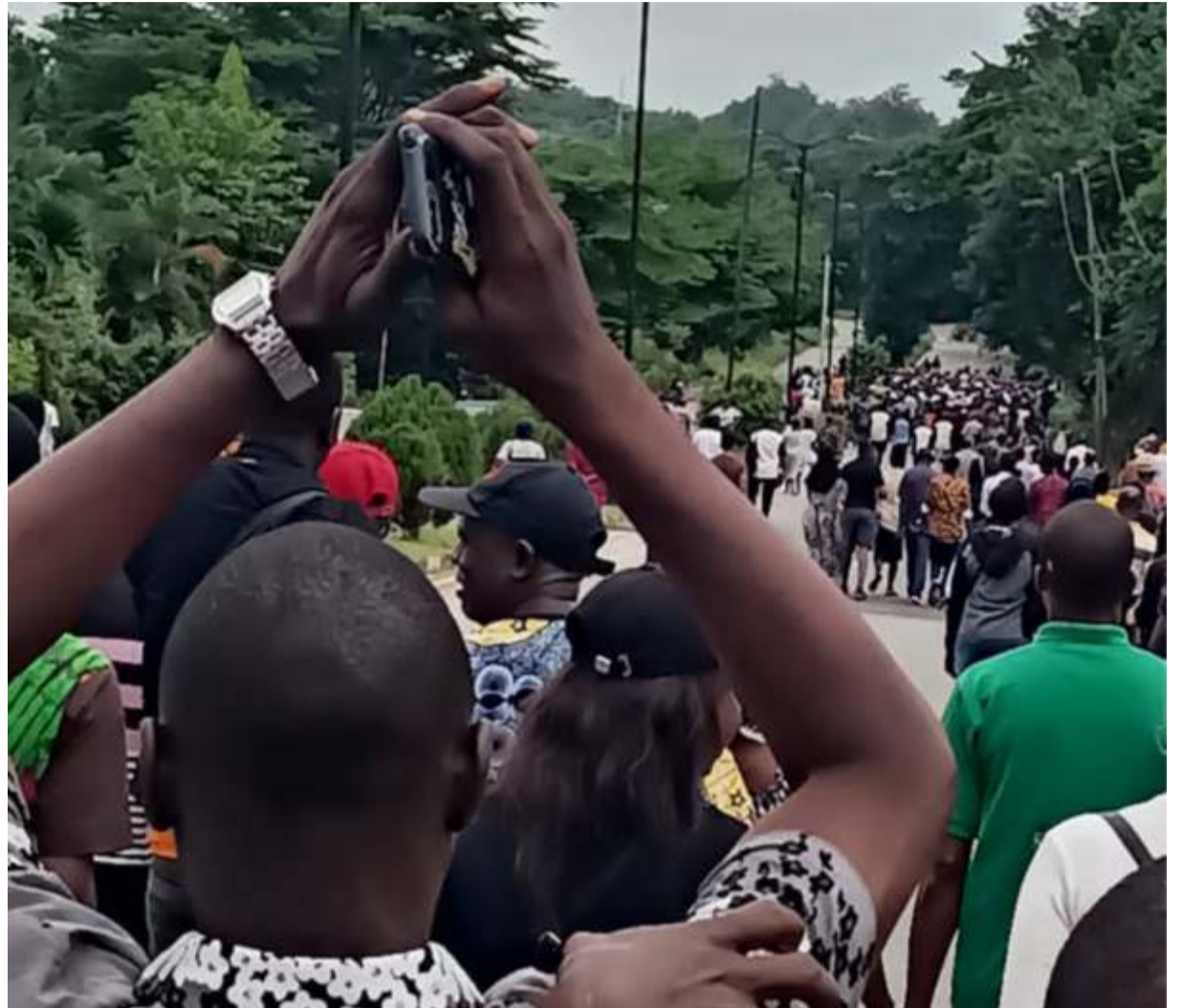
NLC/TUC members during the protest on Fuel subsidy removal in Ibadan on Wednesday

According to the statement, CP Hamzat also deployed personnel of the state command to man