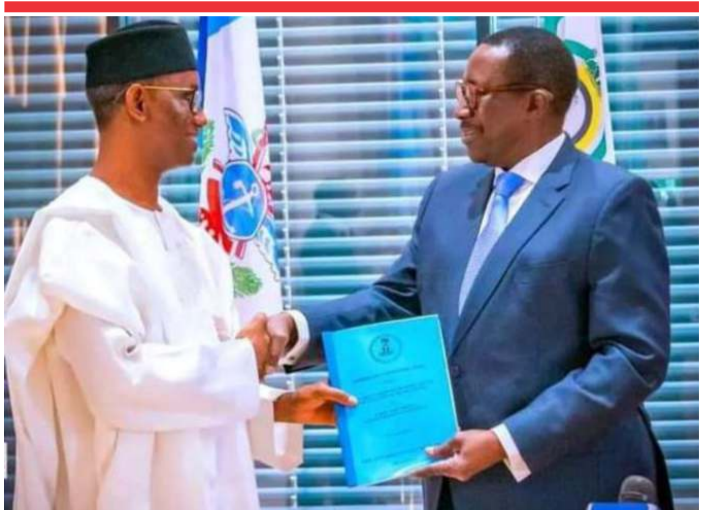
Nuhu Ribadu (left) officially assumes office as the National Security Adviser (NSA), receiving document from outgoing Major General Babagana Monguno in Abuja