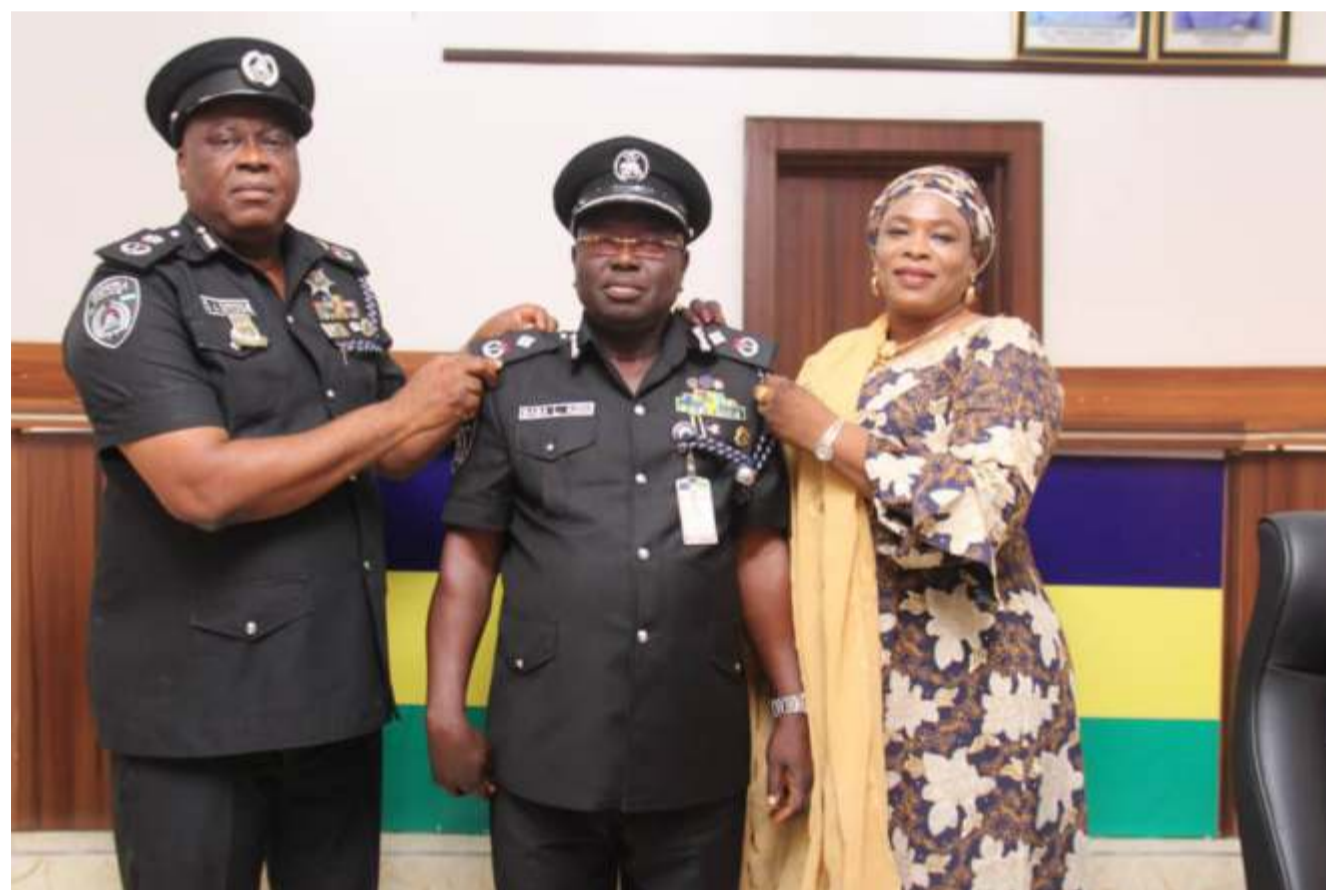
Akwa Ibom state CP Olateyo Durosinmi

The Police Commissioner on behalf of officers and men of the Command also wished all Muslim faithfuls a hitch free and a happy Eid-el-Kabir celebration.