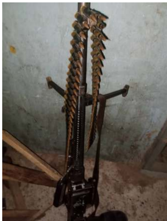
The recovered GPMG