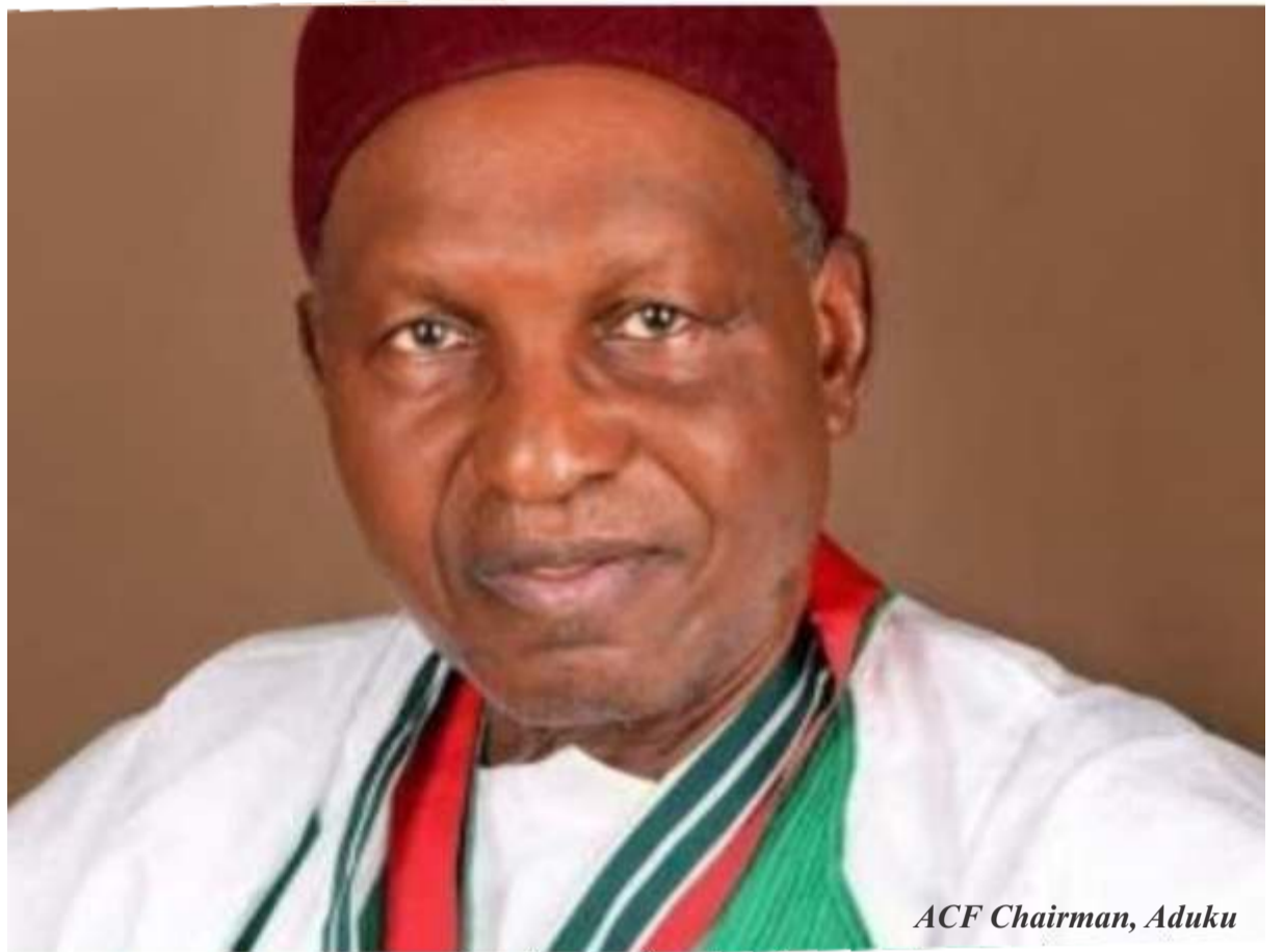
ACF Chairman, Aduku

"Therefore, ACF was never meant to be a divisive political tool in the hands of an individual or a few to use for their local political fights. This Press Release is necessary to quickly inform the general public that the recent position taken by the new chairman of ACF, Architect