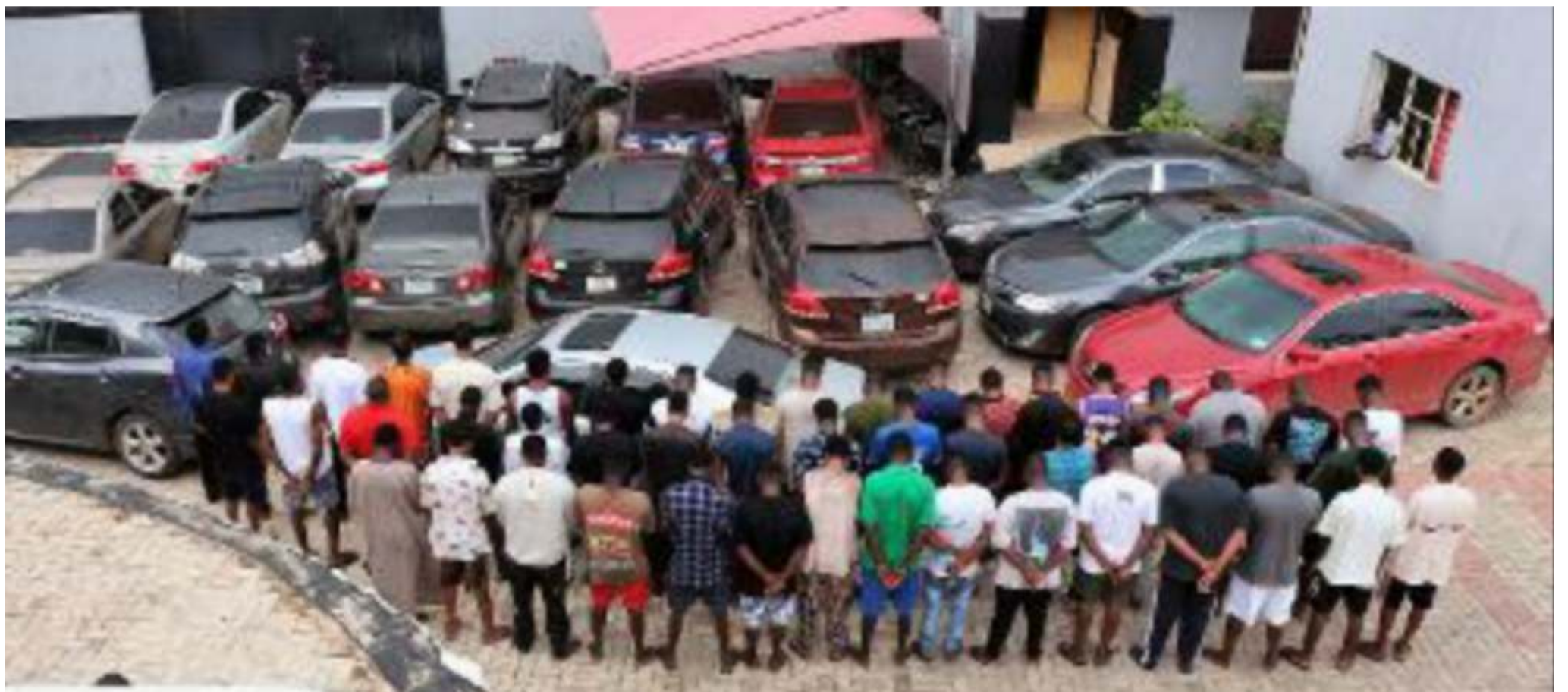
Some of the items recovered by EFCC from the arrested suspects