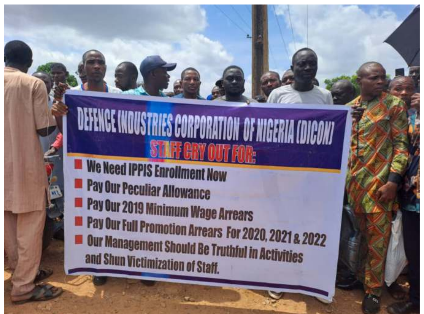
Staff of Defence Industries Corporation of Nigeria in Kaduna protesting against unpaid emoluments

The staff said they have tried all they could by engaging the management and even going to their Ministry to ensure all anomalies were corrected but to no avail, assuring that they will continue with their struggles until their demands are met.