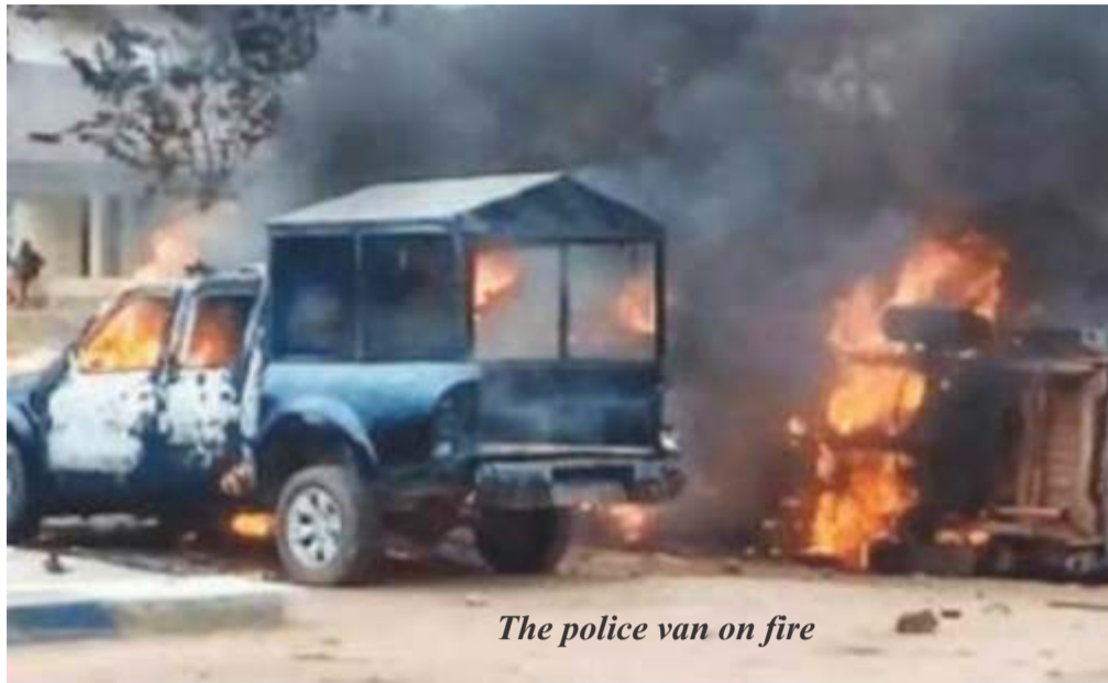
The police van on fire

During a security council meeting at the council's headquarters, Ezzangbo, he vowed to explore every available means to apprehend perpetrators of