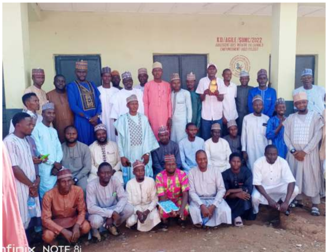
hfinix NOTE 8i