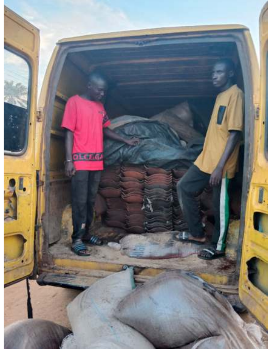
spare anyone caught in the act. One of the impounded trucks with the stolen railway sleepers and suspects

Likewise, citizens with criminal intent of robbing the nation of its assets are advised to desist as the Corps will not spare anyone caught in the act.