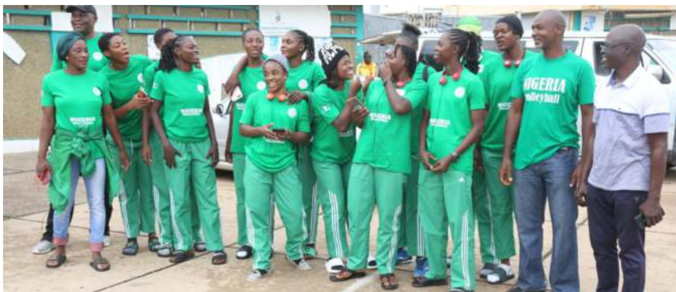
The team in a group photograph shortly before departure.