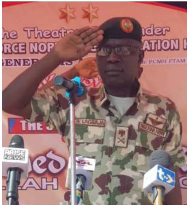
Major General Lagbaja

"It will not be out of place to state that his choice for the exalted position in the