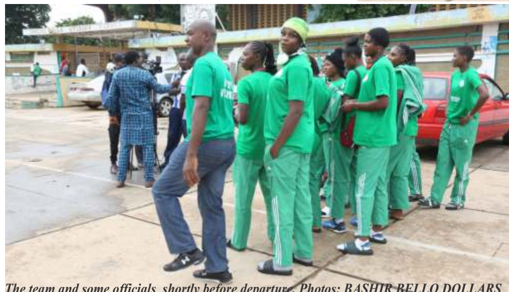
The team and some officials shortly before departure.