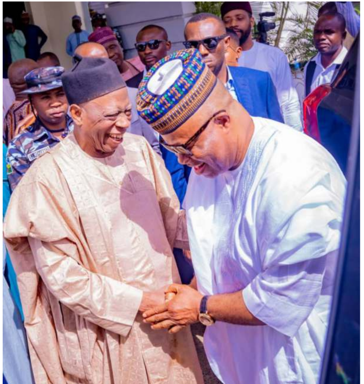
APC National Chairman, Senator Abdulahi Adamu with Senator Godswill Akpabio during the Sallah homage on Saturday.

"Sallah is a period to exchange love which is what Islam enjoins us to do. We are here to pay Sallah homage to a man of honour. To give respect to whom it is due. We thank the leadership of the party and the National Working Committee (NWC) through you for the role you played which led to the success of the National Assembly leadership elections. We also thank the Almighty Allah for