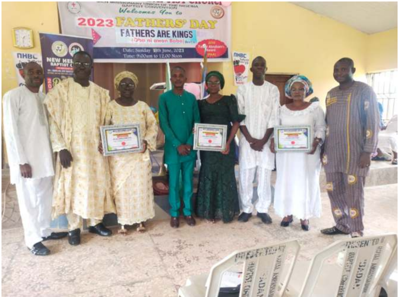
Some recipients of the awards

He said the theme for this year's commemoration of the International Day of Parliamentarism, "Parliaments for the Planet" is designed to mobilize parliaments and parliamentarians to act on the climate emergency.