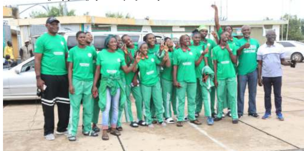
The team in a group photograph shortly before departure.