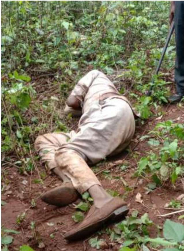
The neutralized suspect

Ganzallo noted that the Officers of the Corps were charged to go after the suspected criminals and were instructed to ensure the victims are rescued unhurt. And the Officers swung into action immediately.