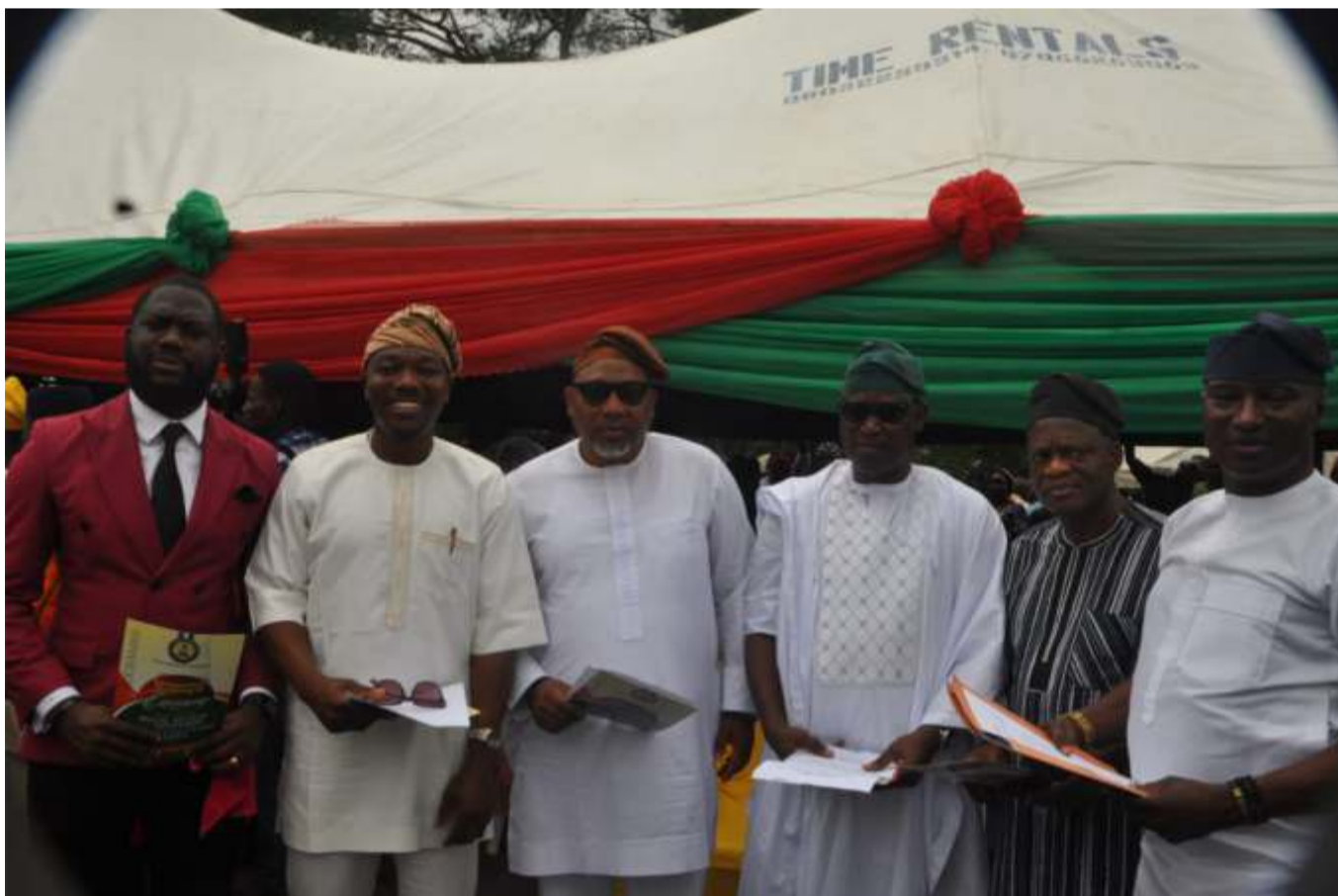
Cross section of the newly appointed special advisers to the Osun State Governor held at the Bola Ige House parking lot, Secretariat Abere Osogbo.

The statement regretted the dehumanisation of Nigerians by DSS under Bichi as very alarming and disturbing and called for help from all and sundry, the intervention of Amnesty International and National Human Rights Commission to look into Bichi's activities with the view to saving innocent Nigerians from further degradation.