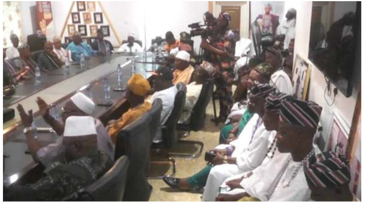
Baales, titled chiefs and kingmakers of Iba kingdom during the conference.

"We have our facts if the Ojo kingdom don't have their own. if you go to where I'm talking about, you will see all these descriptions and that is our current boundary between Iba and Ojo. LASU as we all know is land that were acquired and before LASU is sited to where we known today, it was formally Federal Government College which has now been taken to where we know as Agric in Ojo. The transferring of that College was necessary when the Lagos State Government killed the idea of having that place being used