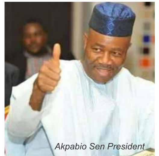
Akpabio Sen President