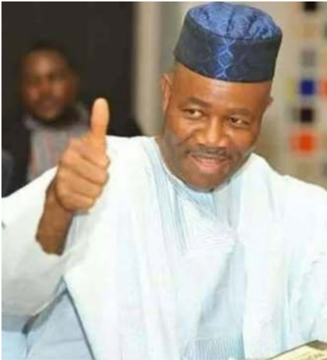
Senate President Akpabio

*Wants urgent implementation of palliatives