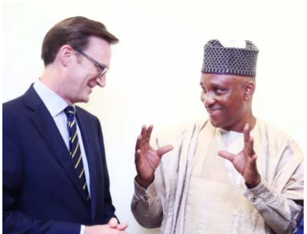
Reps Speaker (right) with the British High Commissioner

The Speaker disclosed that part of the innovations and creativities of the 10th House was to "for the very first time"