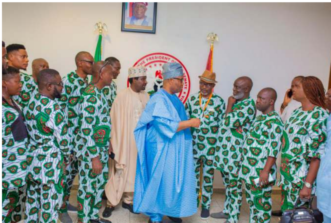
Senator Akpabio with the Scrabble Federation members.