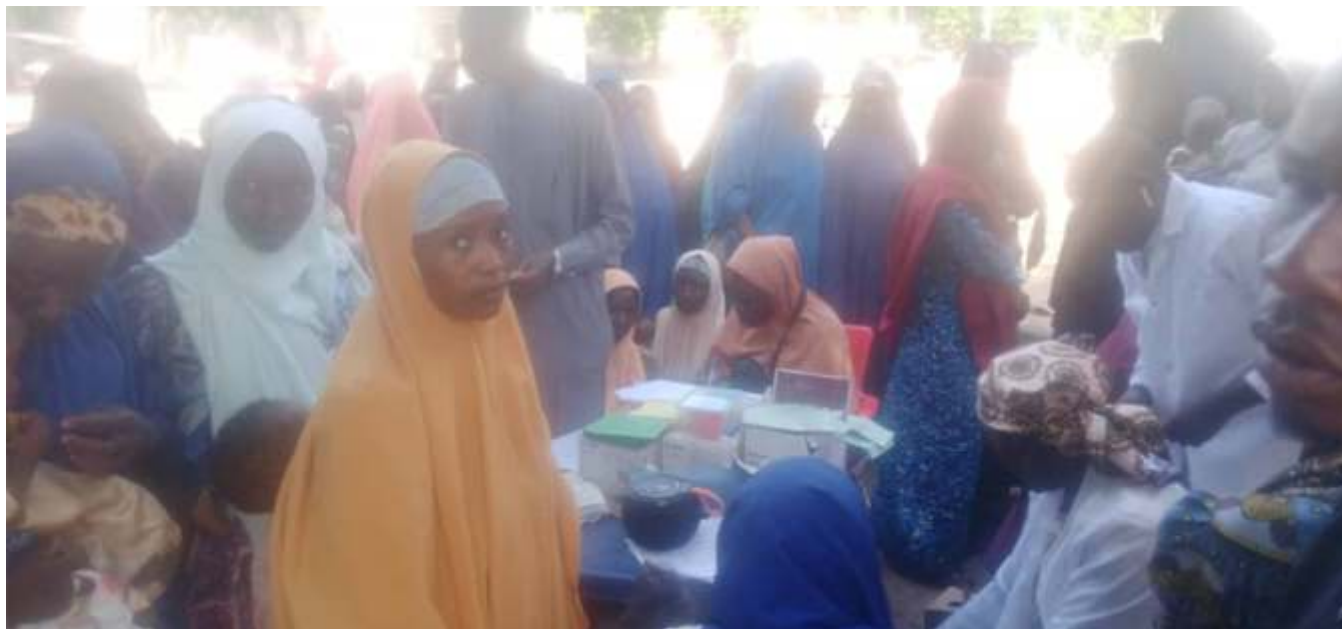
Officials of Borno state government, WHO and other partners conducting Yellow fever vaccination

He further explains, throughout the campaign, WHO Technical officers, LGFs, and Field Volunteers in the implementing LGAs will work closely with Government officials and stakeholders to monitor, supervise and provide the necessary support to ensure that the campaign becomes a success.