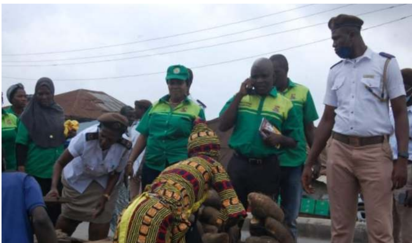
Oyo Government to Clamp Down On Street Traders, see story on Page 9

"Members of the public should desist from entreating the service of touts whose major aim is to exploit", the Comptroller counselled.