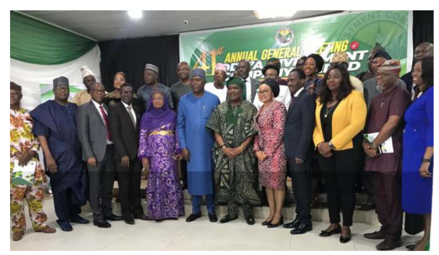
Odua Investment Company team in group photograph