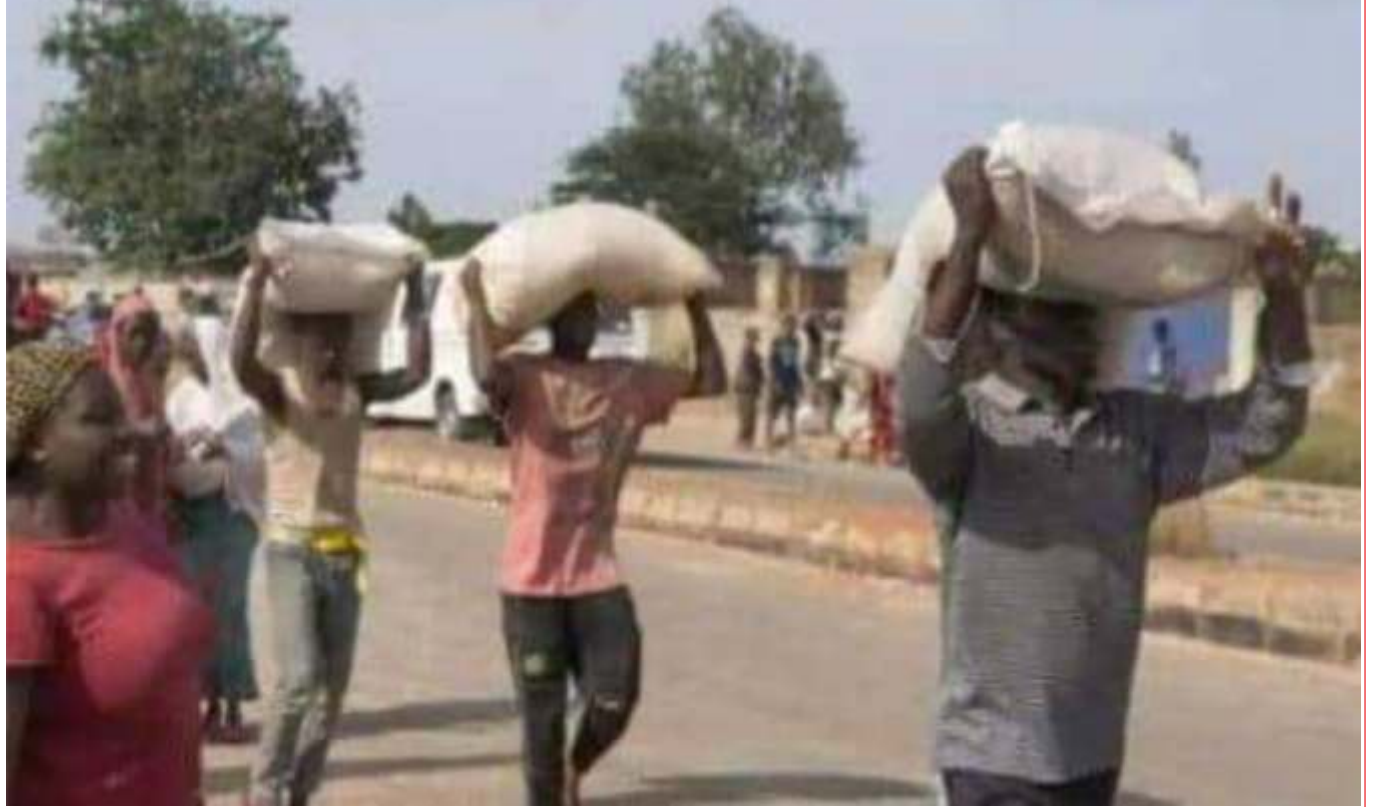
Hoodlums loot the ware house belonging to the National Emergency Management Agency (NEMA) carting away palliatives meant to be distributed to cushion the effect of subsidy removal.

"I didn't stop there, I had to call on the local government chairman. The truth is that the place isn't under construction. I think the best way to manage it is to have palliative measures, like filling the pothole with gravel. These criminals capitalising on the bad patch of the road to rob people. Also, we are going to continue to carry out raids to complement all these efforts." It will be recalled that Operation Flush was launched just last week and in less than a week the police had raided some suspected black spots, arrested over 80 suspects, and recovered a pistol and illicit drugs.