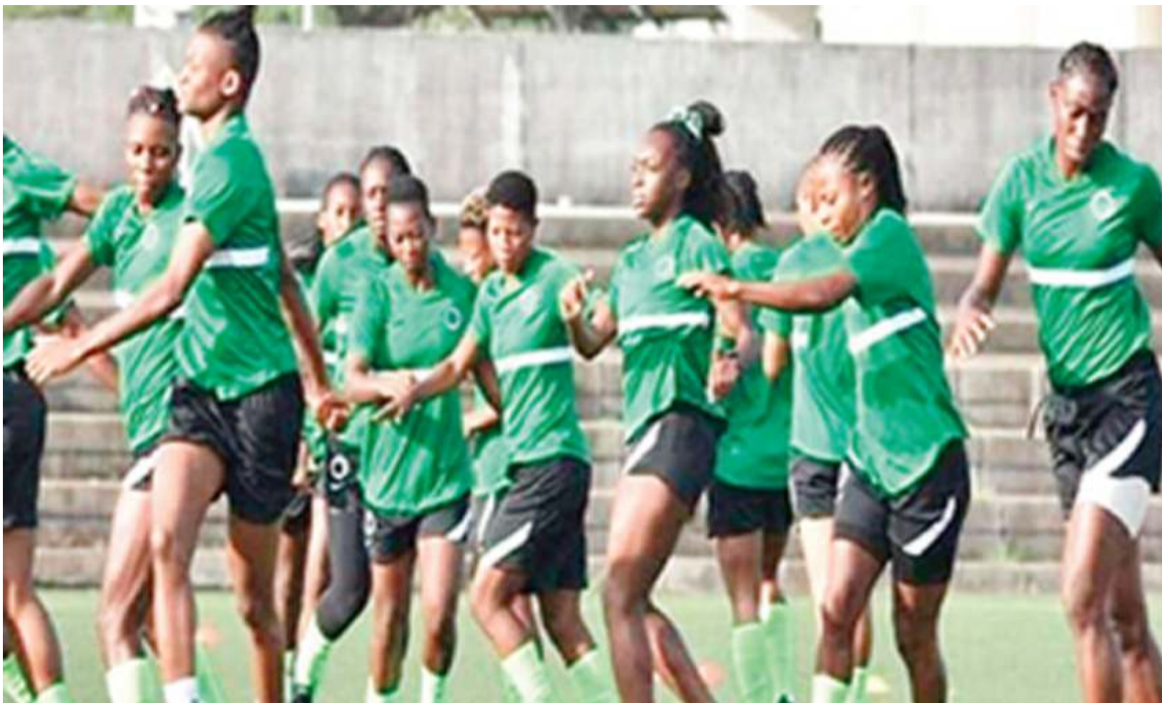
The Super Falconets during training