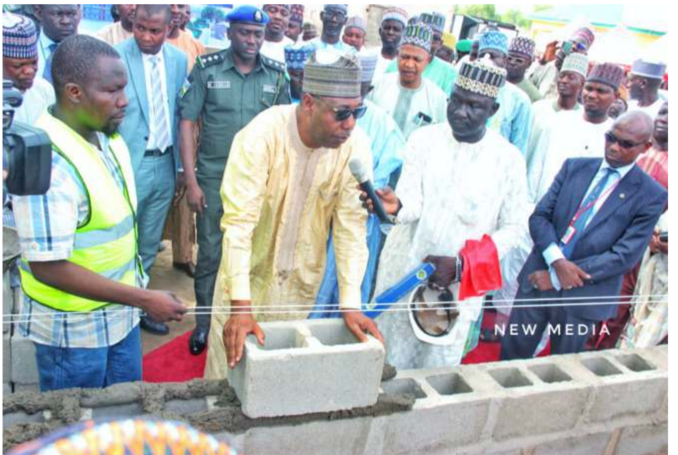
Here Gov Zulum Starts his 2nd term with 25th Mega School In Gamboru

How Uba Sani Emerged Vice Chair Of Progressives Governors Forum P.13