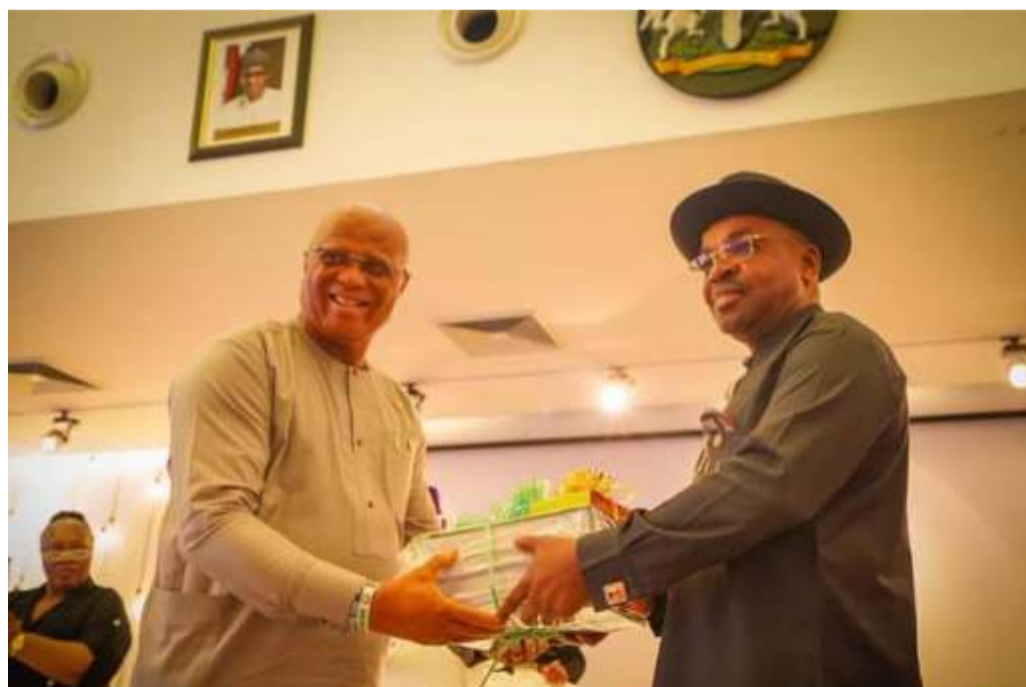
Akwa Ibom state governor, Pastor Umo Eno (left) with immediate past governor Udom Emmanuel during their handing over exercise on Monday