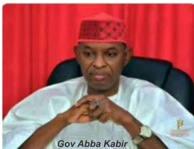
Gov Abba Kabir

Revert To Old Price Of Petrol, Kano Govt Appeals To Marketers