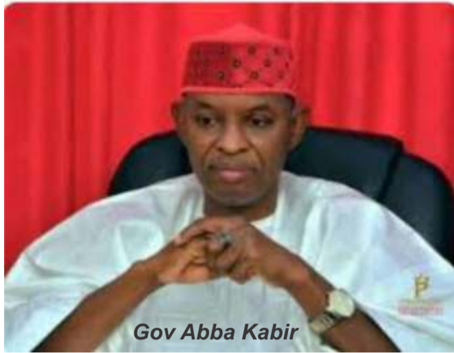
Gov Abba Kabir