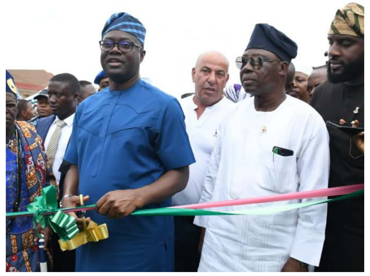
Gov Seyi Makinde flagging off the road construction

*Flags off dualisation of 8.3km Akobo-Ojurin-Odogbo Barracks Road