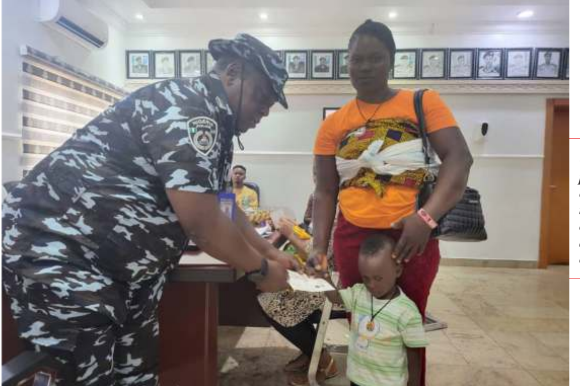
CP Abass presenting cheque to the son of one of the deceased officers