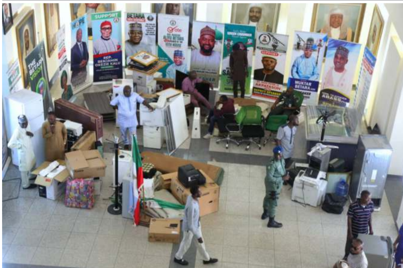
Senators who lost reelection bid packing their office gadget and other items yesterday before the valedictory session of the 9th National Assembly.