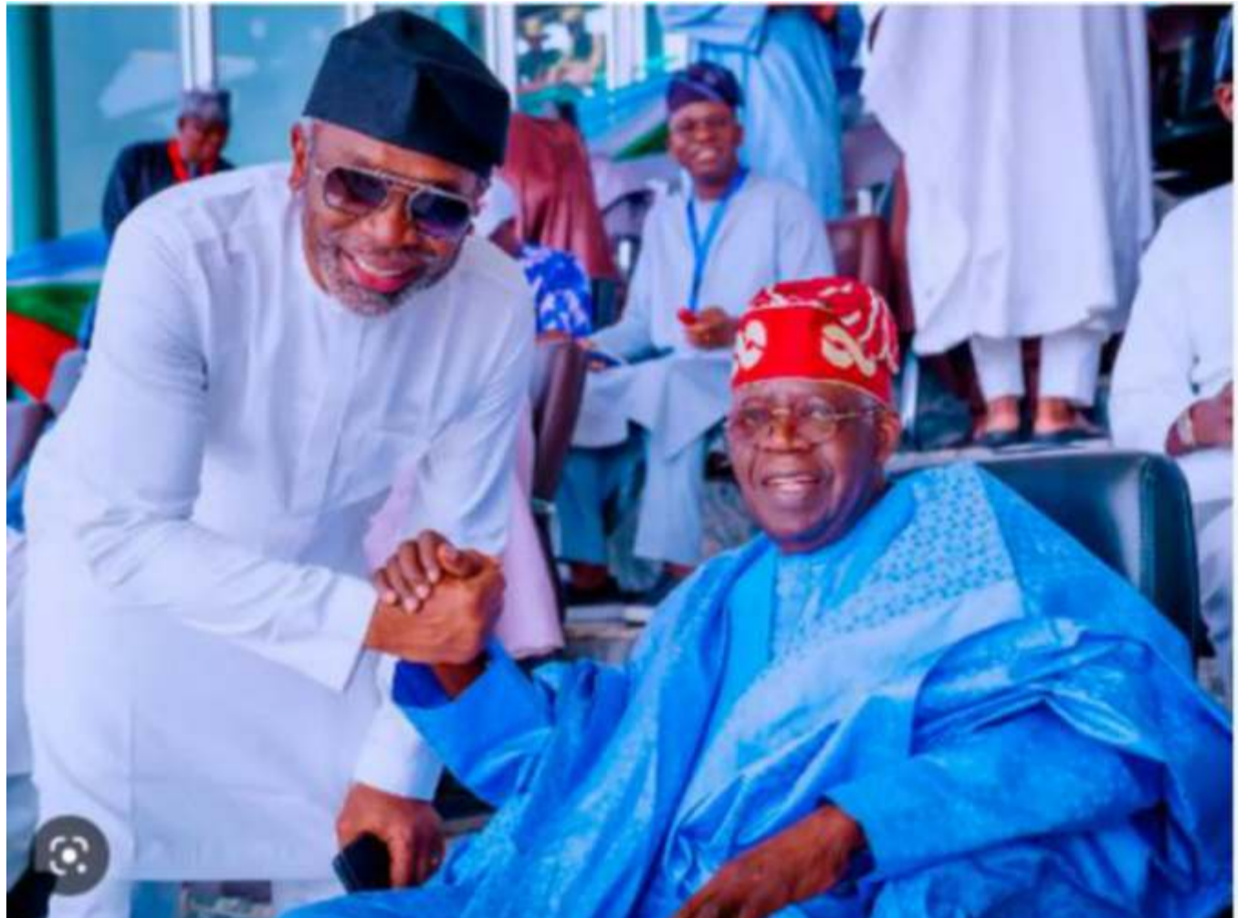
Gbajabiamila (left) with Tinubu

Chief of Staff and commends the President and Commander-in-Chief of the Armed Forces of the Federal Republic of Nigeria, President Bola Ahmed Tinubu for making the best choice that would certainly facilitate national development," the statement concluded.