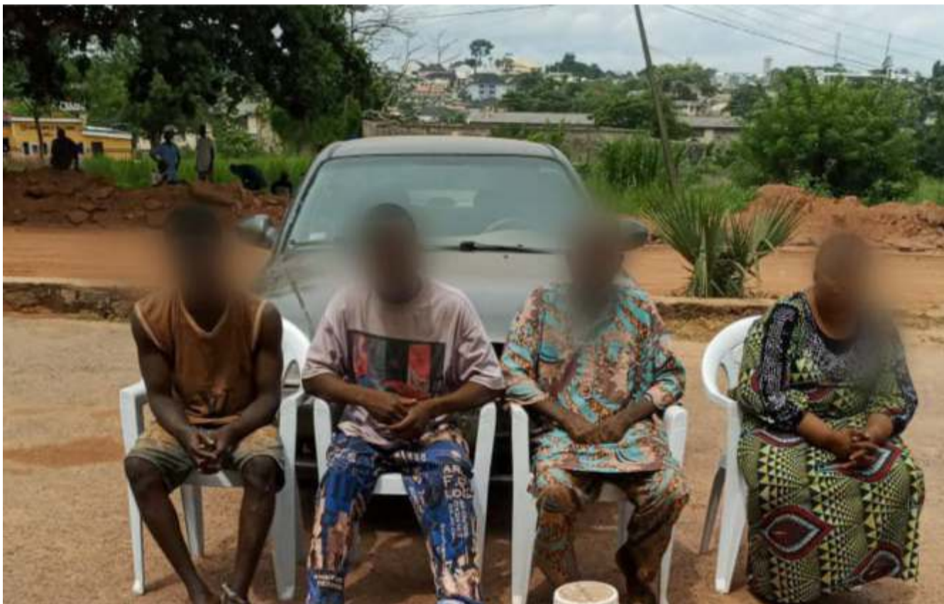
Some of the suspects