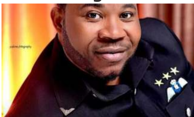
Late Murphy Afolabi

Popular Nollywood Actor Murphy Afolabi Dies In Lagos