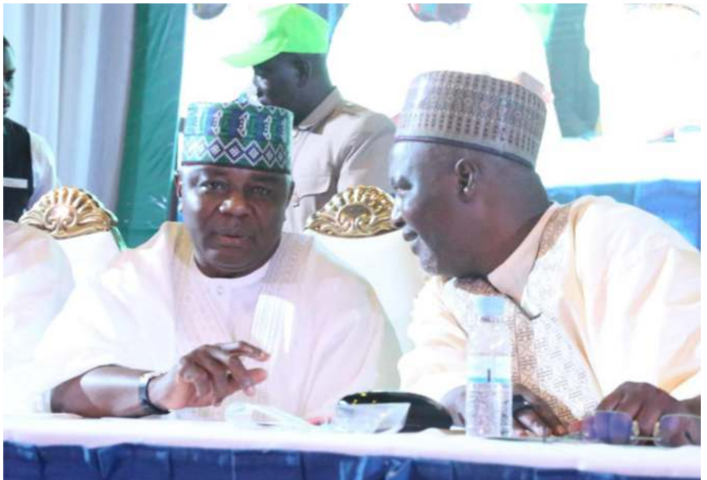
L-R: Chairman House Committee on Appropriation, Hon, Mukhtar Aliyu Betara and Deputy Speaker House of Representatives, Rt. Hon. Ahmed Idris Wase, the two are co-contestant for Speakership aspirant for 10th NASS, during the Wase declaration in Abuja

It explained that failure on the part of Federal Government to stick to tenets of due process spelt in their rules of engagement since the commencement of negotiations on the Adjustment of CONHESS as was done for CONMESS and the other lingering demands as highlighted above within the 15 day window, it would be clear that it is the Federal Government that should be held responsible for the fall-outs of a possible strike.