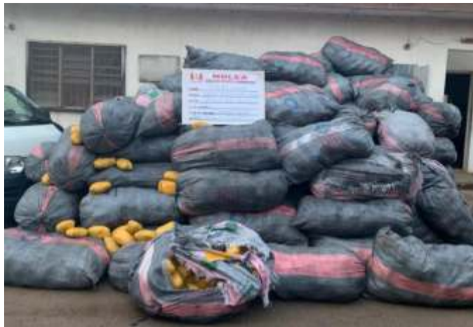
Pic of some of the seized illicit drugs

Drug War: NDLEA Seizes 8,852kg Illicit Drugs After Gun Battle In Lagos, Arrests 9 Traffickers In Other States PAGE 4