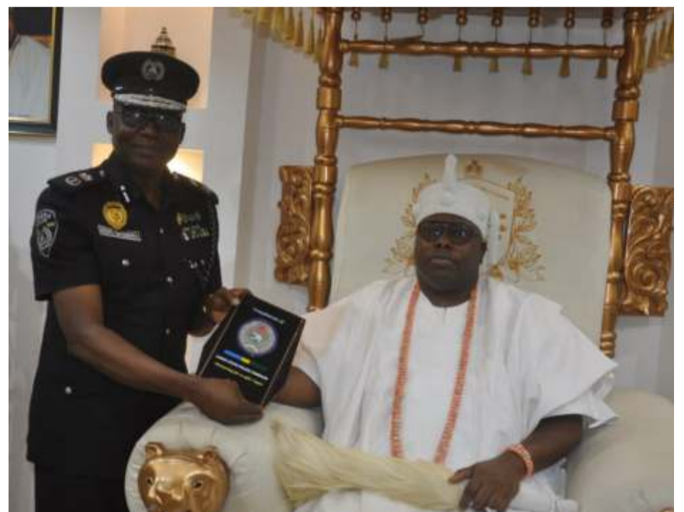
L-R; Lagos State Commissioner of Police, Idowu Owahunwa presenting a police plaque to HRM Oba Abdul-Wasiu Omogbolahan Lawal (Abisogun II The Oniru of Iru Kingdom) in his Lagos