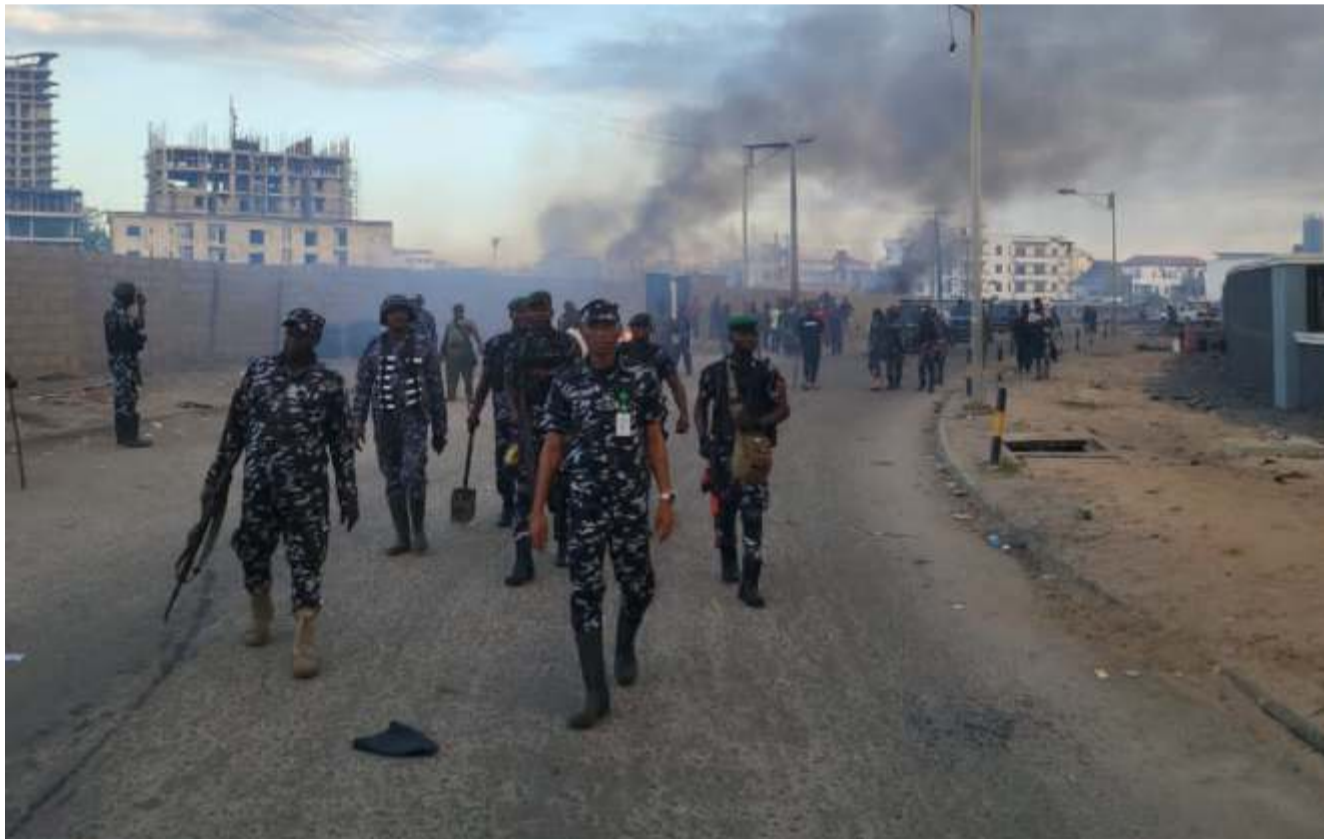
Taskforce Operatives during the mop up exercise.

"Clearing of this area will be sustained for as long as it takes till we achieve our objective of creating a society that is safe and habitable for residents and Lagosians as a whole", he warned.