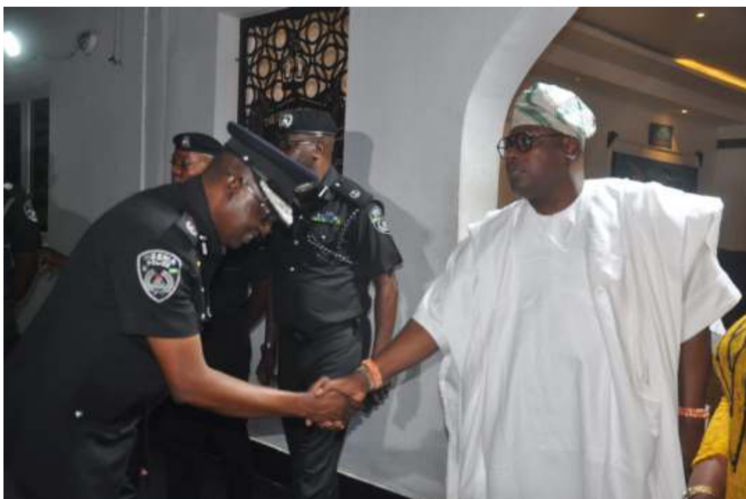
R-L; HRM Oba AbdulWasiu Omogbolahan Lawal (AbisogunII The Oniru of Iru Kingdom) presenting the magazine of the palace to Lagos State Commissioner of Police, Idowu Owahunwa in his palace in Lagos.