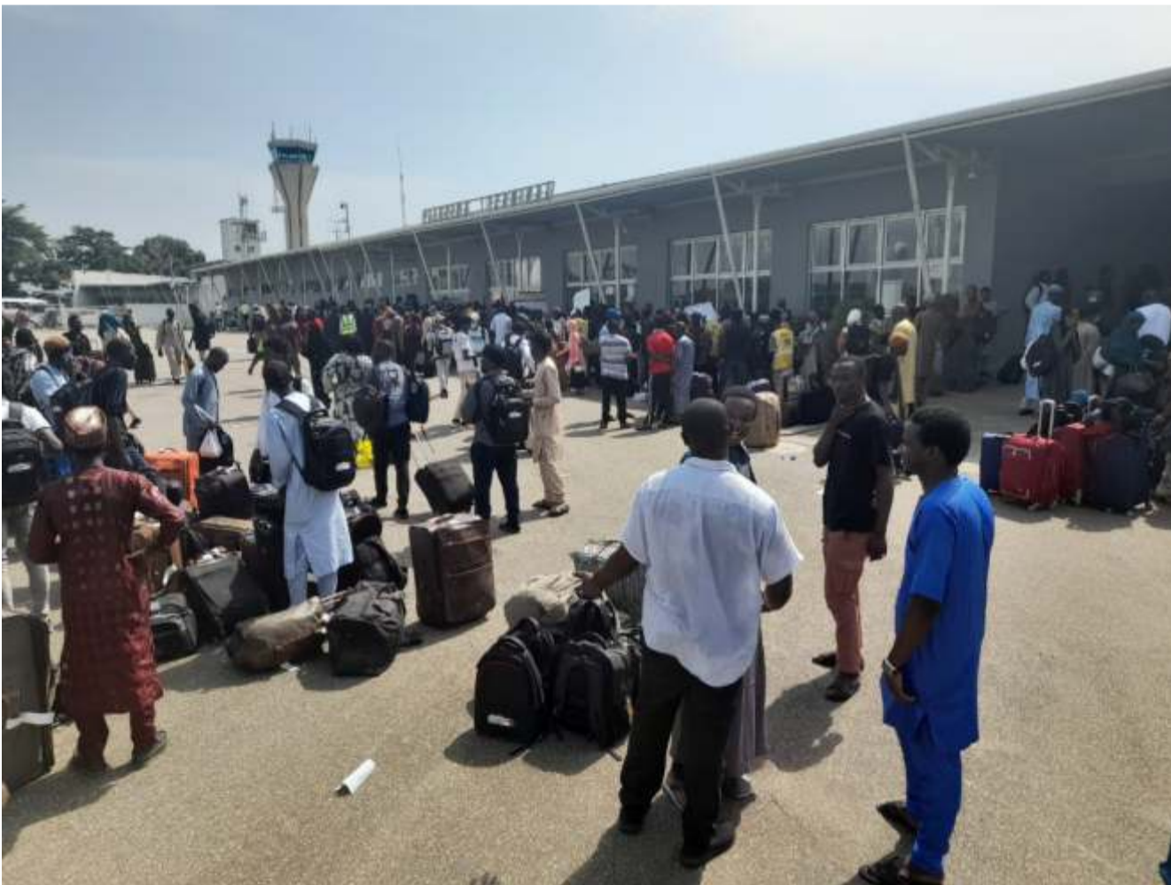
Parents and returnees at the airport