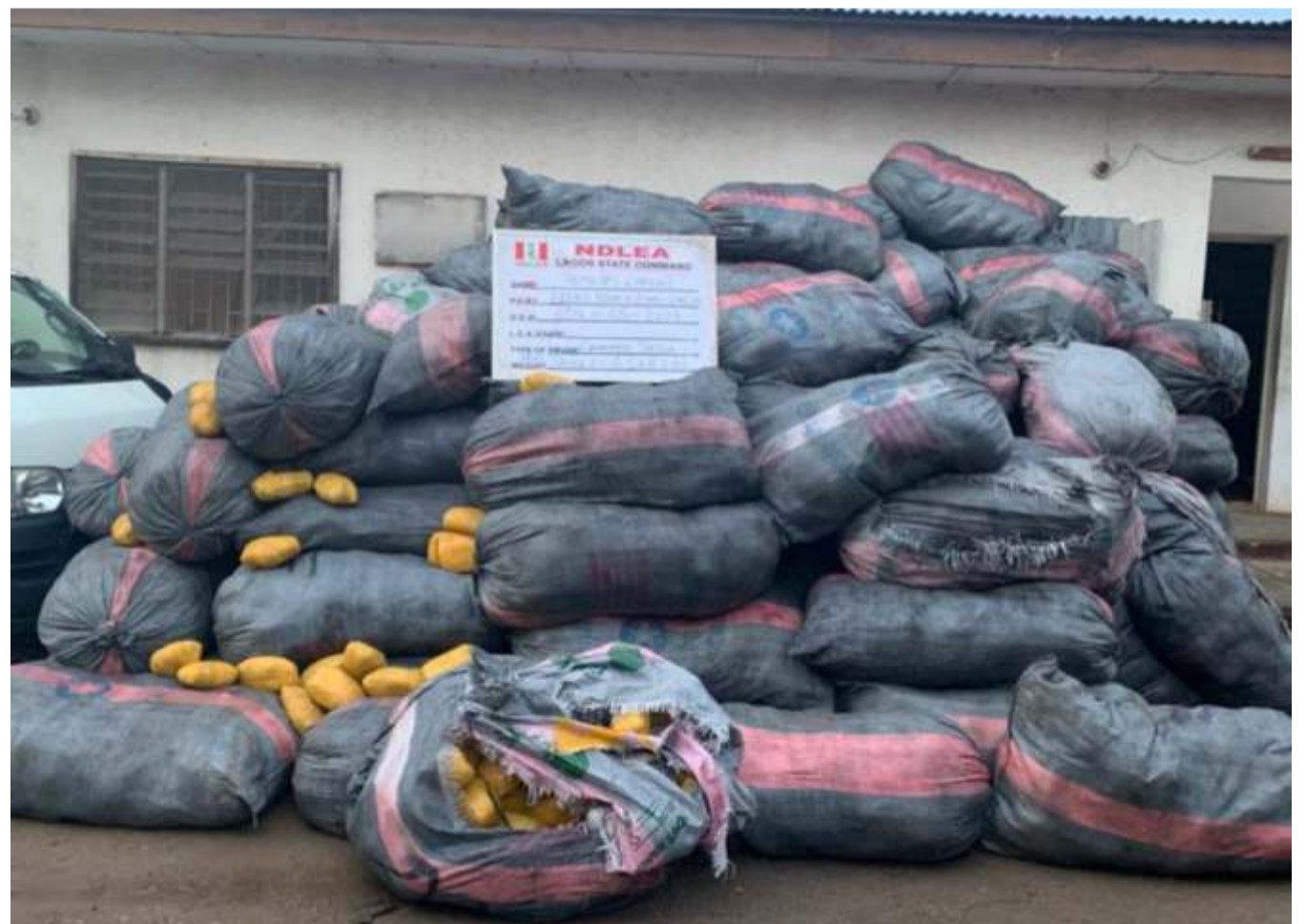
Pic of some of the seized illicit drugs

"The seizure at a courier house in Lagos on Tuesday 2nd May was a follow up operation to an earlier interception of 3.389kg of the same substance on 23rd February 2023. A suspected drug courier, Paul Adetigbe who delivered the previous parcel was eventually arrested with the latest consignment.