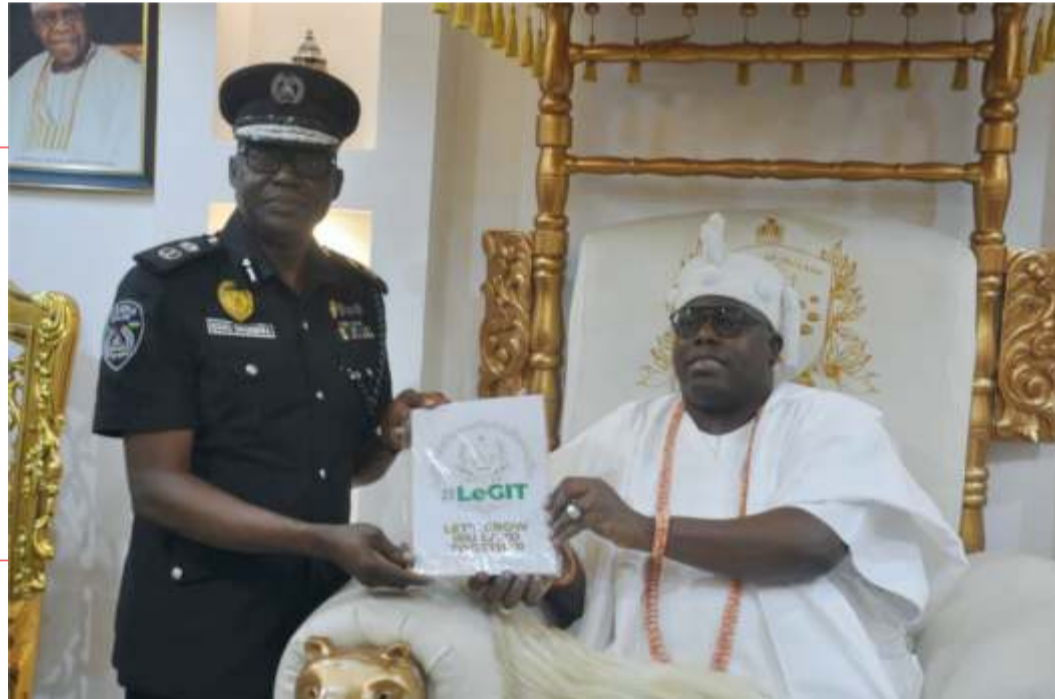
R-L;HRM ObaAbdul-Wasiu Omogbolahan Lawal (Abisogun II The Oniru of Iru Kingdom) presenting the magazine of the palace to Lagos State Commissioner of Police, Idowu Owahunwa in his palace in Lagos.