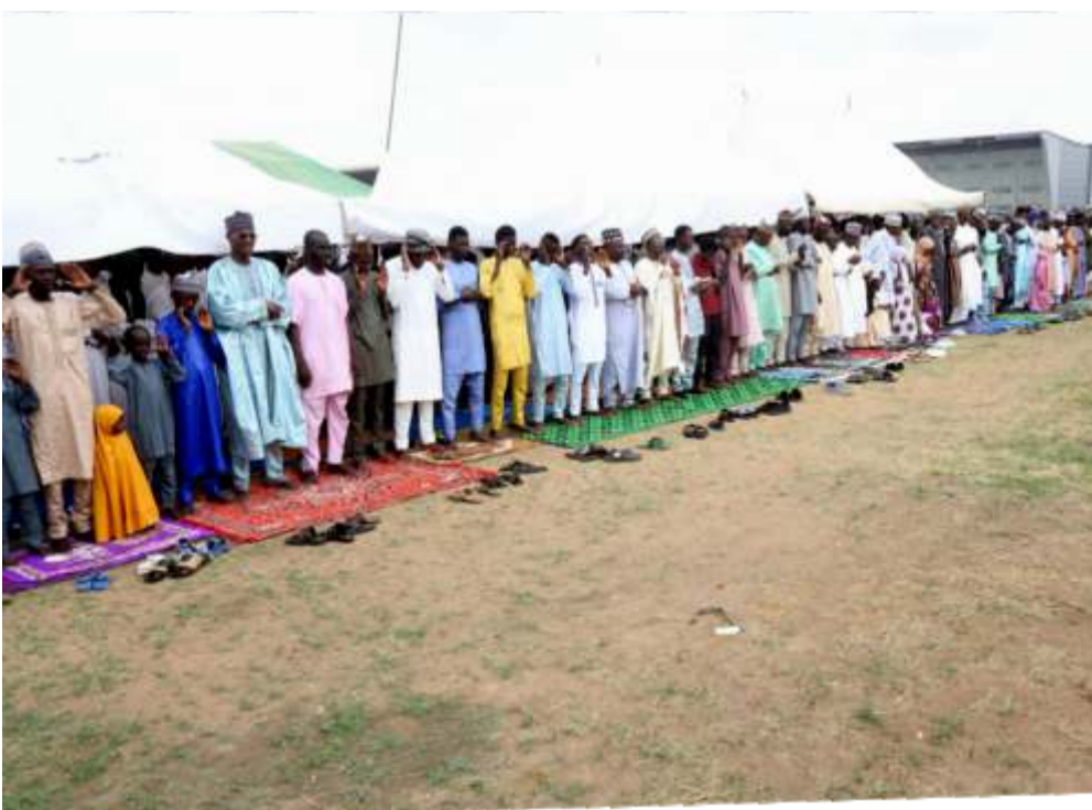
Thousand of Muslims Ummah observing the 2023, Eid-El Fitr prayer at eid praying ground Murtala Square in Kaduna.