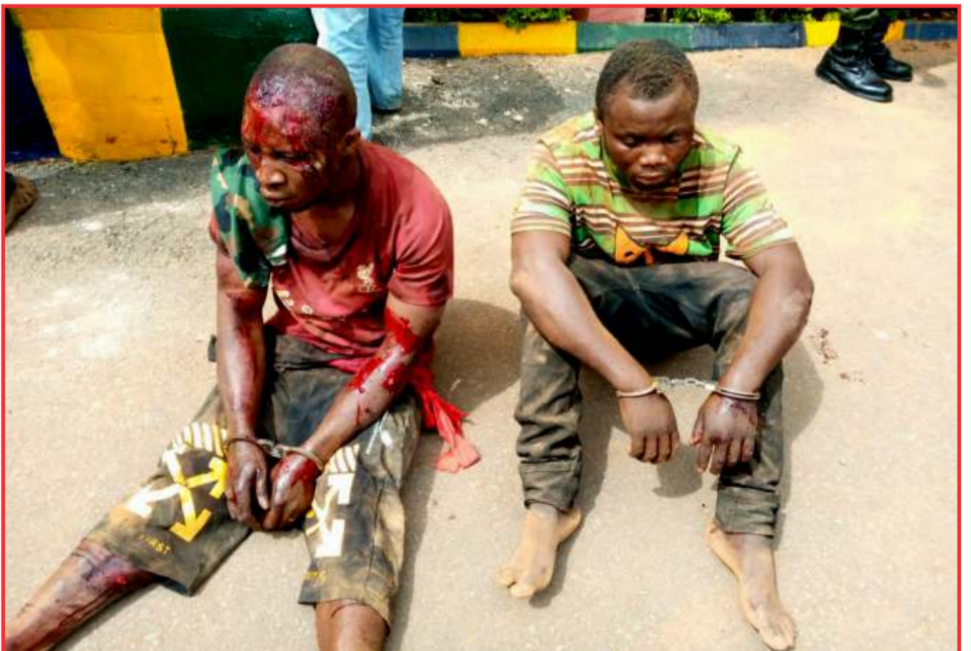
The two suspected kidnappers Intercepted In Ebonyi yesterday.

Cerebospinal Meningitis Claims 118 Lives In Nigeria - NCDC