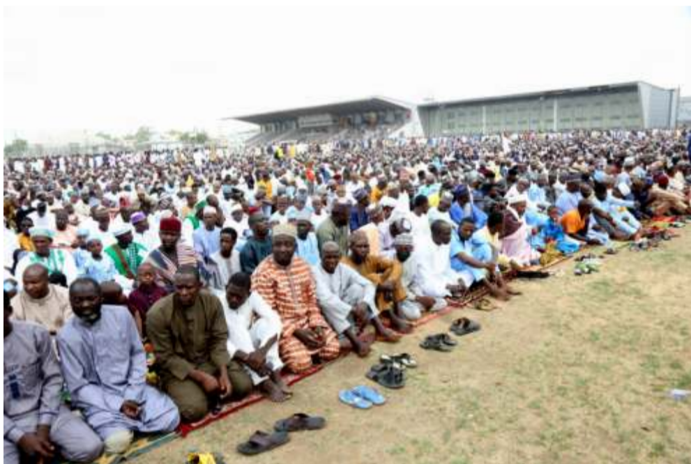
Thousand of Muslims Ummah observing the 2023, Eid-El Fitr prayer at eid praying ground Murtala Square in Kaduna.