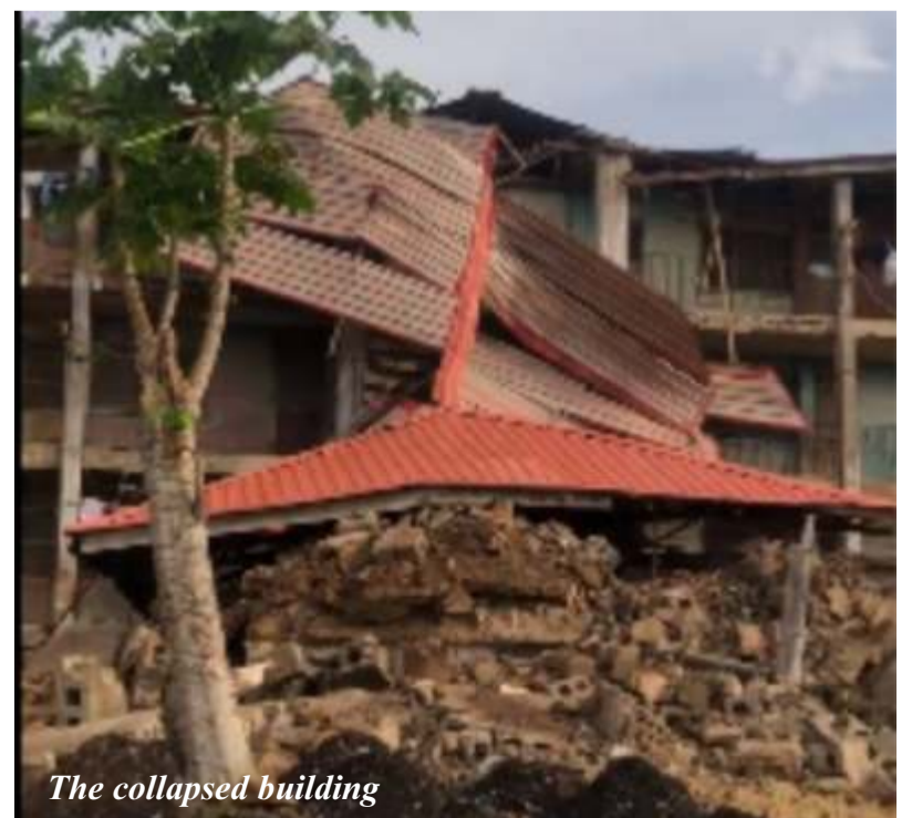
The collapsed building

He disclosed further that about four generating set were still trapped under the rubble of the collapsed Block 11 of the Police Barracks and that the Agency ensured that none of the about 168 occupants of the entire building passed the night in the Barracks due to the collapsed part.