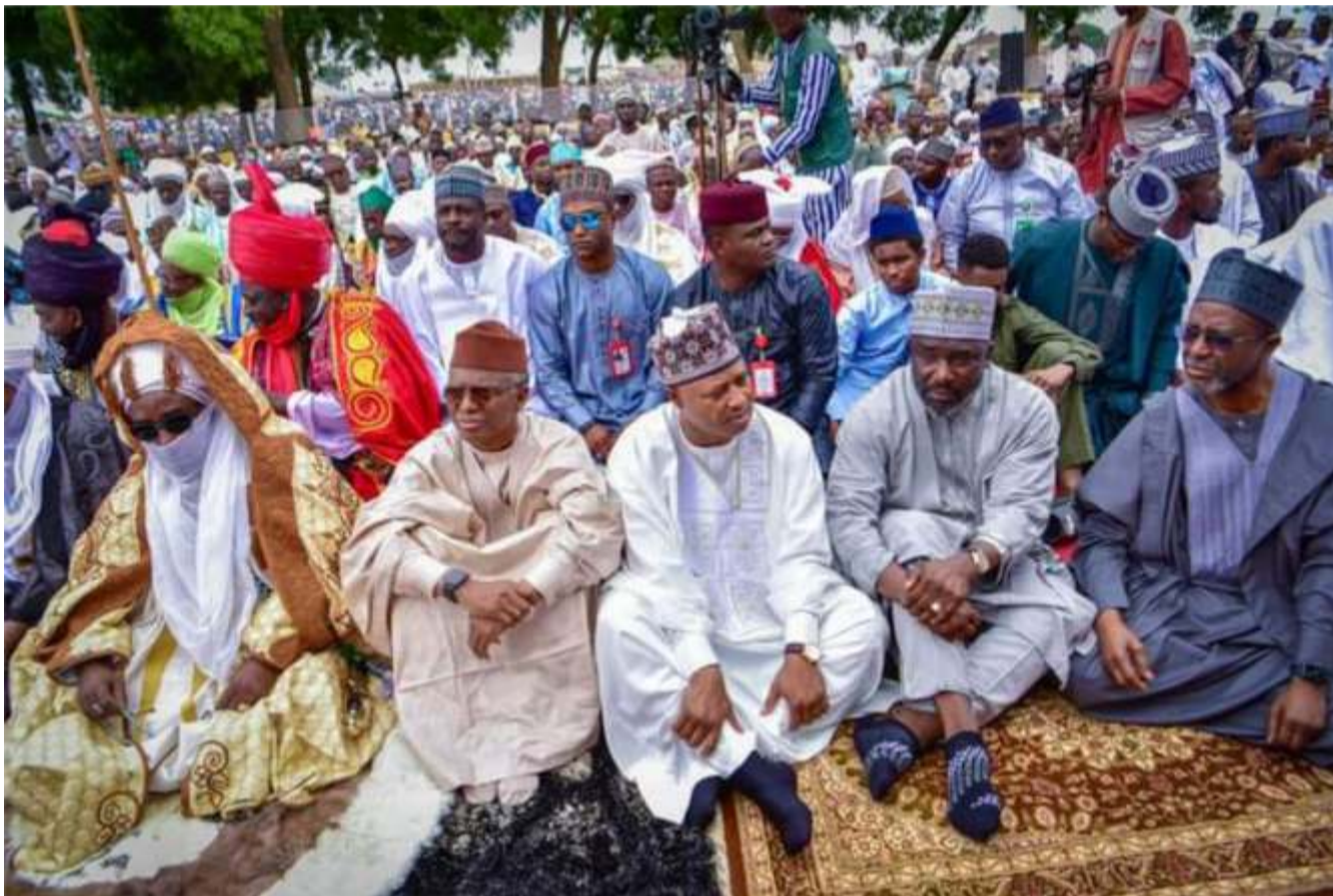
Governor Nasir Ahmad el-Rufai and other dignitaries at the prayer ground on Friday.

The statement said, governor also appealed to all communities in Kaduna State to uphold peace and harmony, despite the security challenges in many communities. He urged all residents to practise vigilance and be law-abiding.