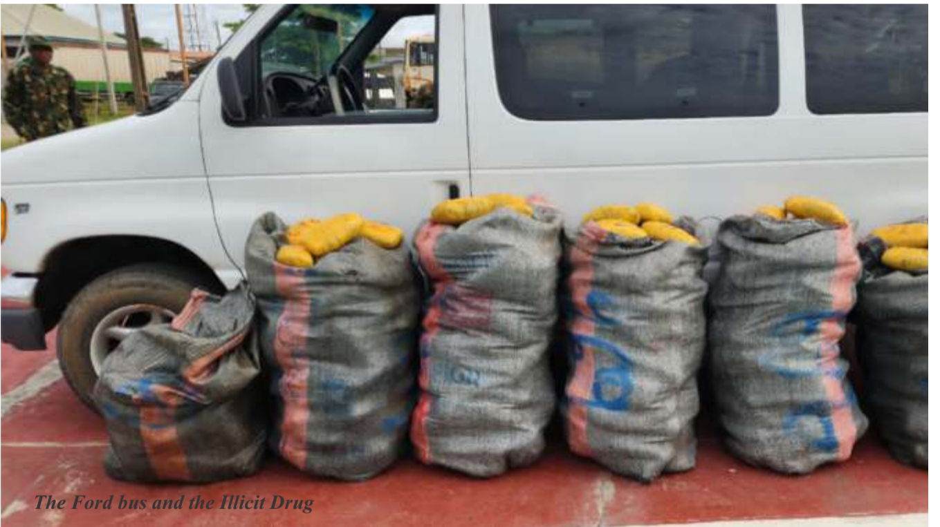
The Ford bus and the Illicit Drug

" He also urged them to ensure that all facilities and critical government infrastructures in their Area of responsibility are protected during this period as always."