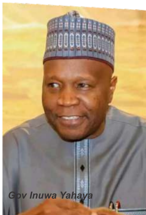
Gov Inuwa Yahaya

"Let me express my immense gratitude to our traditional rulers, community and religious leaders and indeed the entire people of Gombe State for their support to our administration. I urge us all to