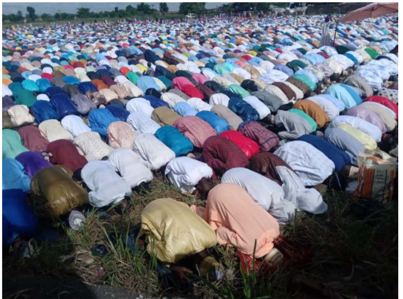
Muslim faithful praying during 2023 Eid-el-Fitr prayers at Ikeja praying ground in Lagos.

While urging residents, visitors, motorist and the general public in Oyo state to exhibits high level of discipline on our roads during and after the Eid - El Fitr celebration, the Sector Commander admonished them to cooperate with law enforcement agencies and ensure maximum compliance with traffic laws and regulations and that they should exemplify the essence of the season which is for spiritual reflections and growth to help those in need, spend time with loved ones and obedience to established authorities.