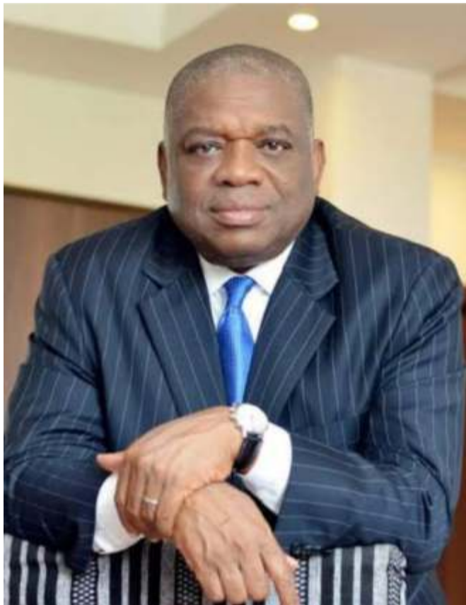
Senator Uzor Kalu

The group urged the APC leadership and the President-elect, Bola Ahmed Tinubu to consider Senator Kalu for the Senate plumb job based on his commitment to APC and dedication to the Pan Nigerian project. "Happy birthday to our able leader," it concluded.