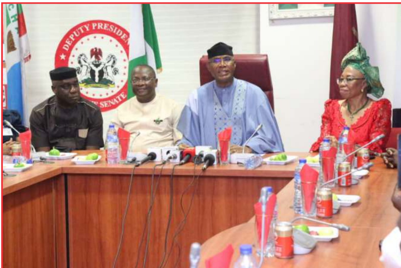
Deputy Senate President Senator, Omo Agege (2nd right) receiving his community members during their appreciation visit to him over the assent of their bill by the president at NASS, in Abuja.

He expressed satisfaction with the synergy between the two agencies, stating that their working relationship will continue to get better in order to achieve more results.