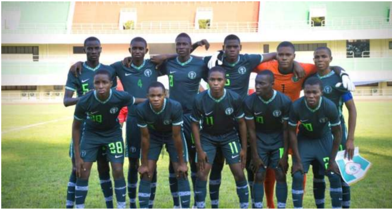
The Flying Eagles

Nigeria, who will be making their 13th appearance at the FIFA U20 World Cup finals, open their World Cup campaign in group D against Dominican Republic on 21 May, and will also play Italy and Brazil in that order in the group phase.