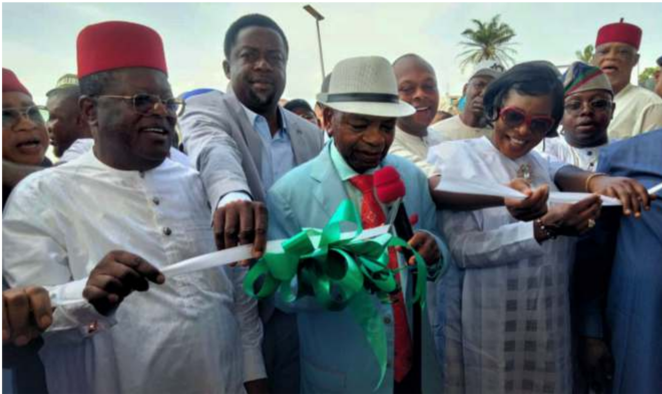
Business mogul, Prince Arthur Eze commissioning an 18 span flyover at Abaomege junction Onicha Local Government Area named after him on Tuesday.

It would be recalled that the high-ranking and revered traditional leader in the state, the Shehu of Borno, His Royal Highness, Abubakar Ibn Garbai Al-Amin El-Kanemi, during the commemoration of WHO 75th Anniversary commended WHO for bringing remarkable transformation to the health system and eradicating diseases in the state.