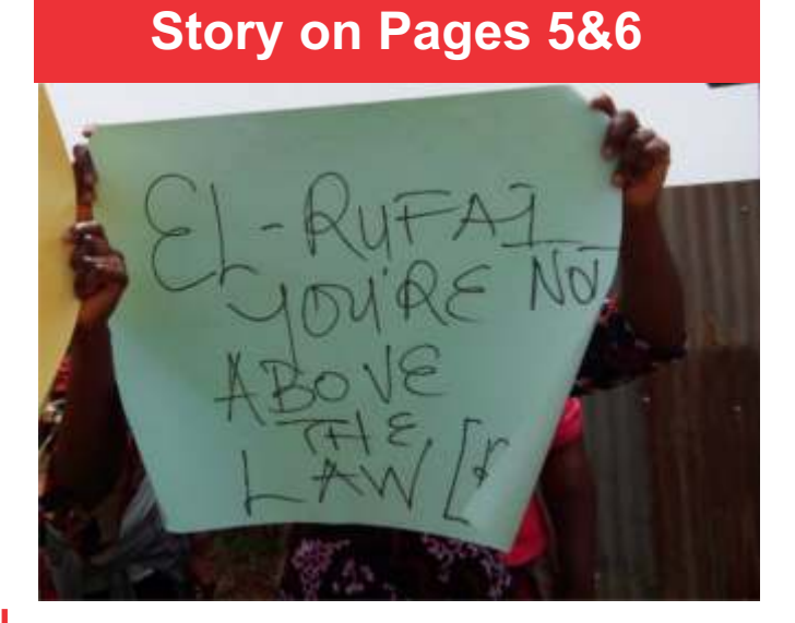
Traditionalists at the press conference in Ibadan yesterday.

The 9th NASSScorecard OfDiminishingLibertyPAGE 16