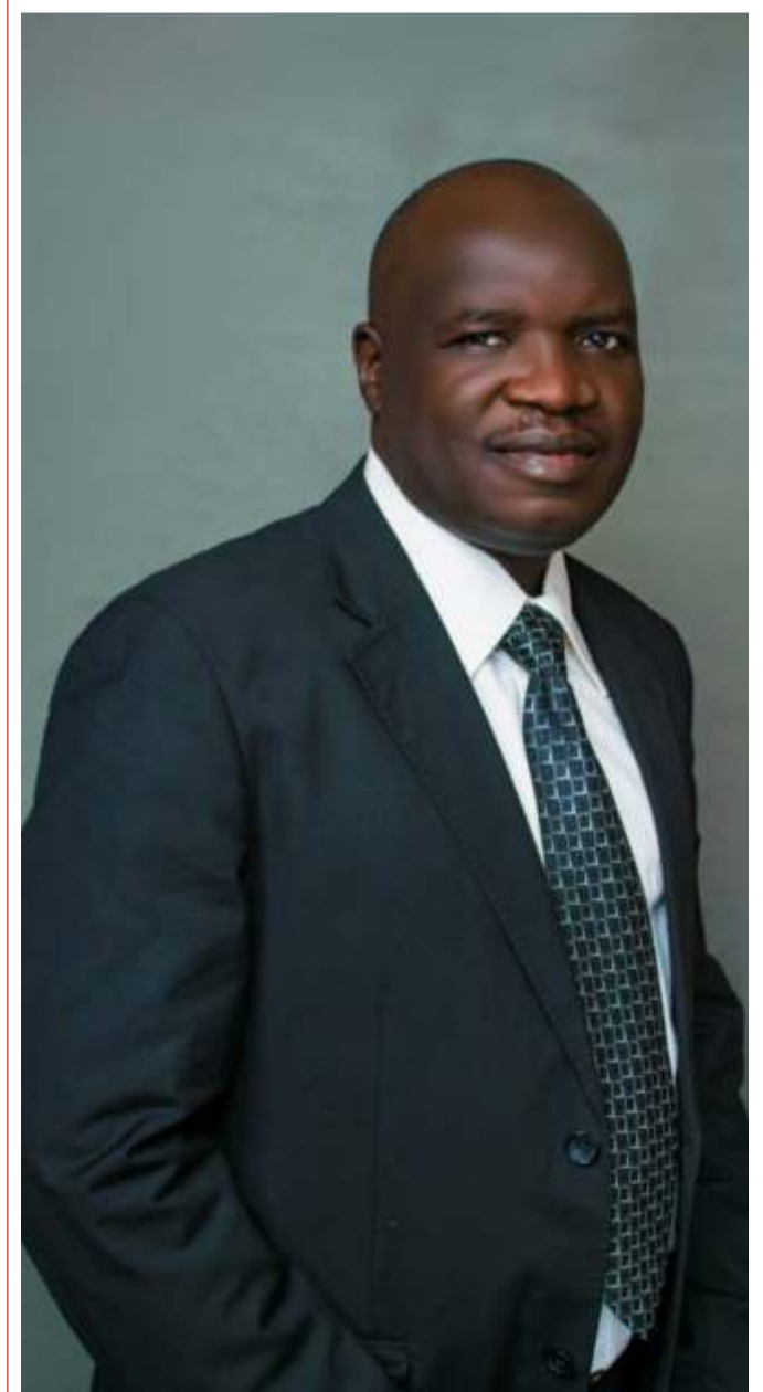
Jema'a LGA Boss

He explained that the people have no place to run to, saying that they have suffered enough hardship, following the various attacks that led to loss of lives, with others wounded, while others had their houses burnt down by the attackers.