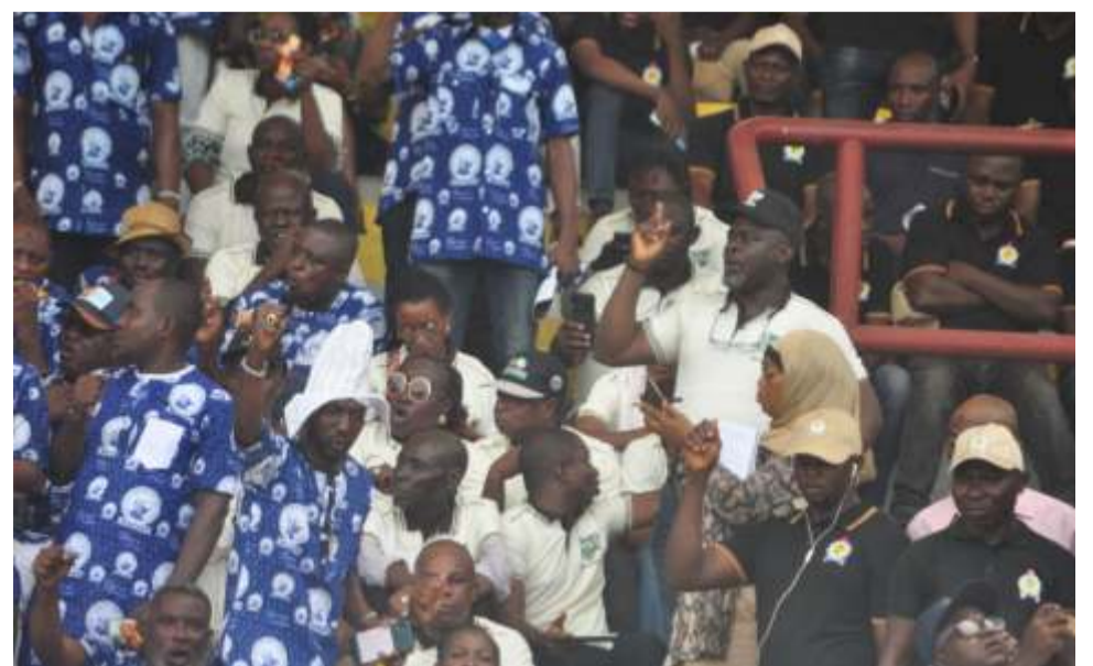
Lagos workers applauding the governor's representative, during 2023 May Day rally at Mobolaji Johnson Arena, Onikan, Lagos. May first, 2023.