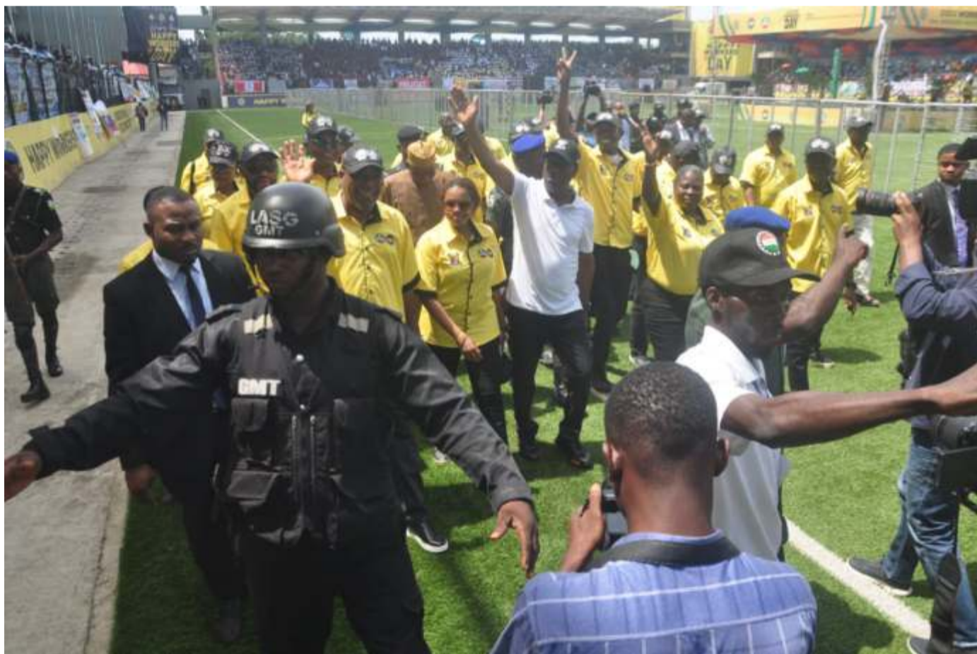
Lagos State Deputy Governor waving to workers, during 2023 May Day rally at Mobolaji Johnson Arena, Onikan, Lagos.