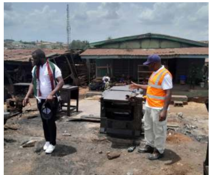
NEMA officials during the assessment tour