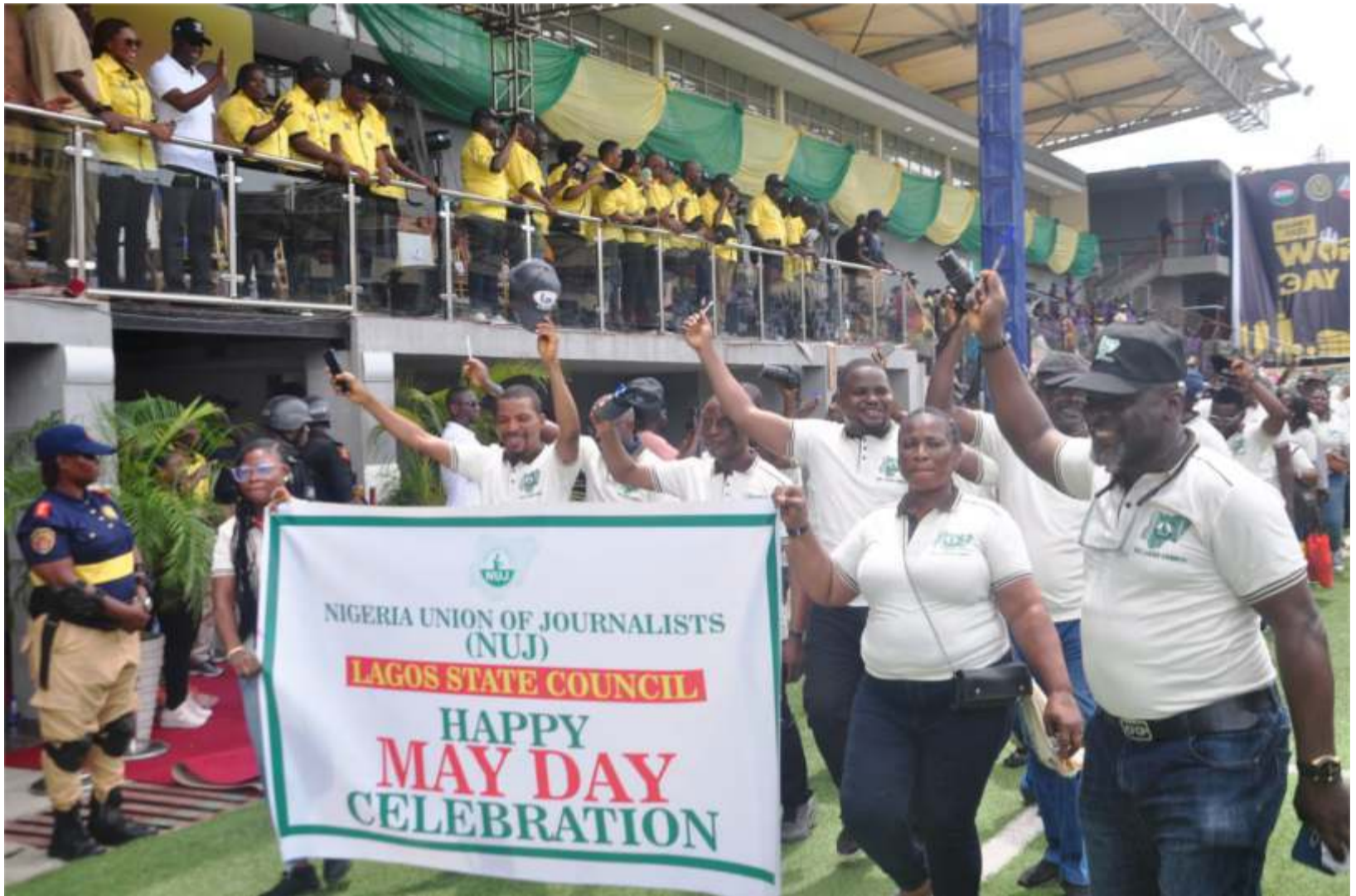
NUJ Lagos Council, during 2023 May Day rally at Mobolaji Johnson Arena, Onikan, Lagos. May 1, 2023.