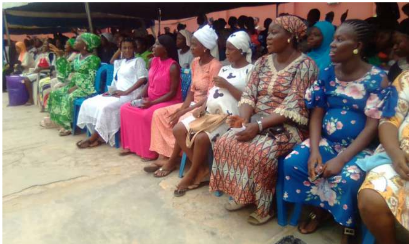
Pregnant women at the ICH sensitization programme

The General Manager lamented that brain drain is also affecting private hospitals because doctors are in high demand everywhere in Nigeria and this is affecting the society but her hospital still manage to handle the situation.