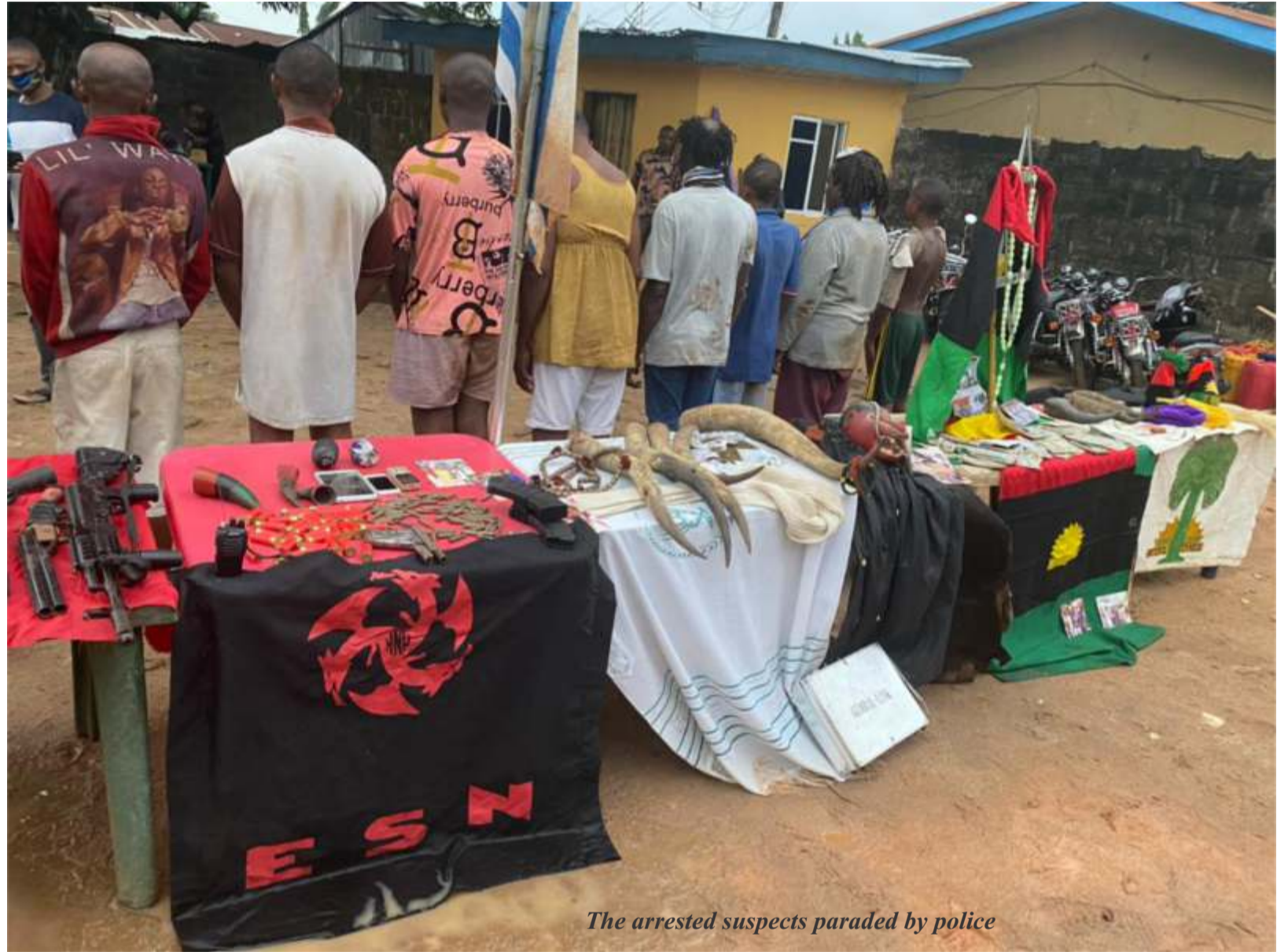
The arrested suspects paraded by police

It reads, "Sequel to the attack of Police Officers on patrol attached to Ngor-Okpala/Mbaise Area Command at Ngor-Okpala, Imo State on 21/04/2023 by hoodlums suspected to be members of the proscribed Indigenous People of Biafra (IPOB) and its militia affiliate, Eastern Security Network (ESN) where