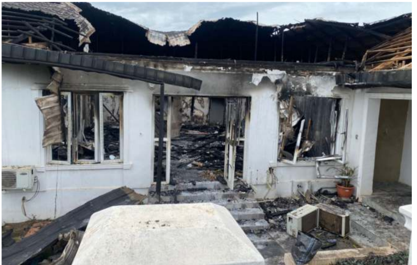
Building affected by inferno

"No casualties, no injuries recorded, no cultural items lost, thanks to the Almighty Olodumare."