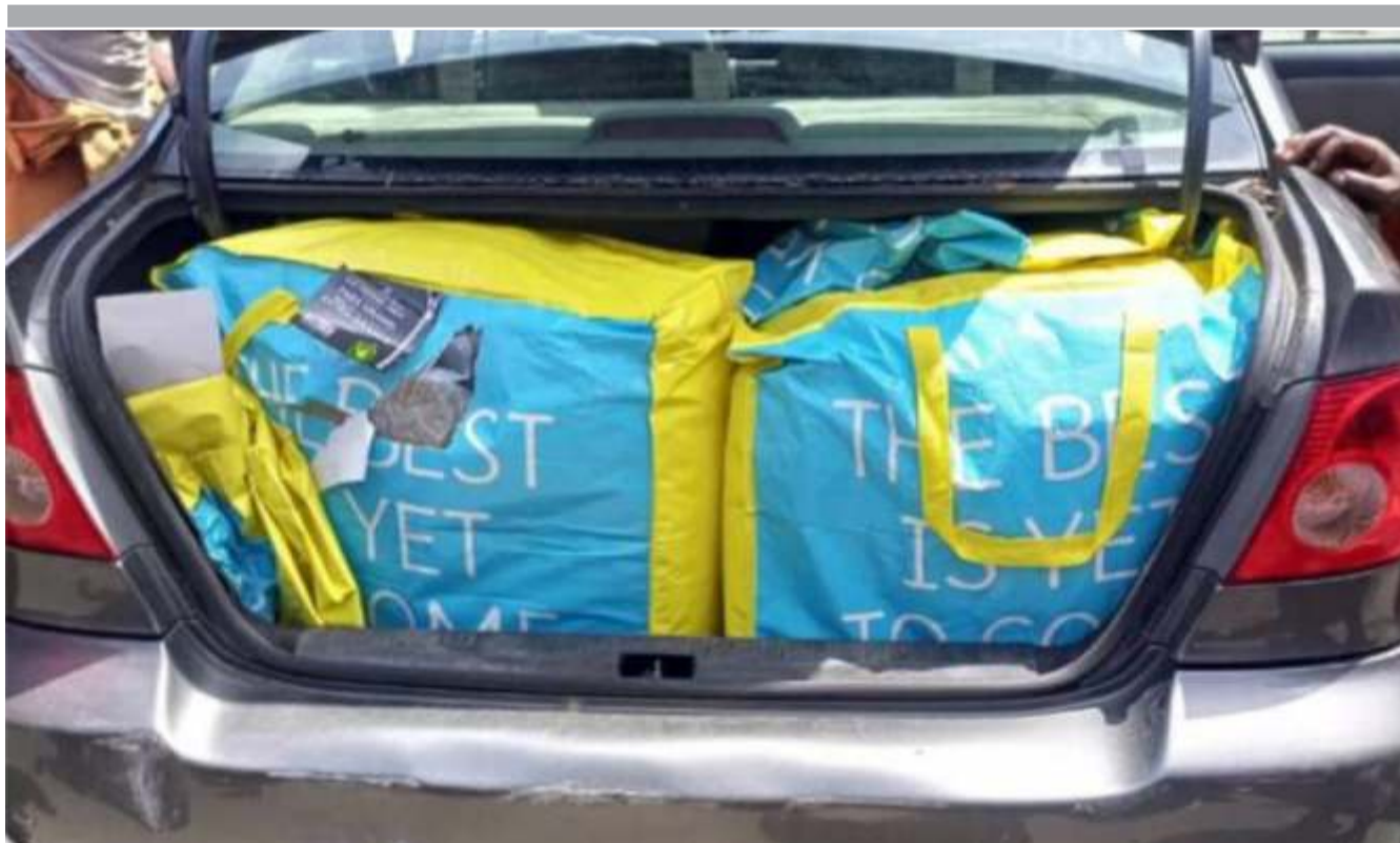
The drug hidden in the imported car

■ Says Nigerians can't endure another 4 years of Executive - Legislative connivance against citizens