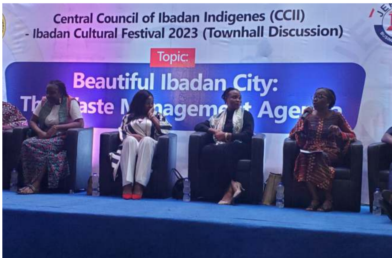
Stakeholders at the meeting