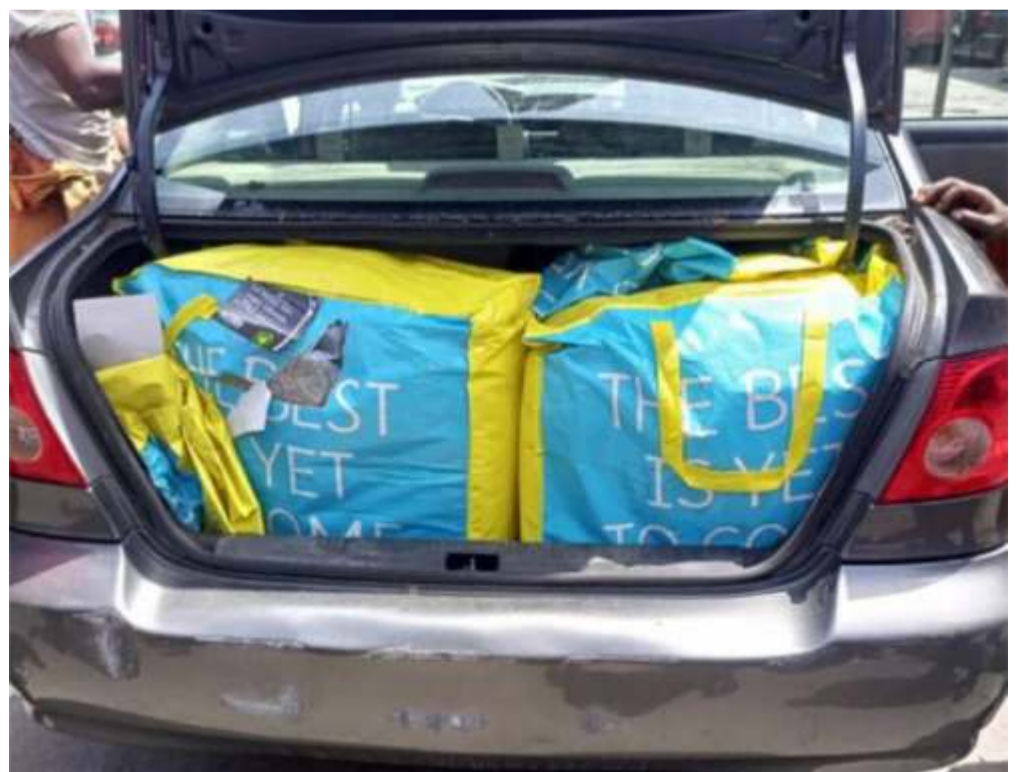
The drug hidden in the imported car

"He charged them and their colleagues across the country not to rest on their oars";