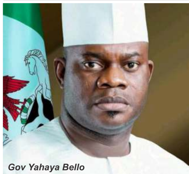
Gov Yahaya Bello