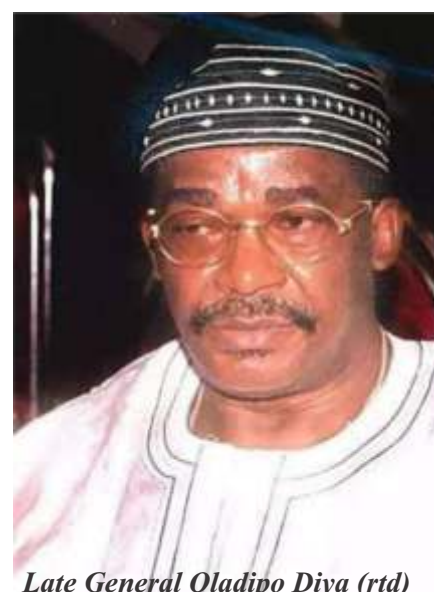
Late General Oladipo Diya (rtd)

"Our dear Daddy passed onto glory in the early hours of 26th March 2023. Please keep us in your prayers as we mourn his demise in this period. Further announcements will be made public in due course."