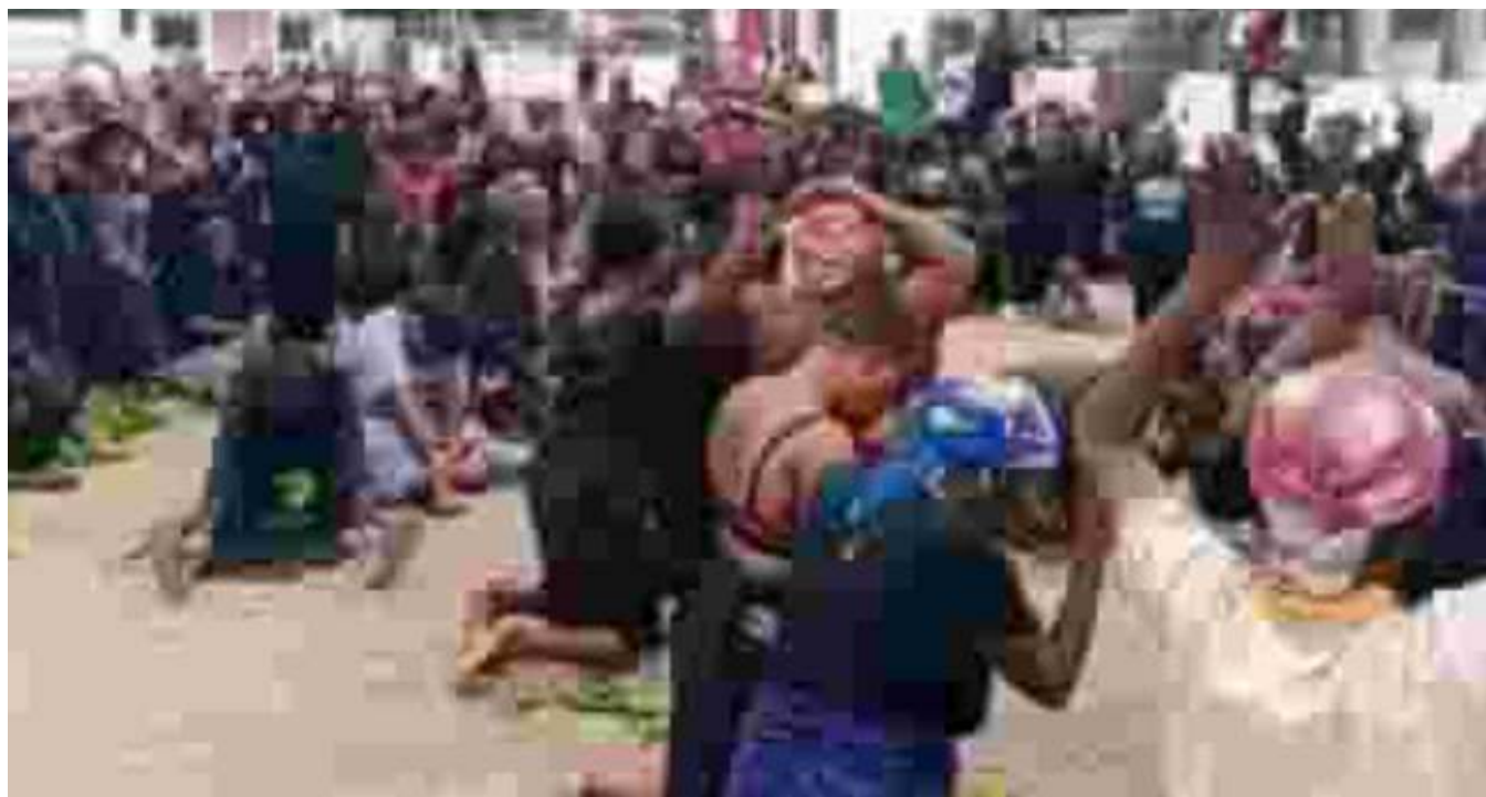
Nasarawa women protesting alleged rigging of gubernatorial polls.

During the process, the media and PDP agents were sent out of the collation centre to give them free hands of operation.