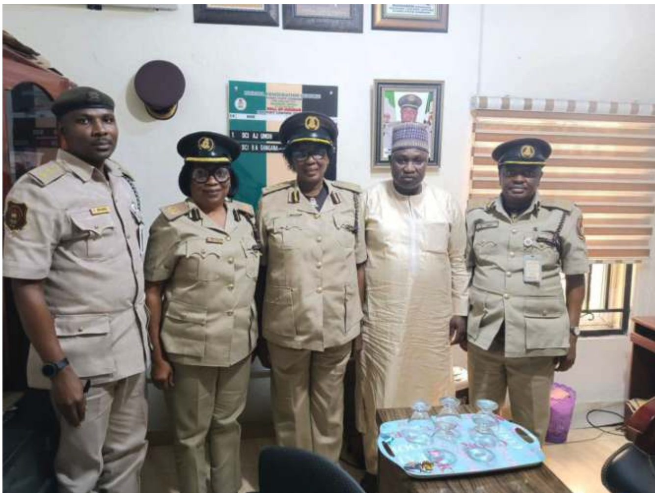
Members of the committee