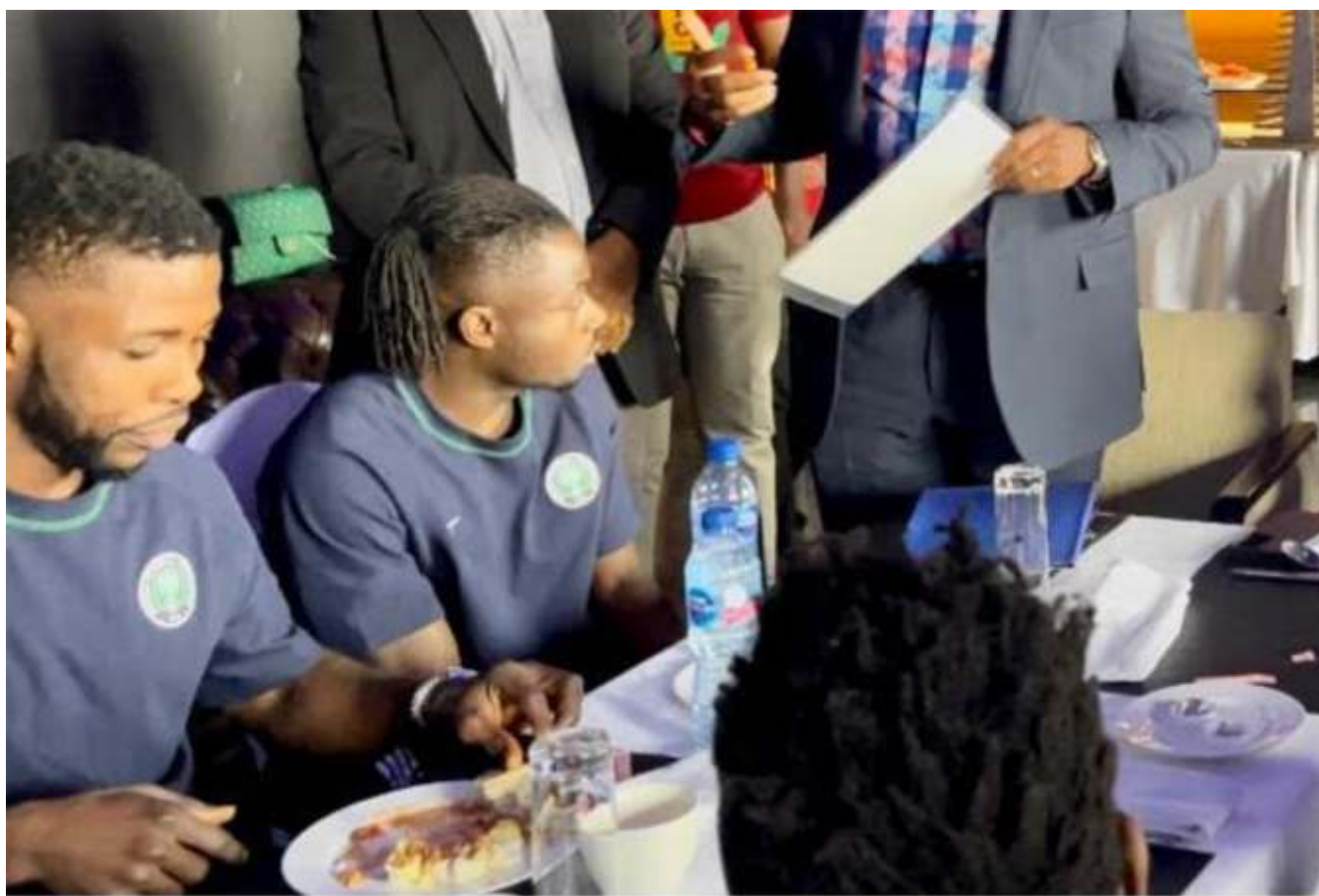
Super Eagles' players cooling off after their match with Guinea Bisau

"The Federation regrets any inconvenience the postponement may have caused," it said.