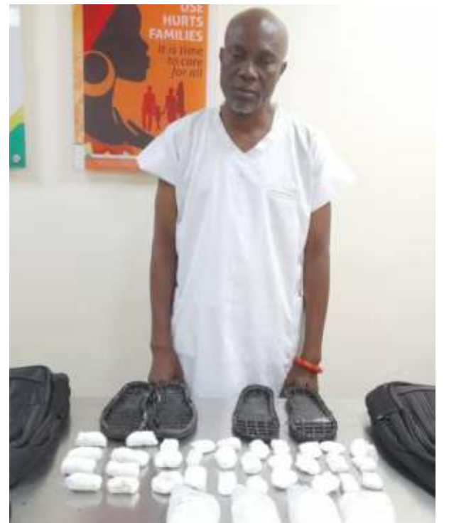
Pic of the Asia Bound Businessman and the suspected drugs recovered from him