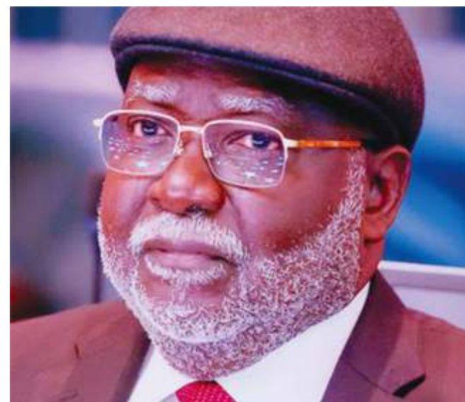
Justice Kayode Ariwoola

He tasked Nigerians not to be hoodwinked by politicians to paint the judiciary in bad color, so as to achieve their personal interests, as far as the 2023 election is concerned"