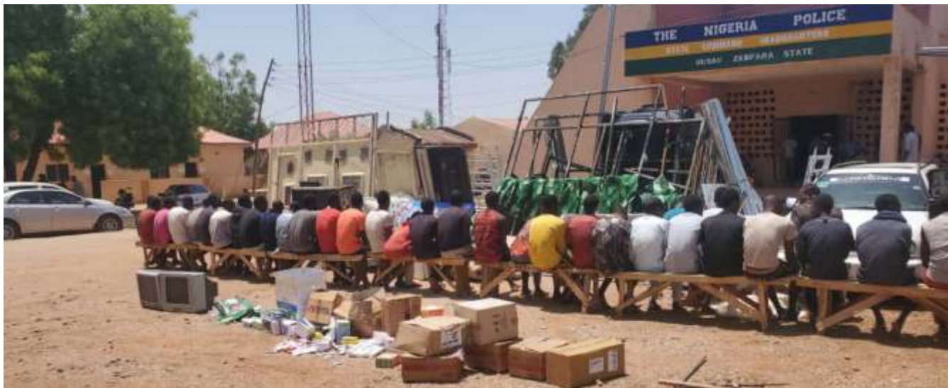
The suspects and some recovered exhibits

"The Commissioner of Police while appealing for calm, reassures for diligent investigation with a view to arresting fleeing suspects and their collaborators for prosecution as well as recover the looted property".