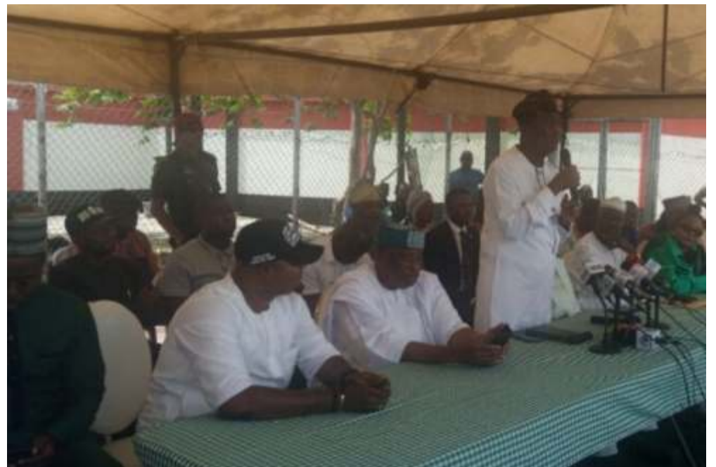
Picture from the meeting