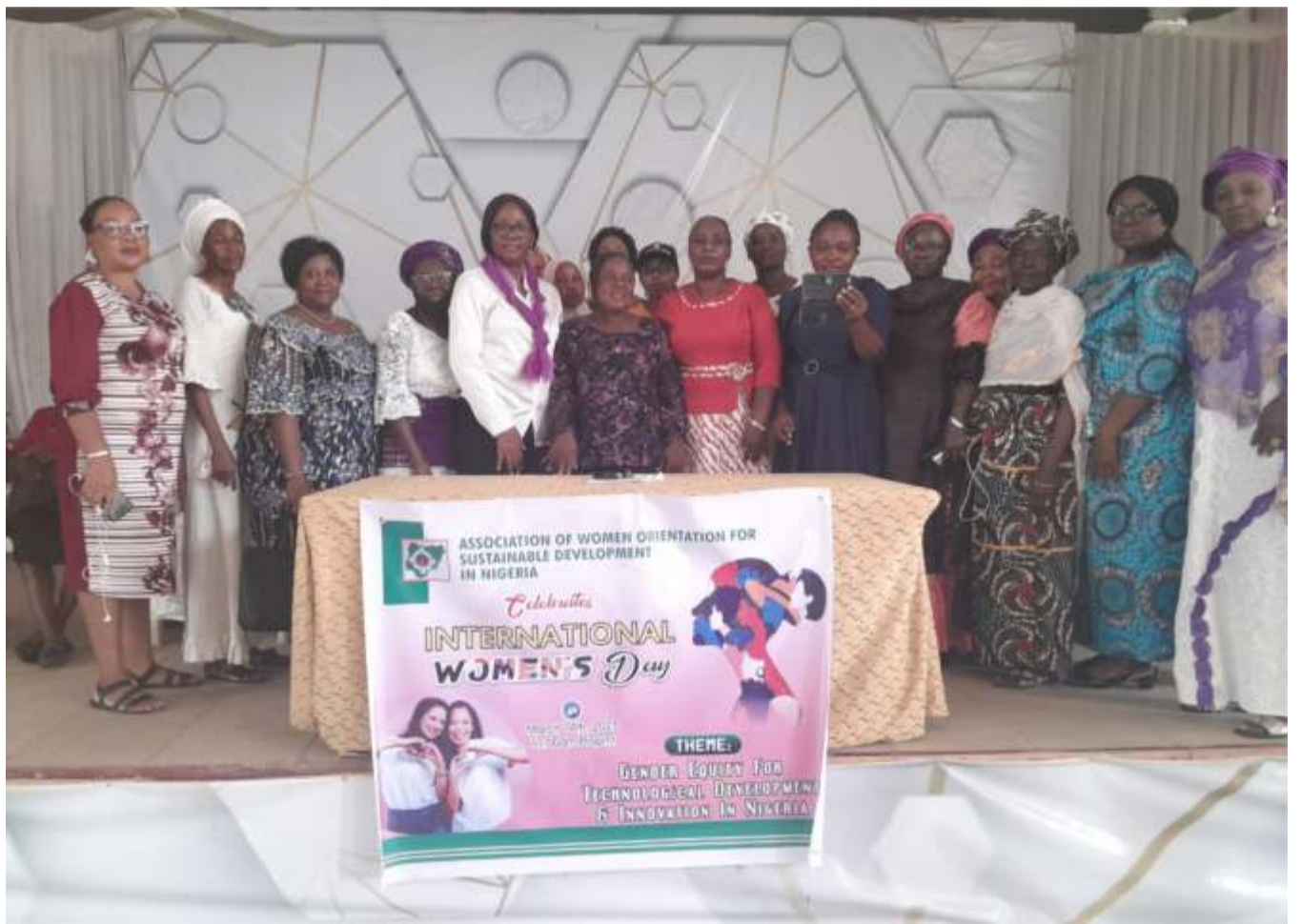
AWON members at the Press conference