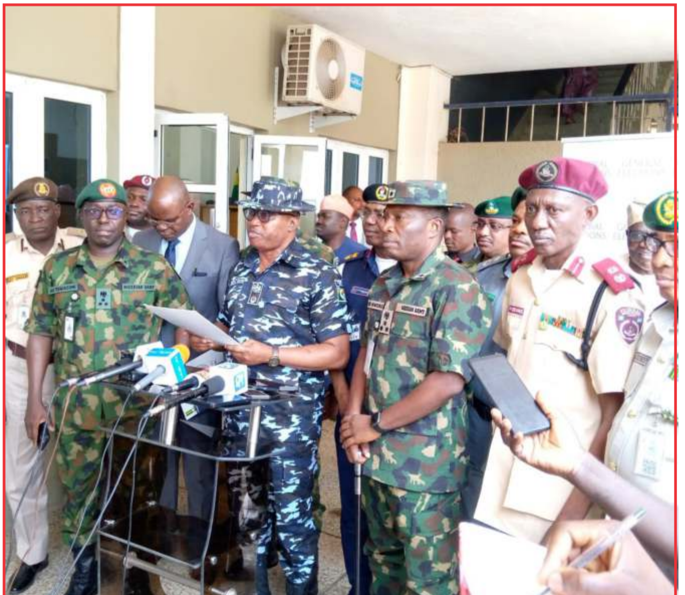
Oyo State Commissioner of Police, CP Adebowale Williams reading Joint Security agencies communiqué ahead of Saturday's gubernatorial election, yesterday in Ibadan.

2023 Guber Polls: Southern Kaduna Labour Party Members Vow To Support PDP Gubernatorial Candidate Page 4