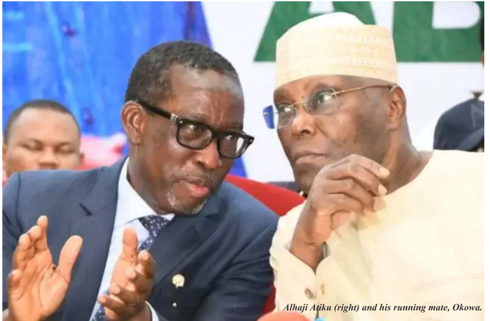
Alhaji Atiku (right) and his running mate, Okowa.

It was also for this reason that I sacrificed my political aspiration and fought against the actualisation of Third Term. Whether during the military or