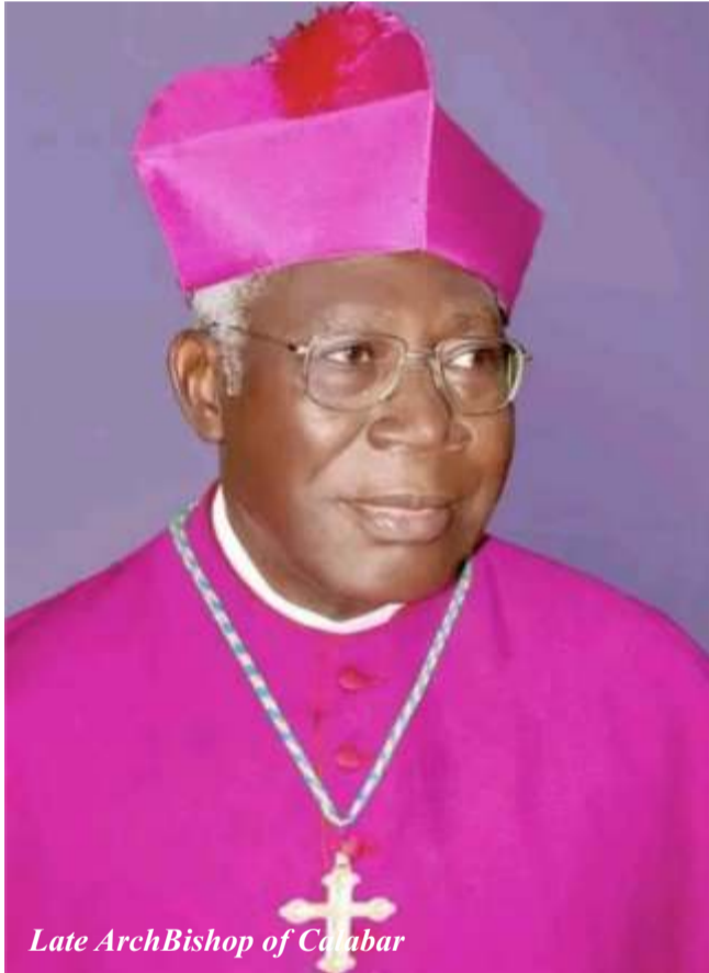
Late Archbishop of Calabar