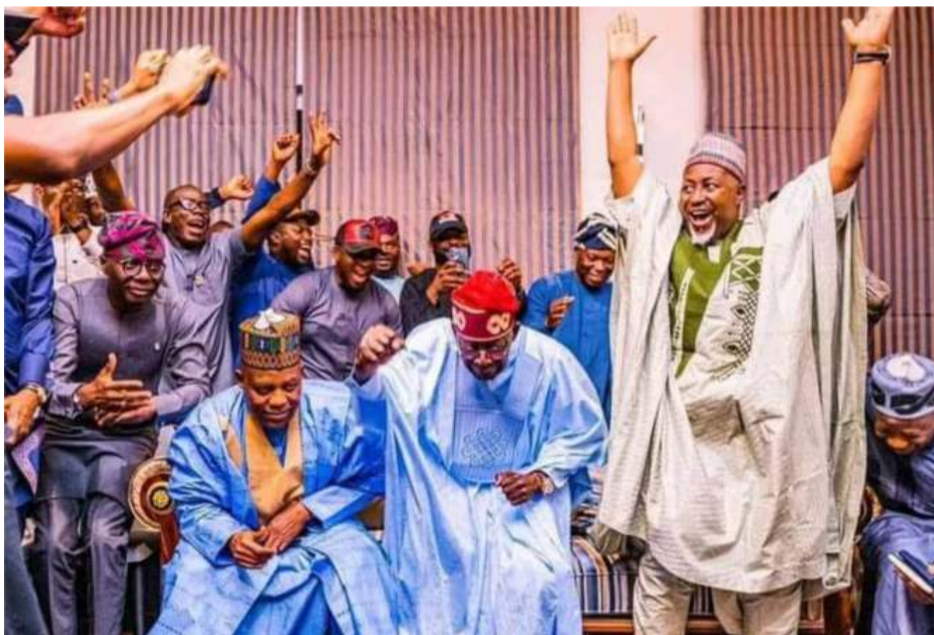
Gov. Badaru Celebrating Tinubu/Shettima victory alongside other APC governors

Mai Unguwa Jaga called on the people of Jigawa State to vote for Malam Umar Namadi Dan Modi as the state governor for the betterment of the people under the most formidable continuity.