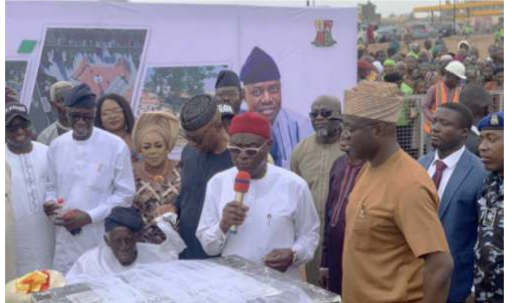
Gov Nyesom Wike commissioning a project in Ibadan on Friday

Governor Makinde declared that the commissioning of the Airport Road is part of his vision to turn the surrounding areas