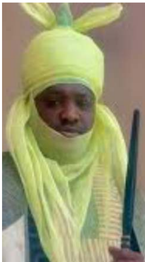
New Emir of Dutse