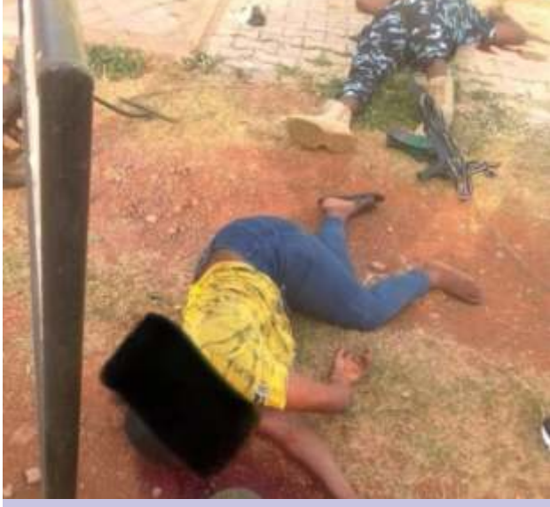
Remains of the late girlfriend in a pool of blood, allegedly killed by her cop boyfriend

hi *Says outcome shows Nigerians no longer interested in politics of ethnicity, religion Story on Page 2