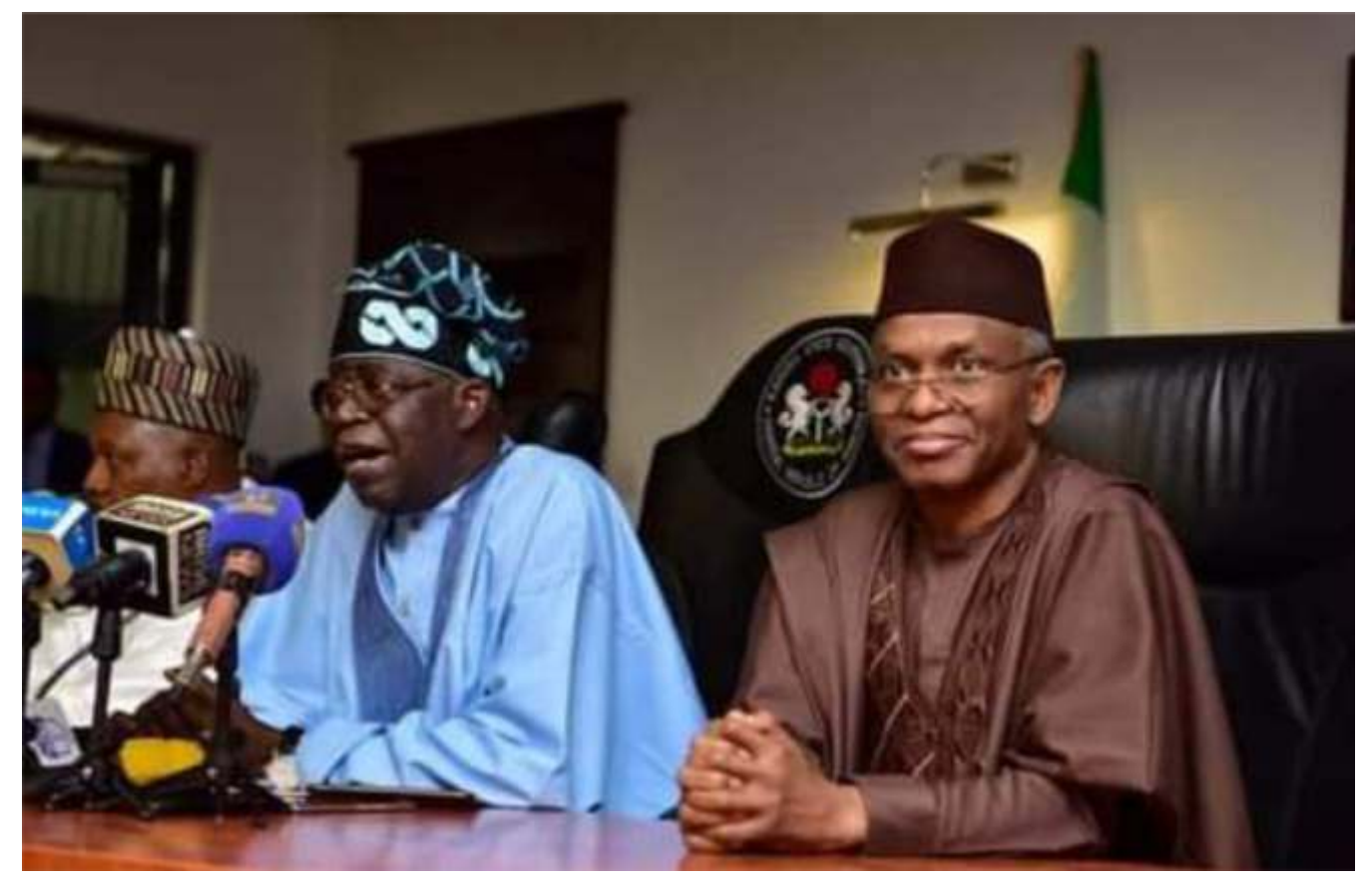
President-elect Tinubu and Gov El-Rufai

Recall the Independent National Electoral Commission, INEC, early Wednesday declared Asiwaju Bola Ahmed Tinubu winner of the February 25 Presidential/ National Assembly polls having pulled a total of 8,794,726 votes on top of his major contenders in APC who scored 6,784,520; LB - 6,101,533 and NNPP - 1,496,687 to come second, third and fourth respectively.