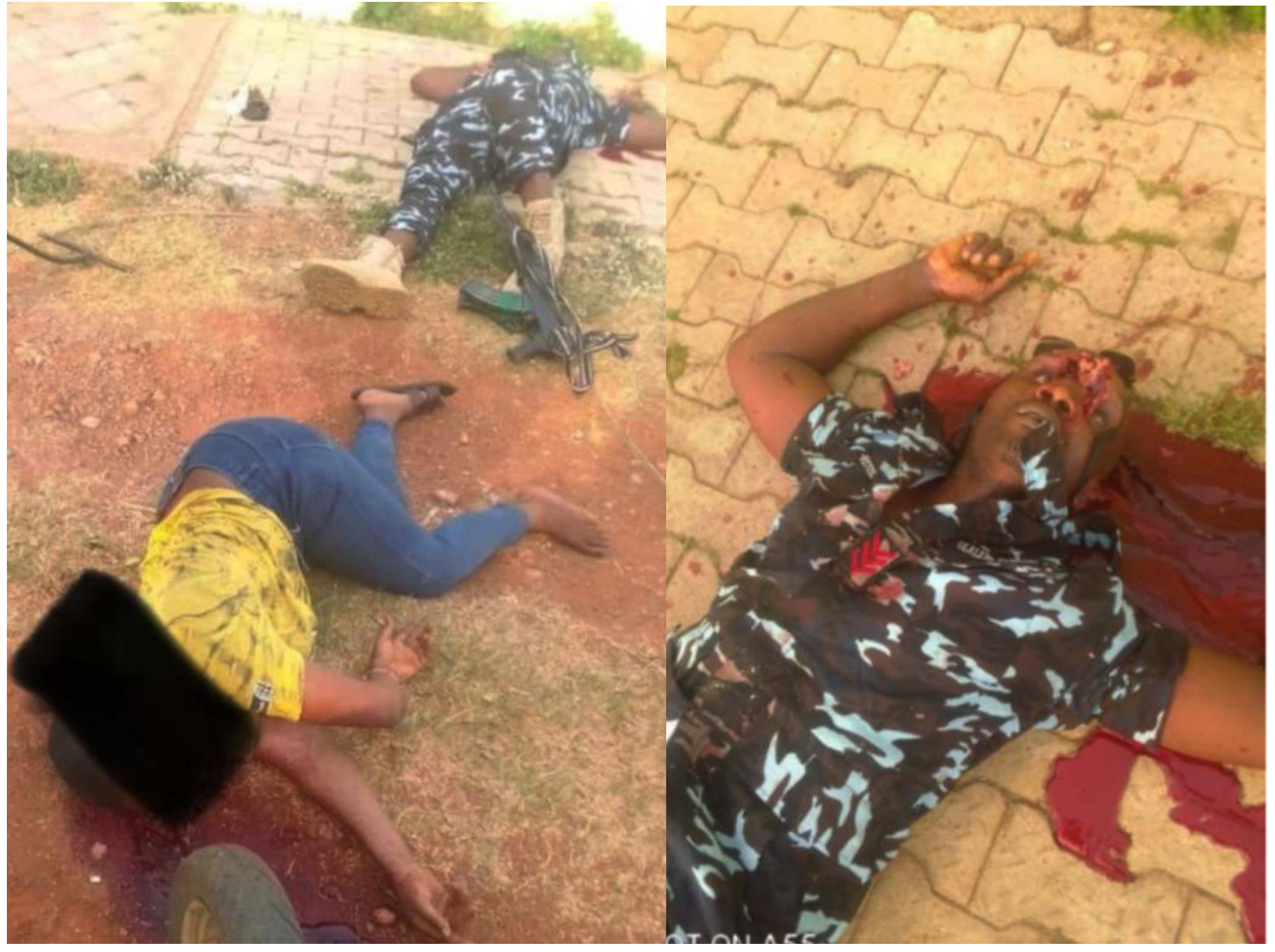
Remains of the late girlfriend in a pool of blood, allegedly killed by her cop boyfriend

"Meanwhile, investigation of this unfortunate incident is in progress, and the report of the investigation will be made public as soon as it is ready".