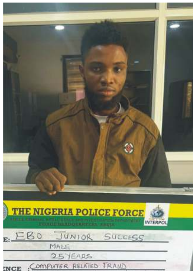
One of the suspects

"Suspects will be charged to court upon conclusion of investigations", the Force spokesperson added.