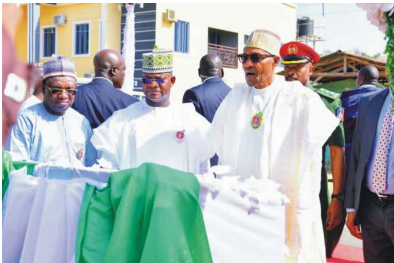
President Buhari launching a project in Kogi State with him Gov Yahaya Bello.