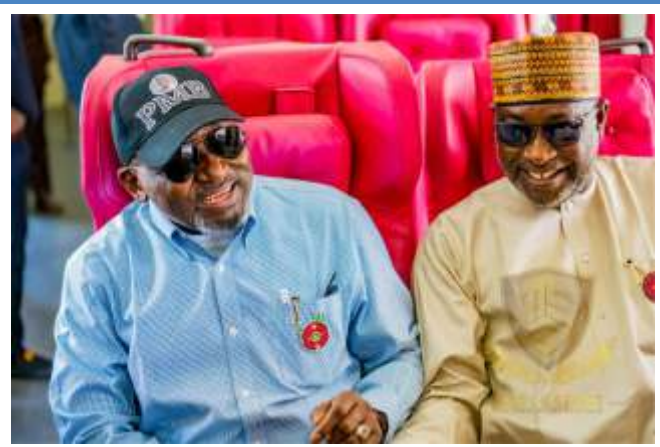
The Minister of Transportation Mu'azu Sambo (wearing faze cap) and the Minister of Water Resources Suleiman Adamu on a ride.

Story on Page 8 New Security Features On Abuja-Kaduna Train Guarantees Safety Of Passengers - Minister Story on Page 5