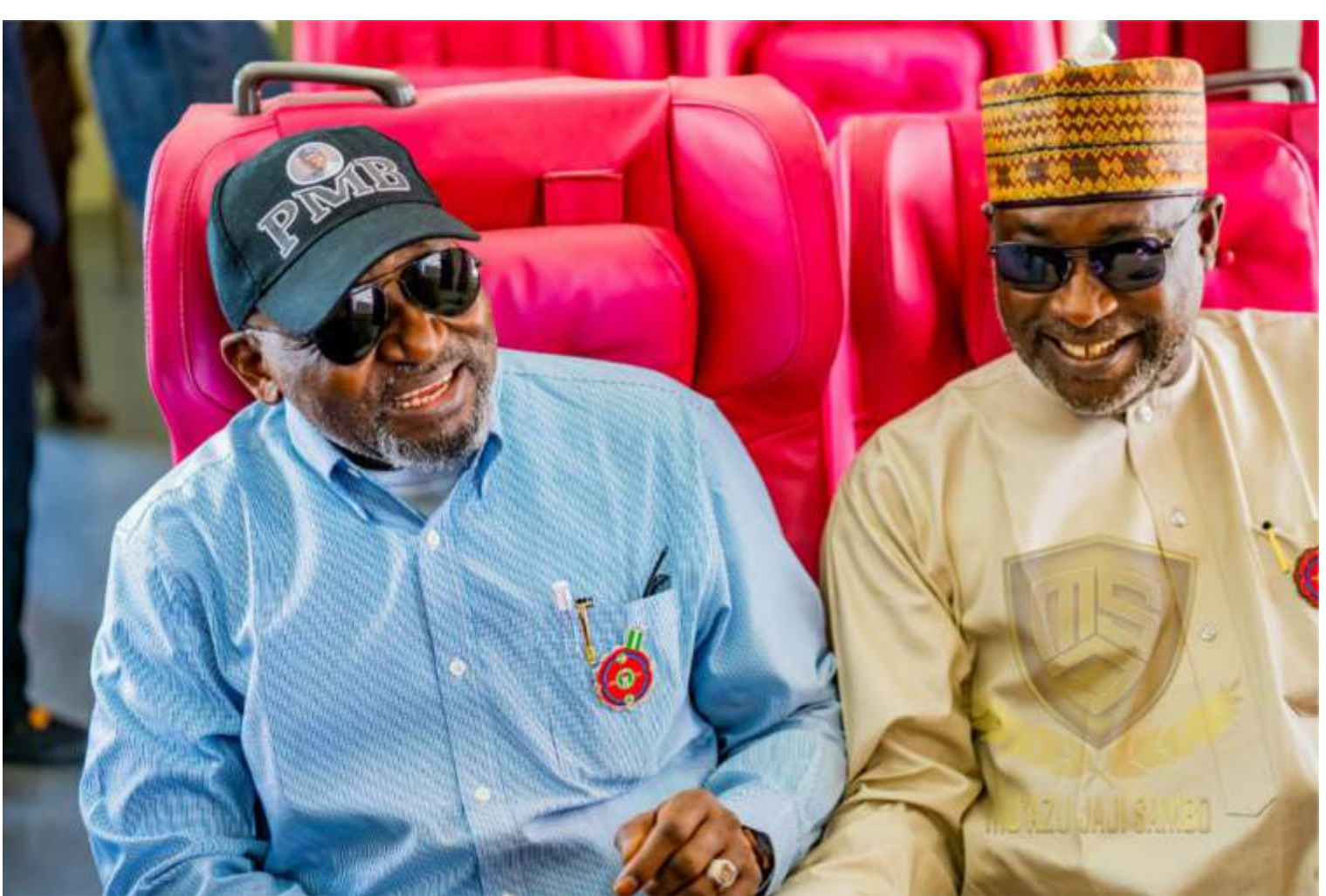
The Minister of Transports wearing faze cap and the Minister of Water Resources Suleiman Adamu on a ride.

"To the glory of God, we have achieved that. We will also be taking measures that will ensure that by the grace of God such an incident never happens again in Nigeria. "There are certain concrete measures that are visible for you to see and know that there are changes, for example, the ticketing and security status. Now you don't buy a ticket unless you have a valid phone number and the National Identity Number (NIN). "If you are a foreigner, you also have a means of identification you can use which is produced by the National Identity Management Commission (NIMC). Having secured your tickets, you will not gain access to the lounge until the barcode machine reads the barcode on your receipt.