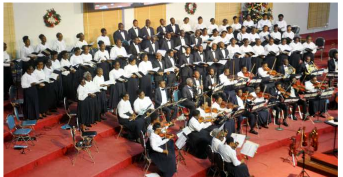
2022 Christmas Concert with the theme, "The Joyful News" presented by Apostolic Faith Church Choir and Orchestra held at the Campground Anthony, Lagos.