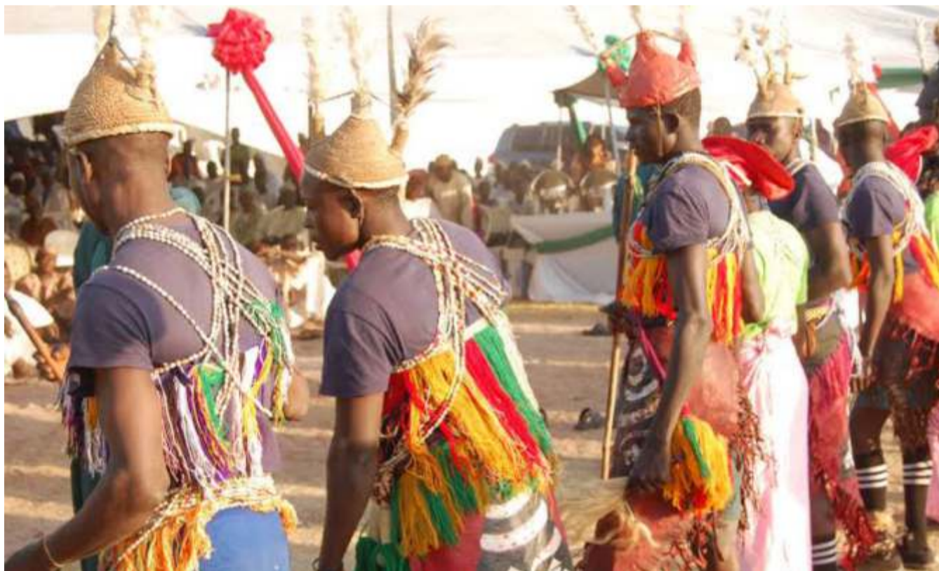
Tangale cultural dancers