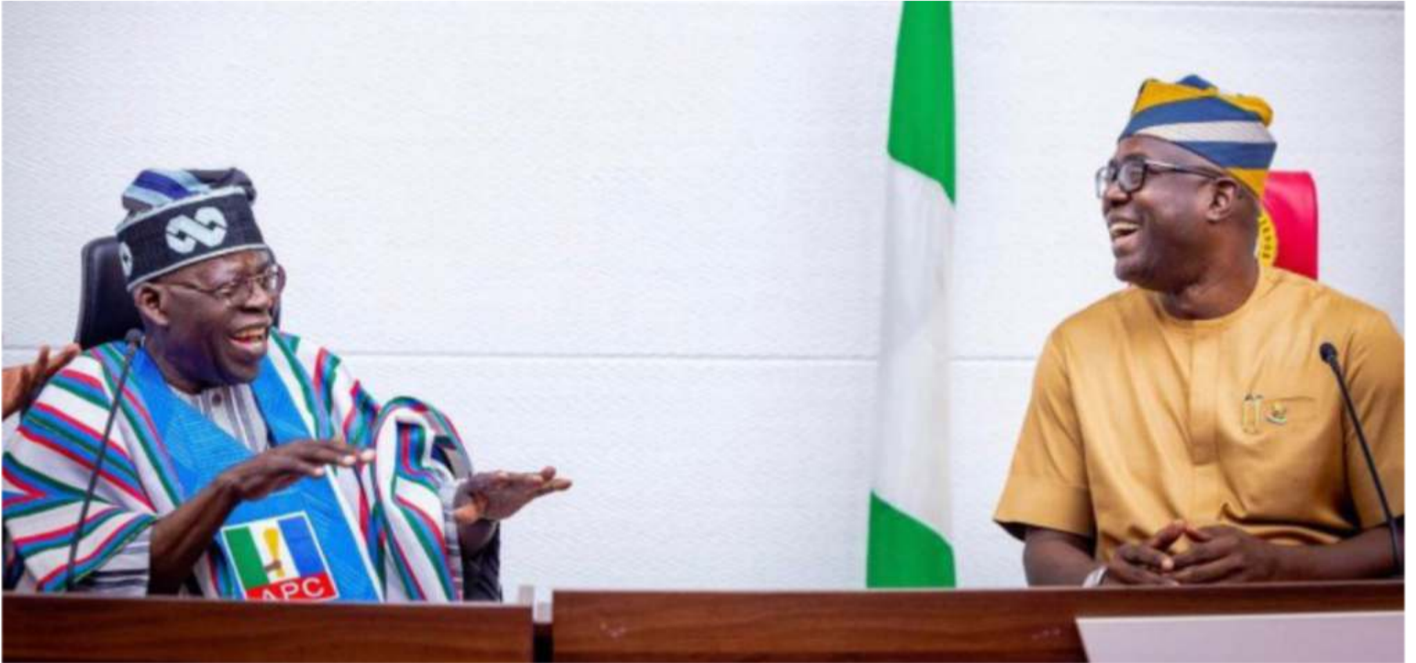
Asiwaju Bola Tinubu during his visit to Governor Seyi Makinde in Ibadan last Thursday