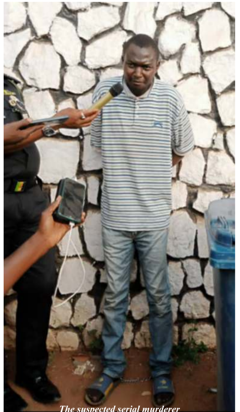
The suspected serial murderer

"He also confessed to the killing of one unknown lady buried inside the same general hospital store.