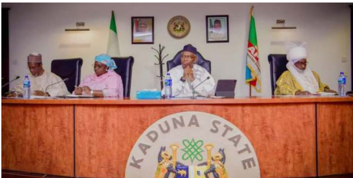
Gov el-Rufai at the security meeting with other officials.