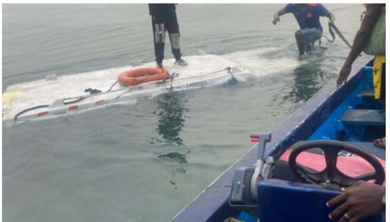
Pic during rescue operation