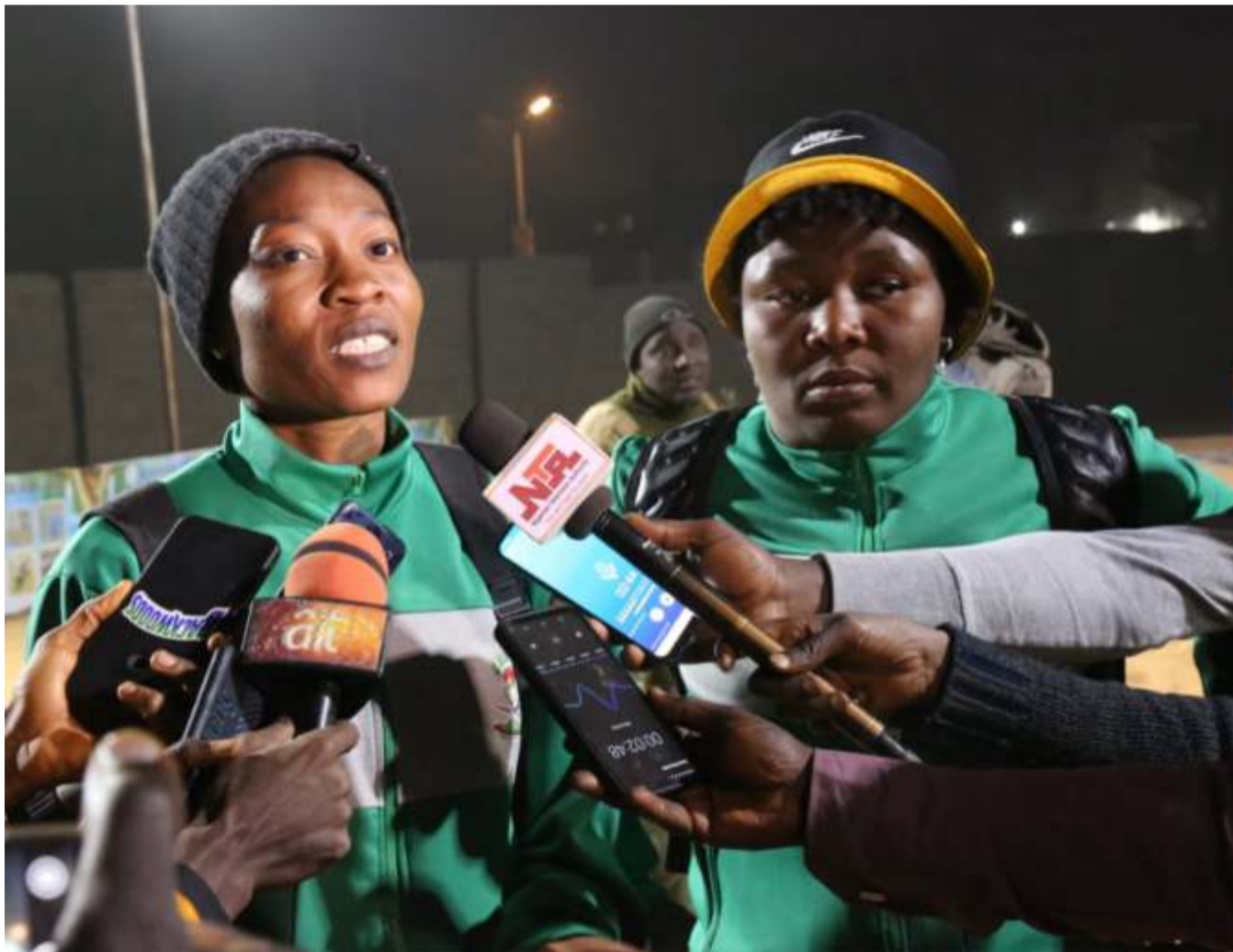
Female Customs players fielding questions from newsmen.

He however, sought the support of all members and other stakeholders in moving athletics in the state to reclaim its glory.