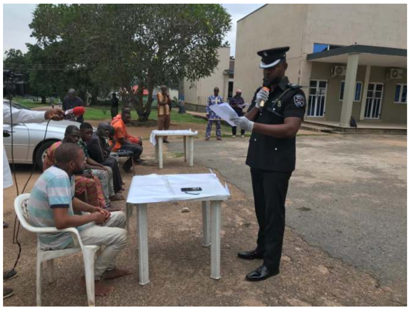
The suspects including a man alleged of killing his 73 years old creditor, were paraded by the Oyo State olice Command.

Governor AbdulRazaq prays Allah to grant His Royal Majesty more peaceful reign in good health.