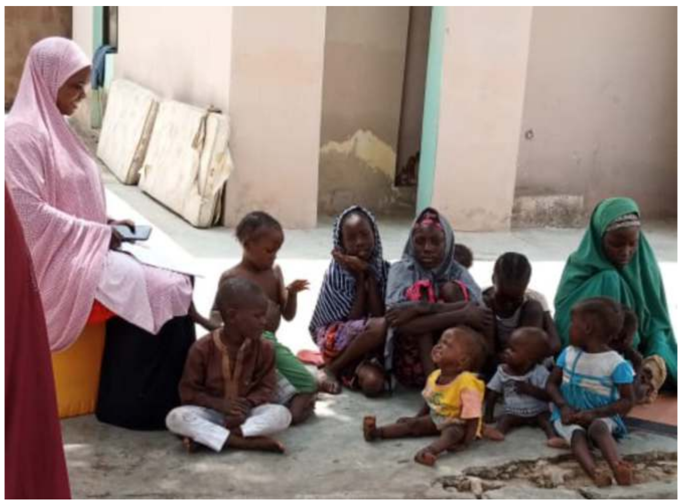
Some of the orphans