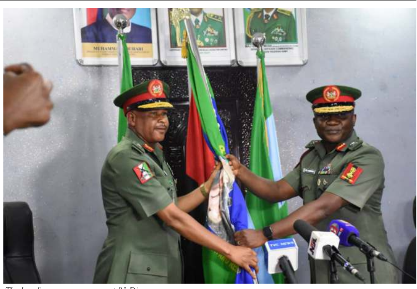
The handing over ceremony at 81 Div