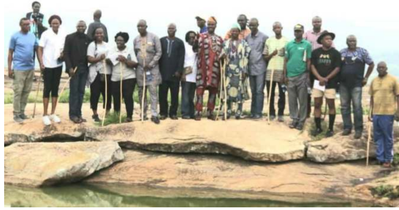
The Oyo state government team at the Ado Awaye Suspended Lake

Chief Bola Bambi called on the government to kindly see to the challenges bedeviling the community such as lack of good roads and electricity.