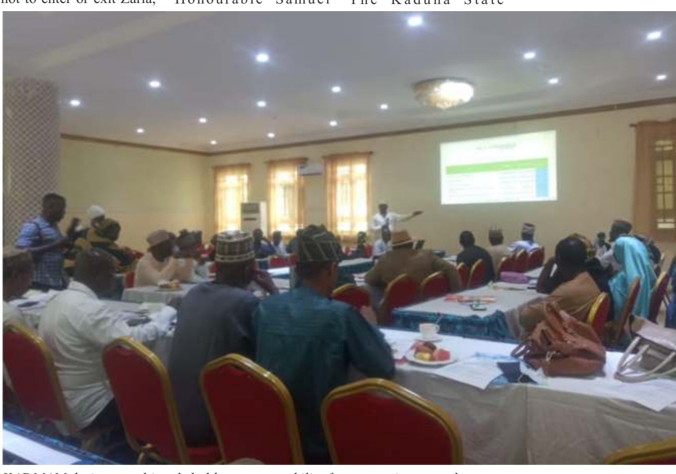
KADMAM during a multi-stakeholders accountability forum meeting recently

"Residents are urged to go about their normal activities and pay no attention to the report," it assured.