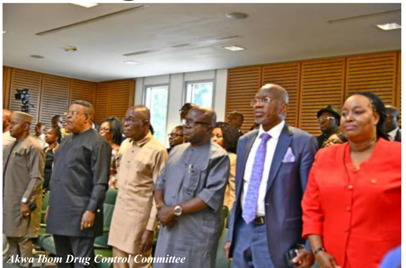
Akwa Ibom Drug Control Committee