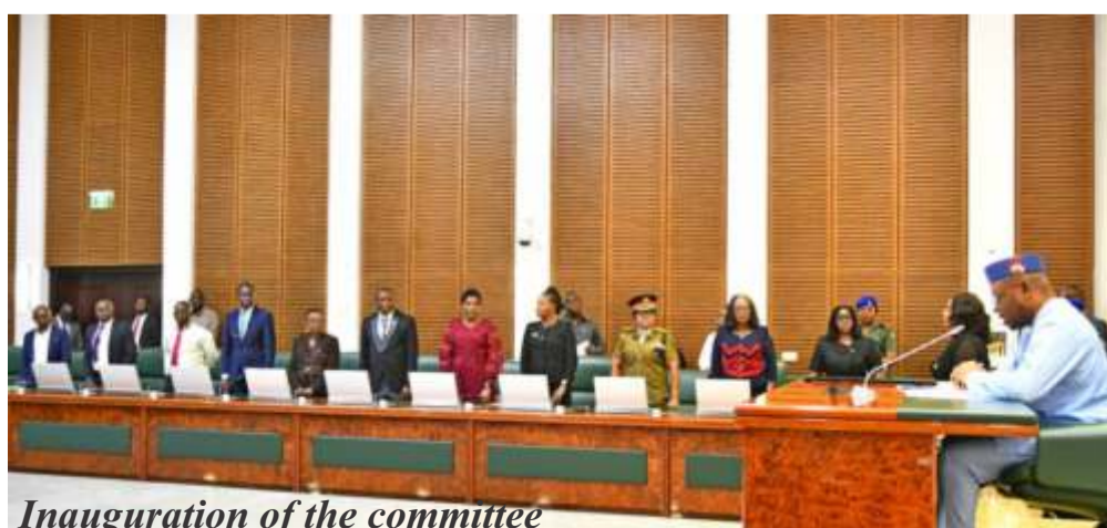
Inauguration of the committee

spare anybody because the day your child falls into that thing you are finished and all your suffering on that child is gone. No child on drugs can be useful to a parent.