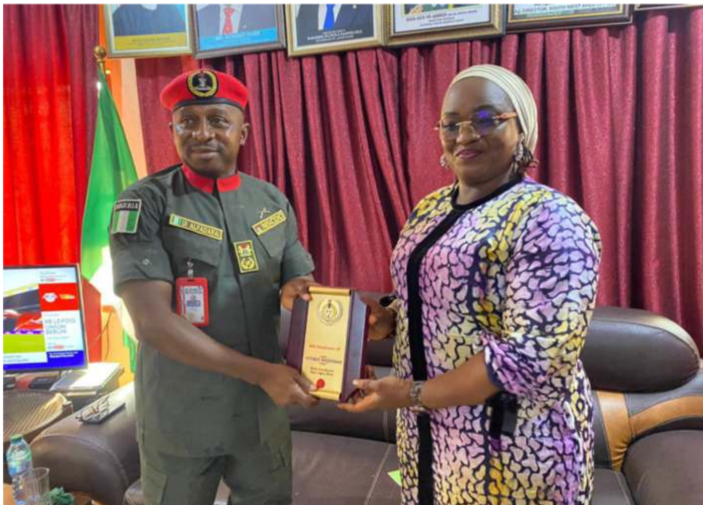
The NSCDC Commandant being presented a plaque by the NYSC State Coordinator