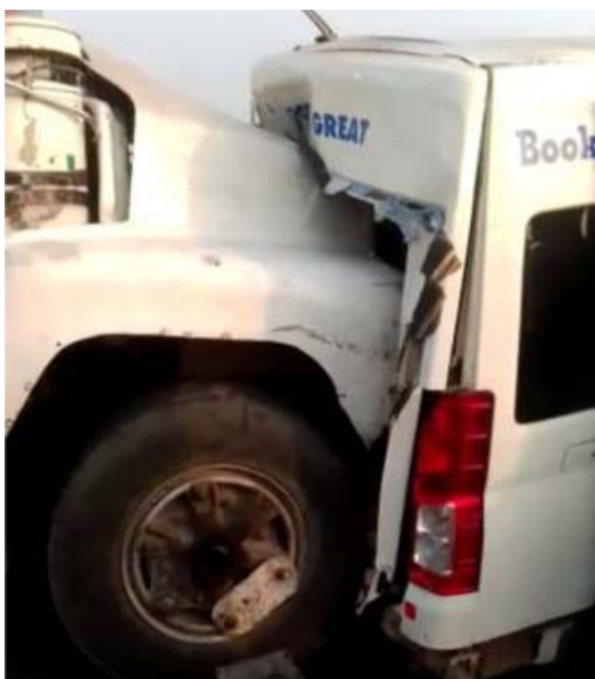
One of the vehicles involved in the accident

"He disclosed that emergency responders at the scene of the accident include the Nigerian Police, Trace Officials and Federal Road Safety Commission (FRSC)", the LASTMA spokesperson stated.