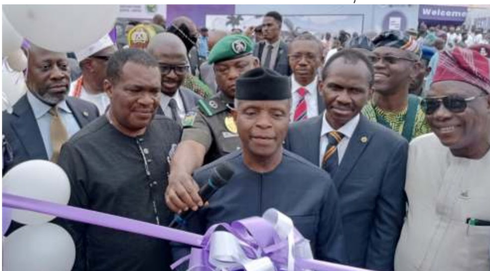
Vice- President Yemi Osinbajo at the commissioning in Ibadan

*Commissions Phase 1 Westlink Iconic Villa, Alakia in Ibadan