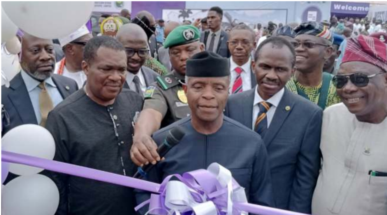
Vice- President Yemi Osinbajo at the commissioning in Ibadan

*Commissions Phase 1 Westlink Iconic Villa, Alakia in Ibadan