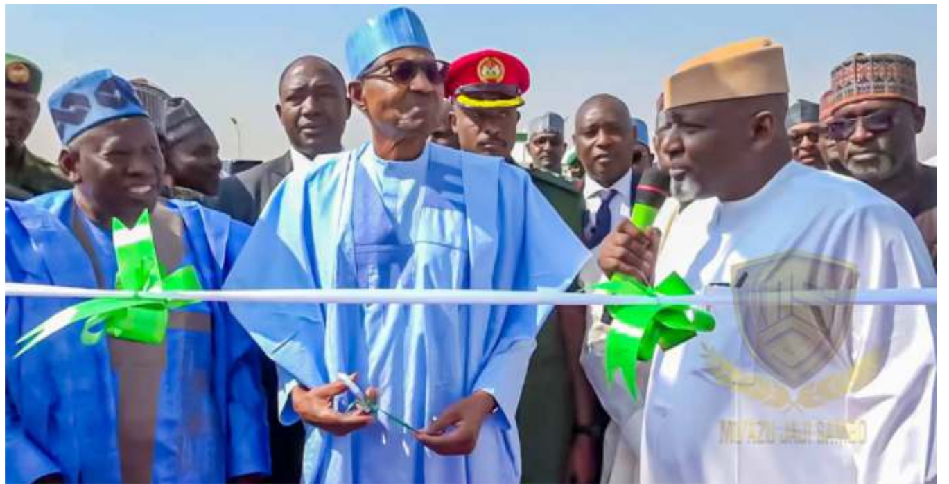
President Muhammadu Buhari flanked by Governor Ganduje of Kano State (left) and Minister of Transportation, Muazu Sambo.