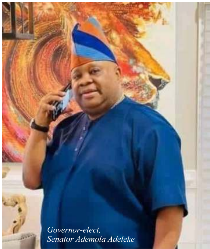
Governor-elect, Senator Ademola Adeleke