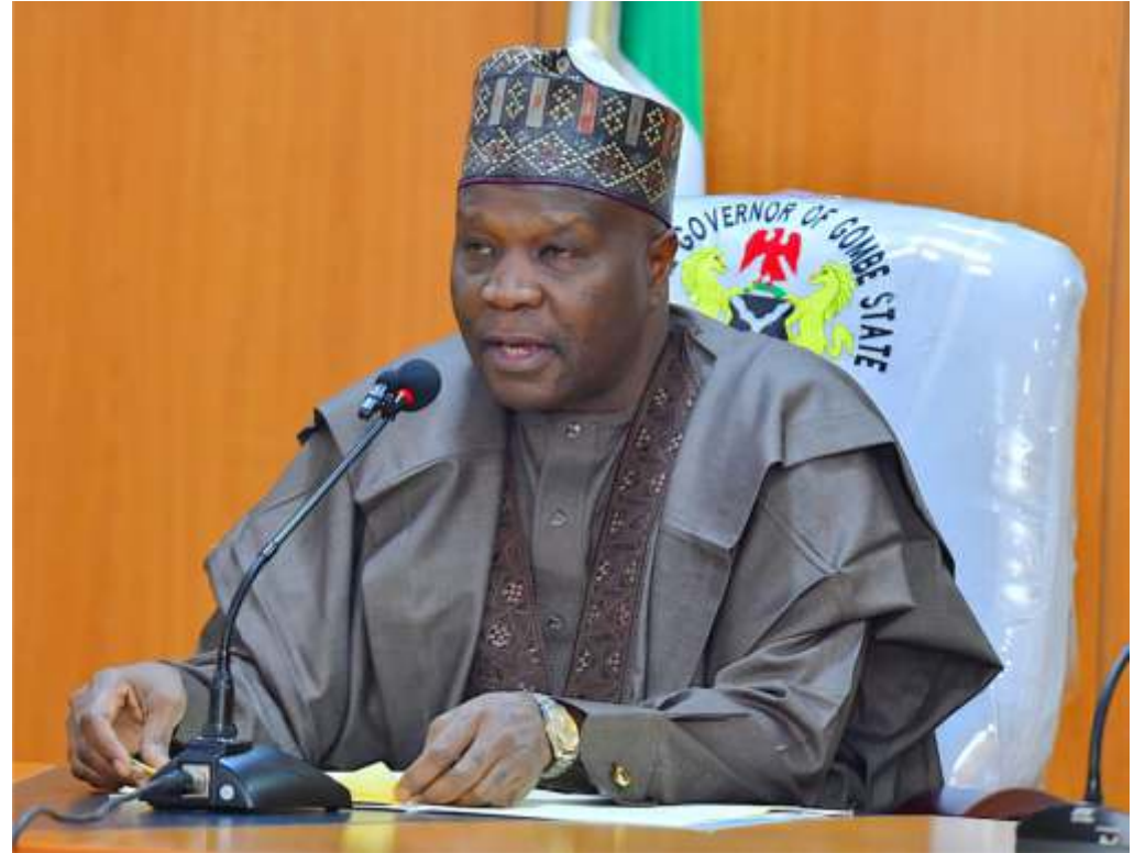
Gov Inuwa Yahaya

8. The above reforms and projects have earned us national and international recognition. Only recently, our state was