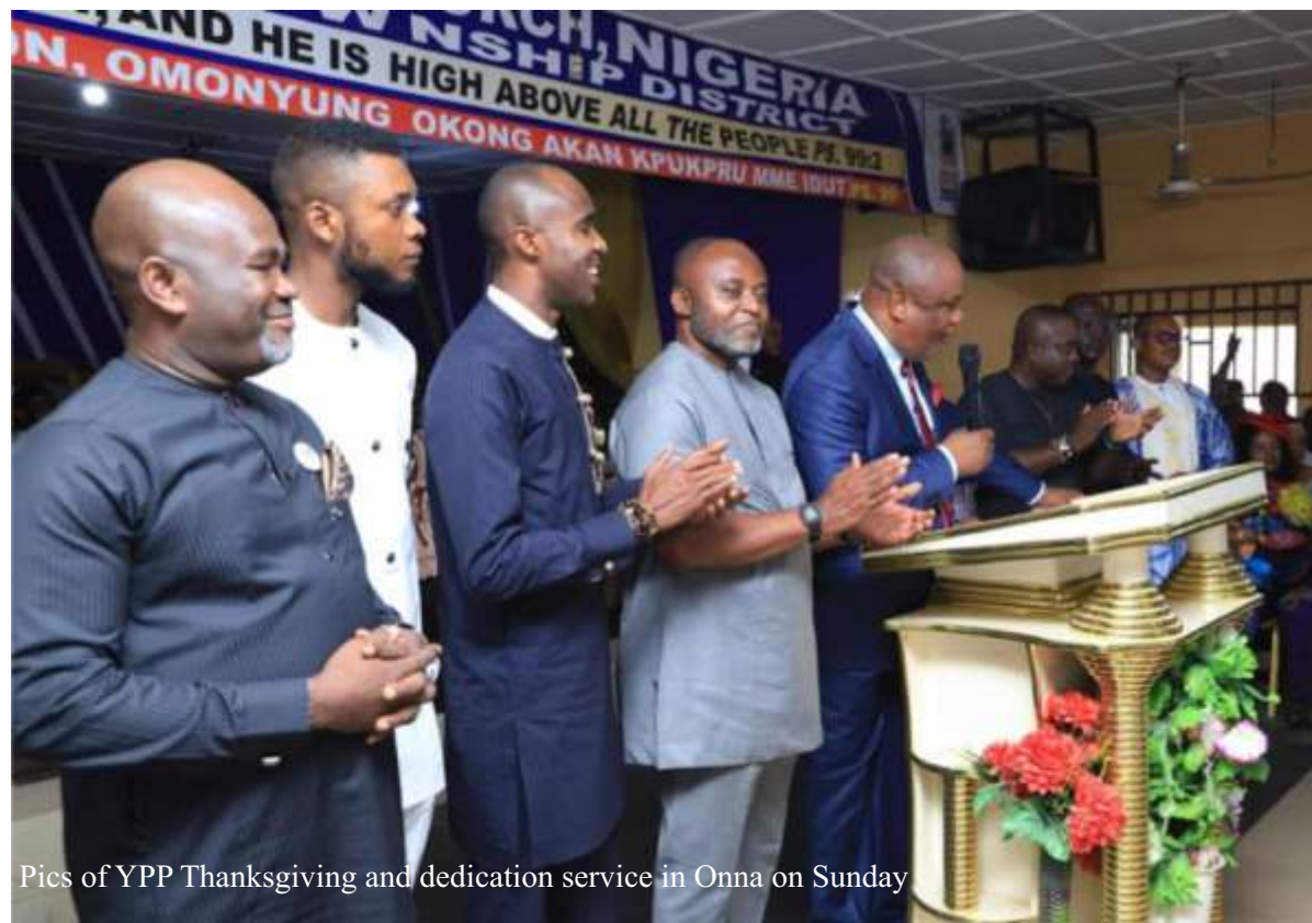
Pics of YPP Thanksgiving and dedication service in Onna on Sunday

While dedicating the National Assembly campaigns, Prophet David Udo Udo, reading from Lev 26:36, prayed God to use "the sound of a shaken leaf" to change many Akwa Ibom voters in favour of the Young Progressives Party (YPP).