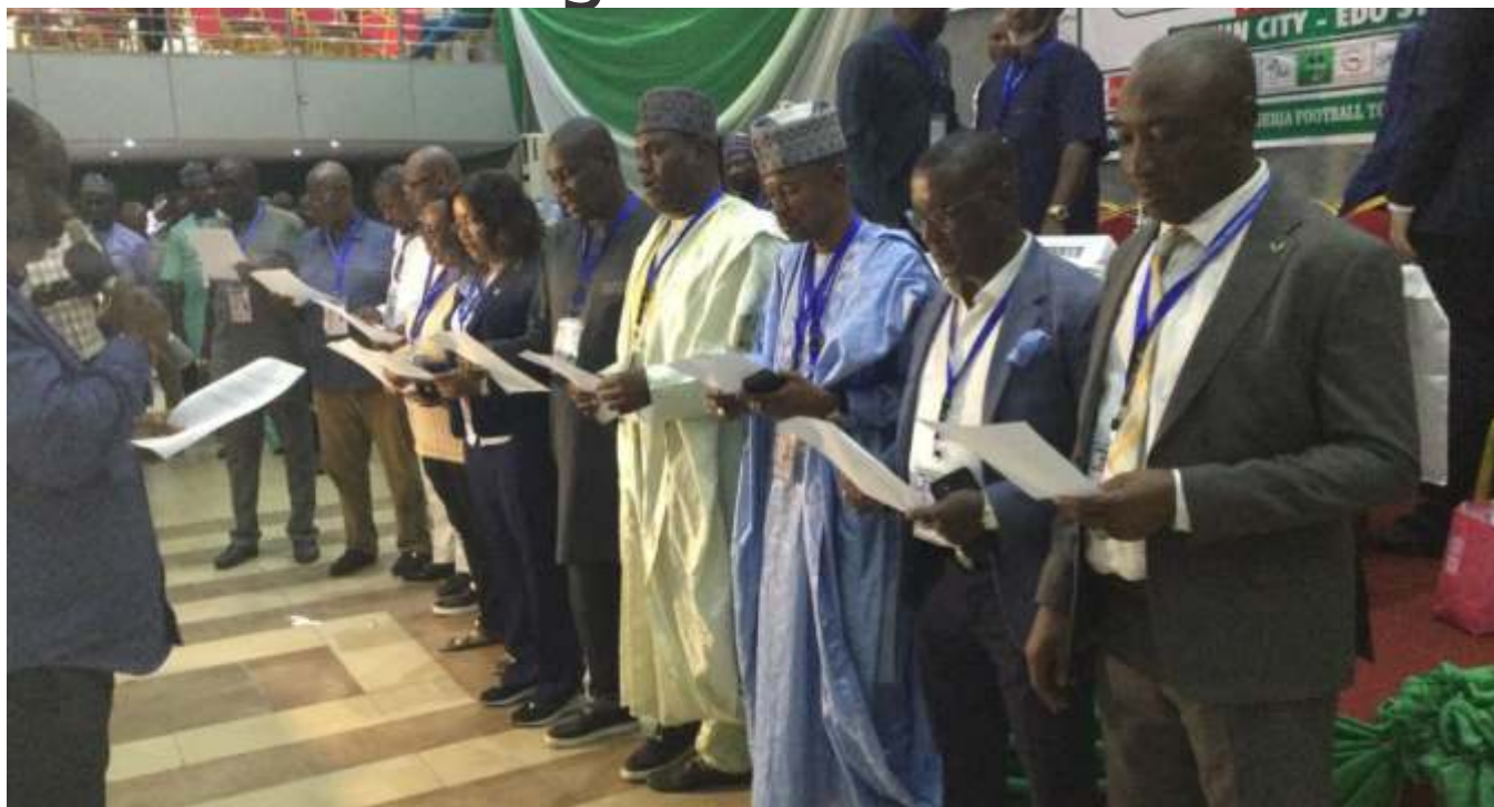
Members of the NFF Executive Committee (2022-2026) take their oath of office in Benin City on Friday night.