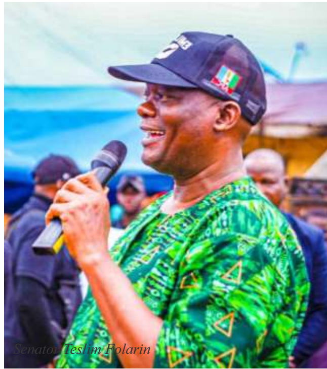
Senator Teslim Folarin

According to Senator Folarin "Nigeria will attain legendary status and global recognition in