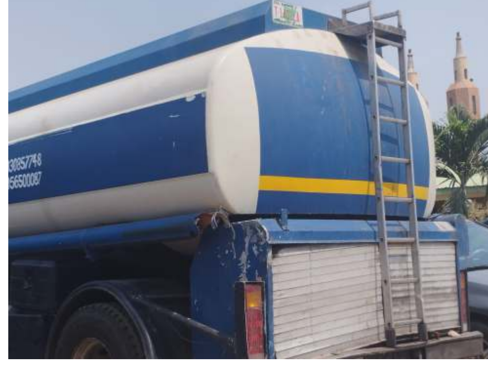
The tanker nabbed with illegal Diesel