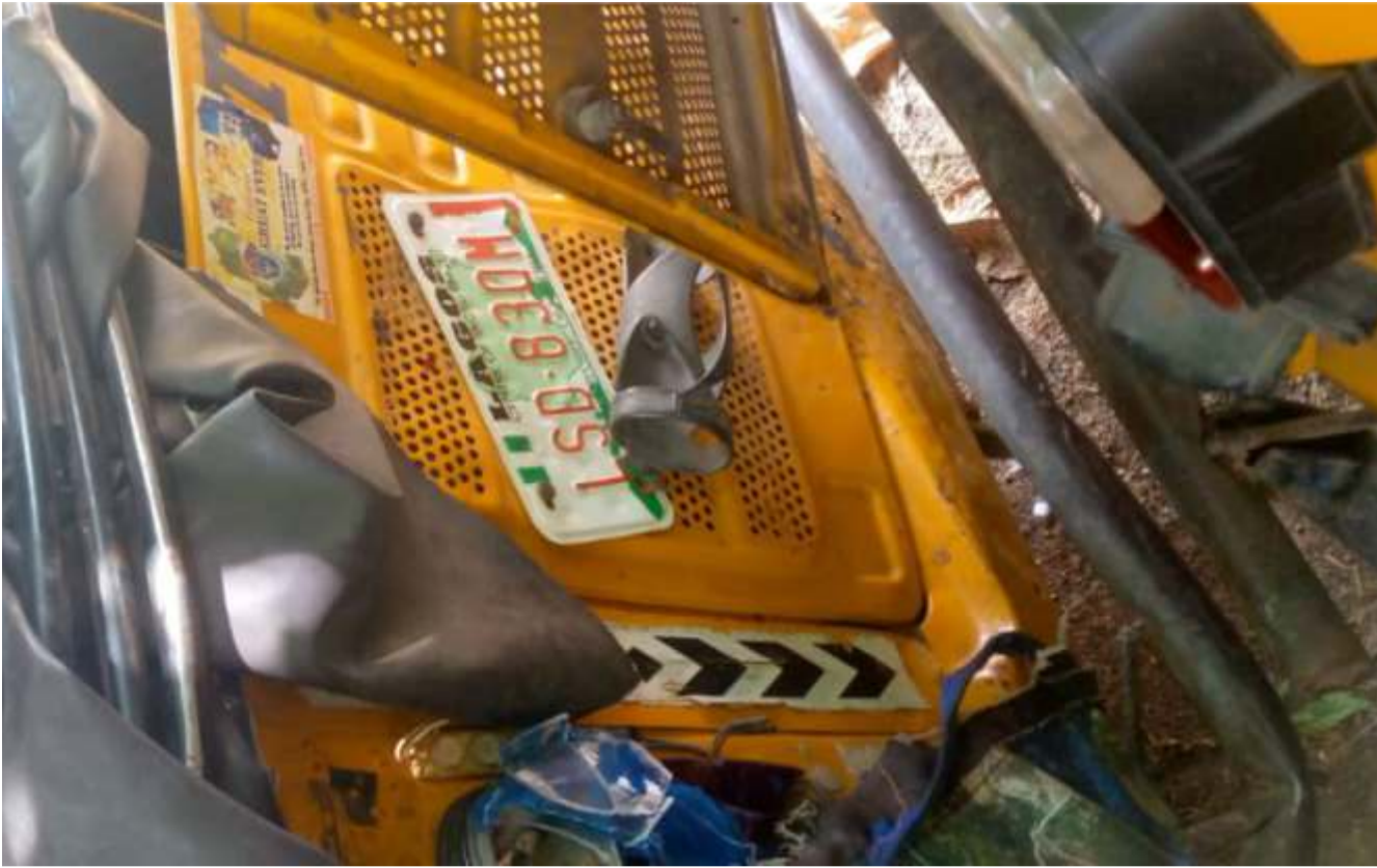
Tricycle which driver and a passenger died.