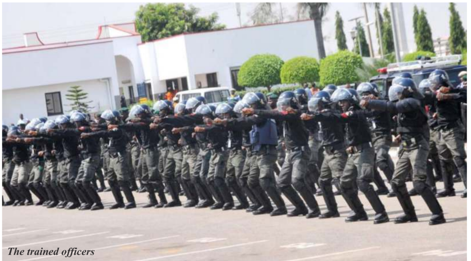
The trained officers

According to the Force image maker, the training workshop which held between Saturday 7th January and Wednesday 18th January, 2023, probed historical antecedents as well as contemporary issues and solutions to the challenges of