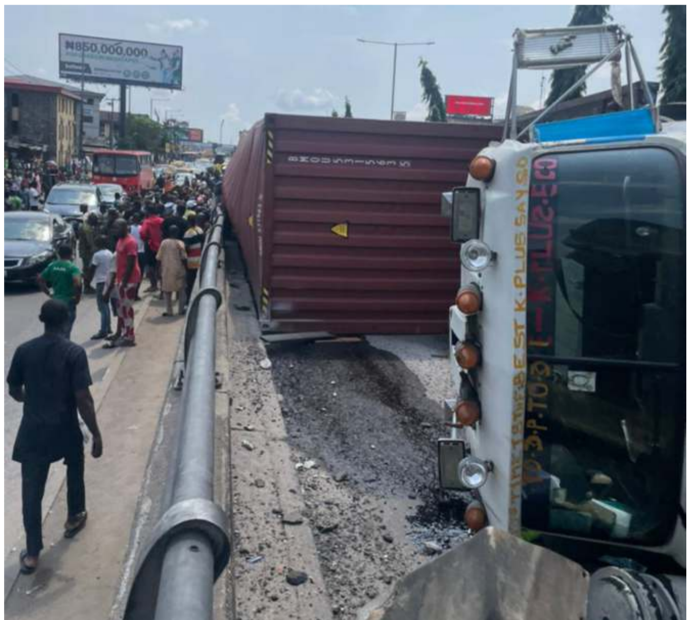
Truck falls on top of Commercial vehicle at Ojuelegba in Lagos on 29/01/23.

The Senator representing the Bauchi Central district explained that his administration if elected, would think outside the box to diversify its sources of internally generated revenues (IGR) in order to execute laudable policies and programmes of the government